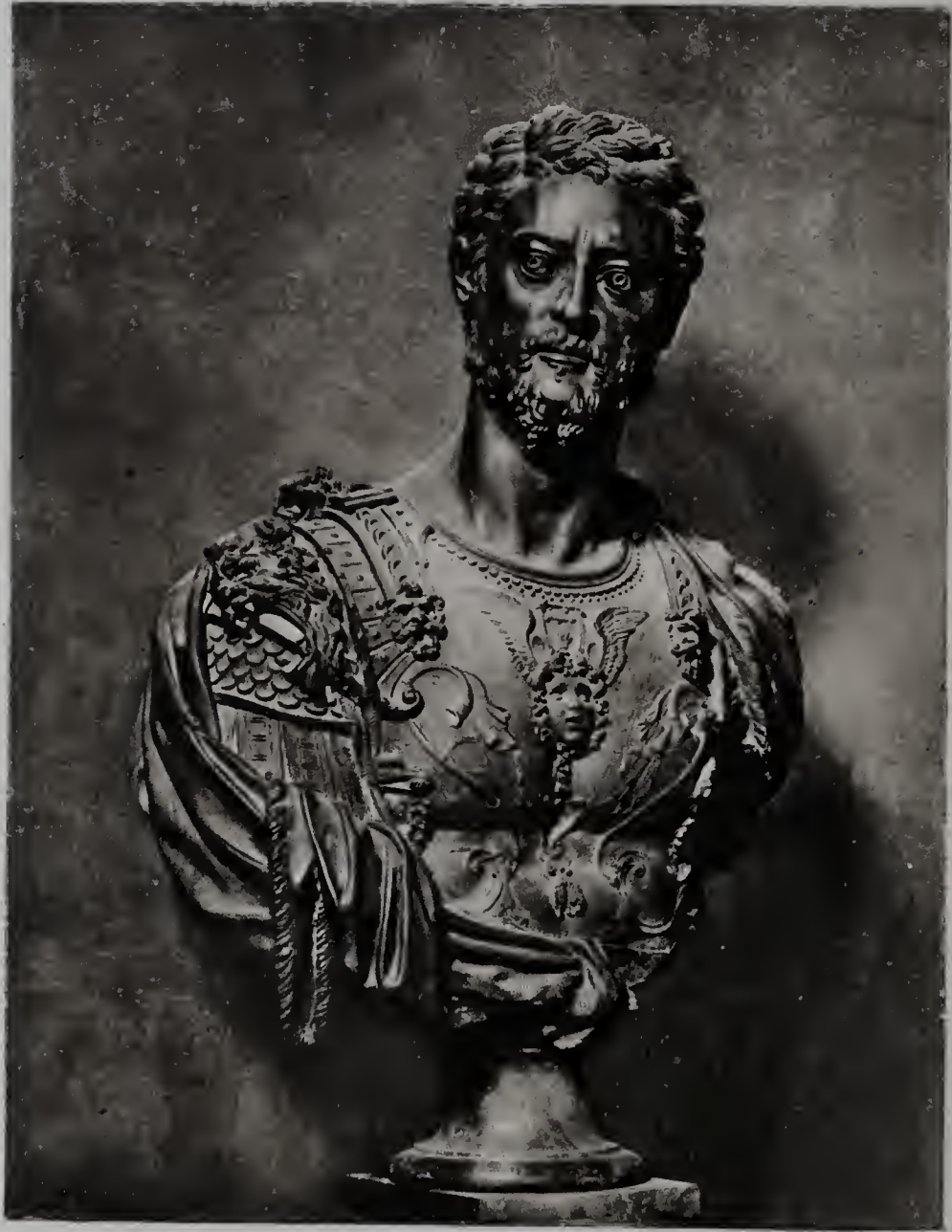
Duke Cosmo I