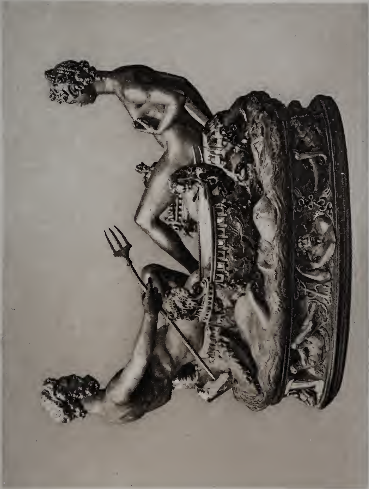
Sub-Cellar of Francis I.