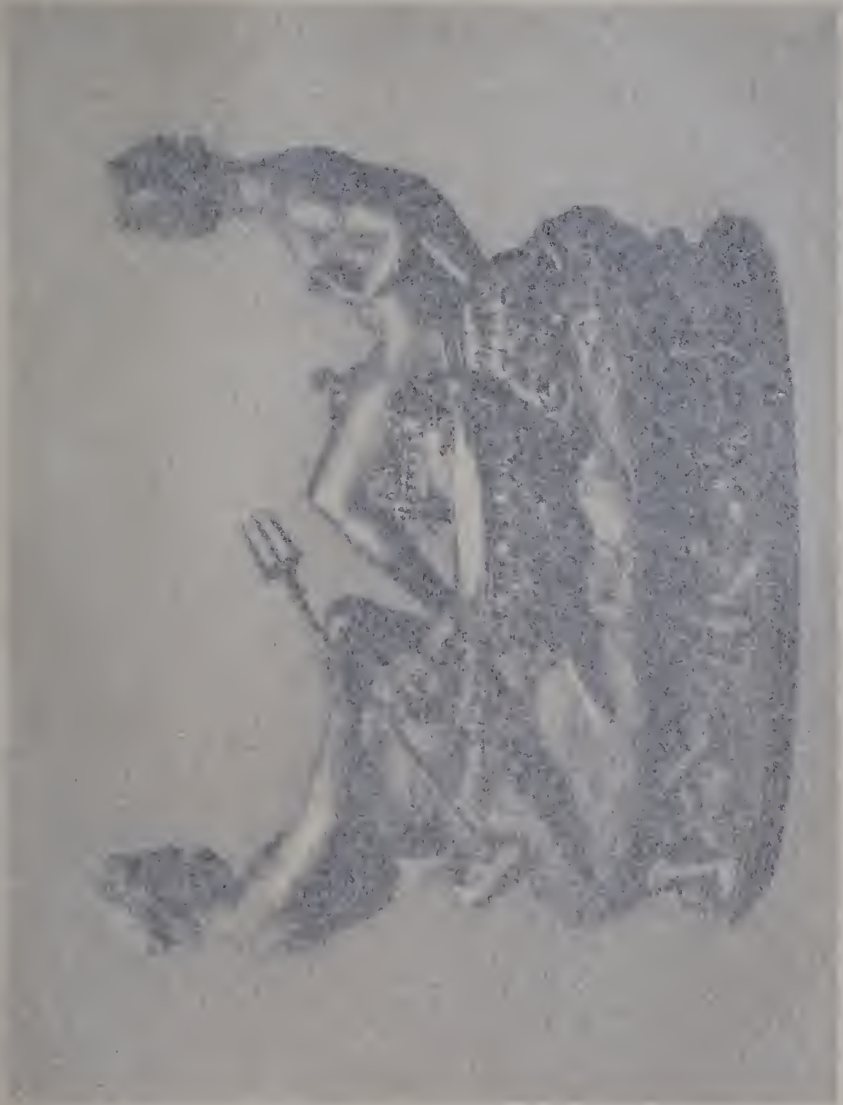
Sub-Culture of Hawaii