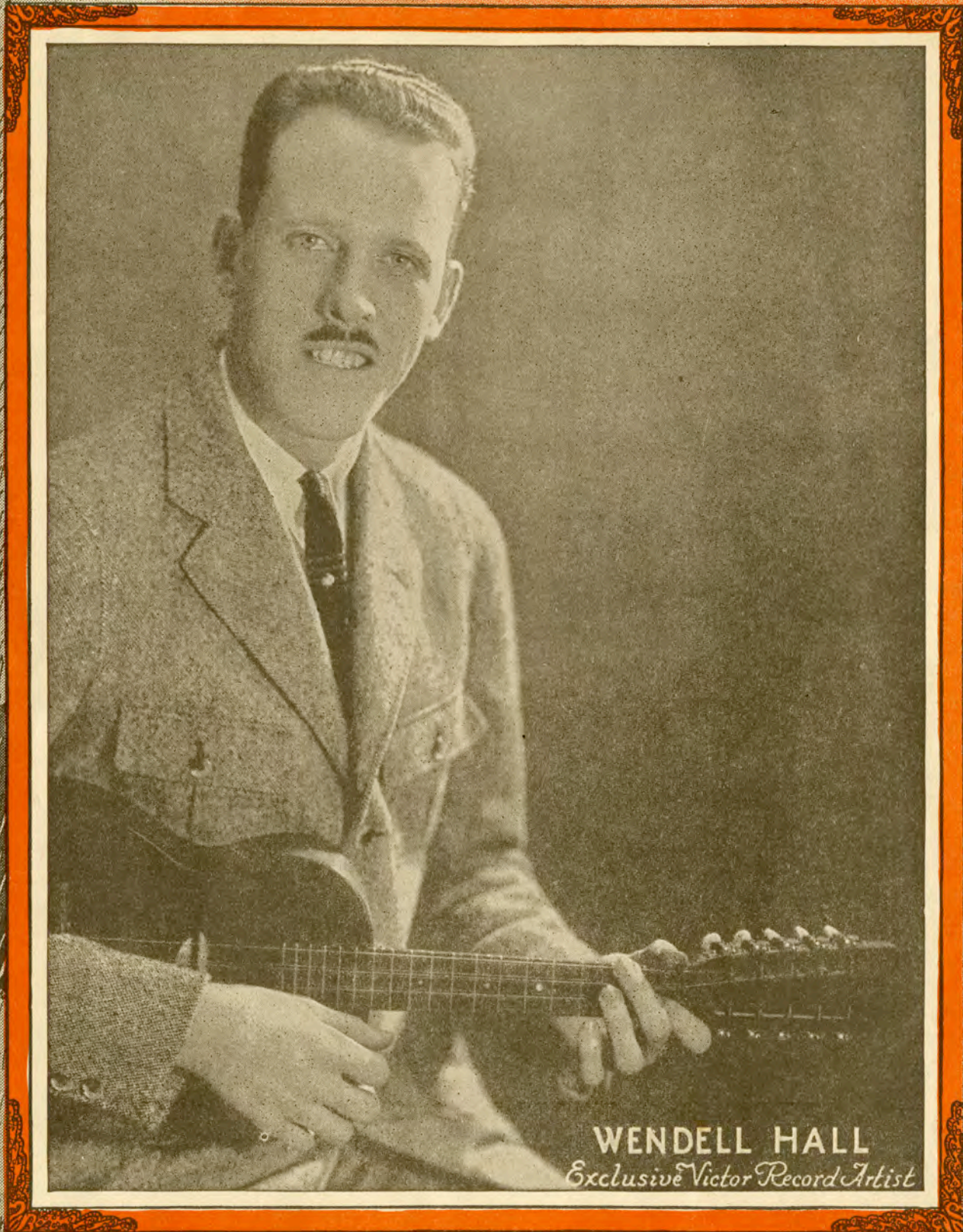
WENDELL HALL Exclusive Victor Record Artist

As sung by the National Radio Favorite - The Composer On Victor Records