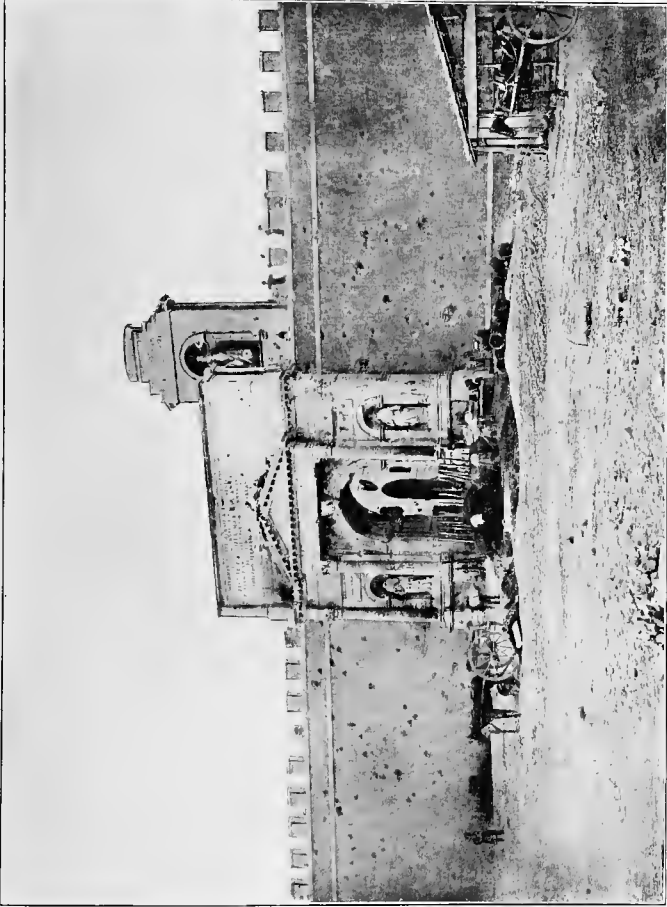
THE PORTA PIA.

After the entrance of the Italian Army in 1870.