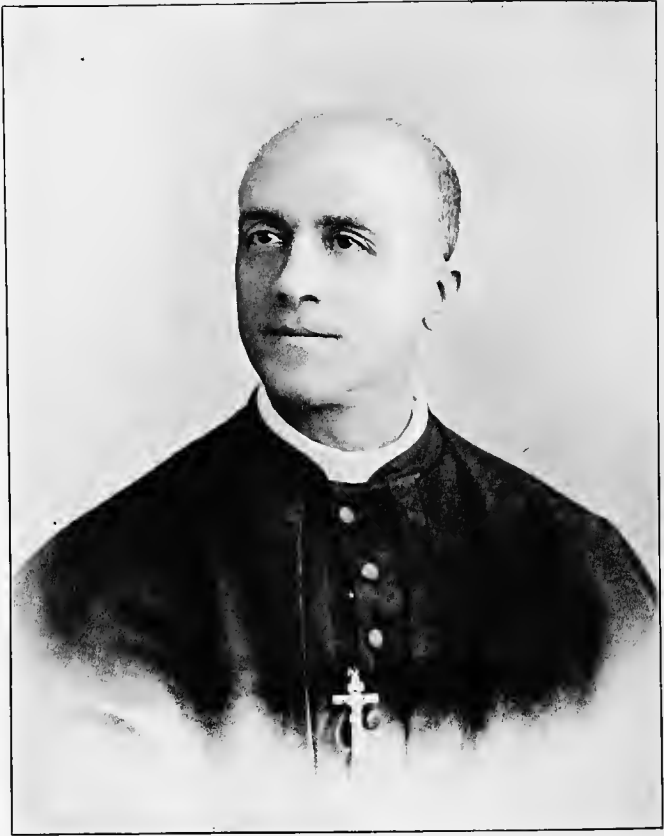
PADRE EDGARDO MORTARA.