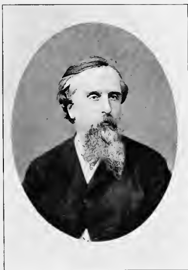
PRINCE FILIPPO DORIA PANFILI.