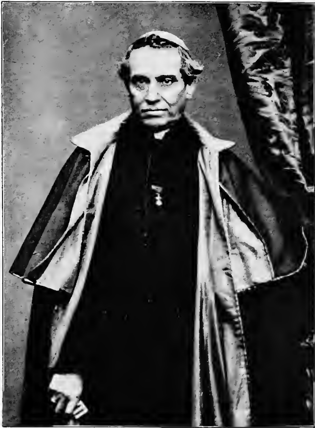
CARDINAL ANTONELLI. Secretary of State to Pius IX.