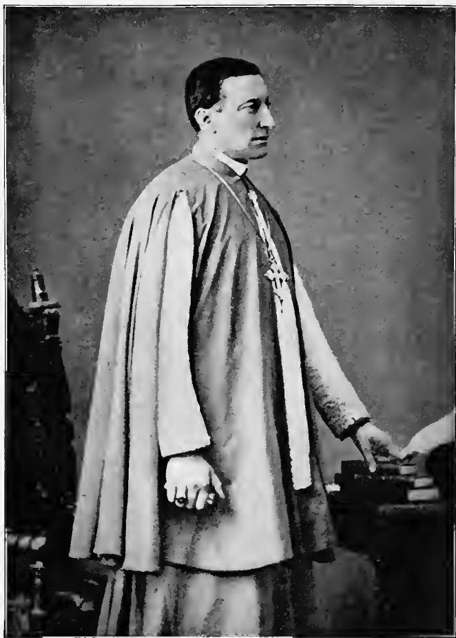
MGR. DE MERODE. War Minister of Pio Nono in 1860.