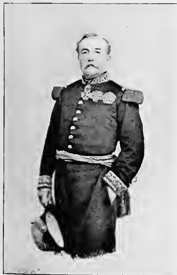
GENERAL DE LAMORICIÈRE.