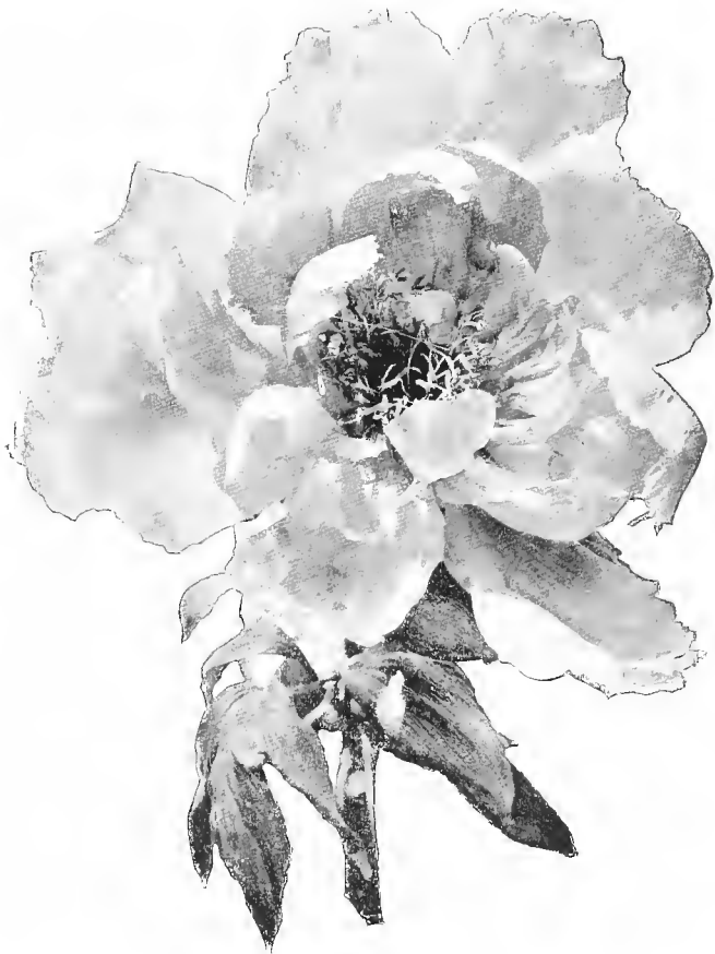
SINGLE FLOWER OF TREE PÆONY