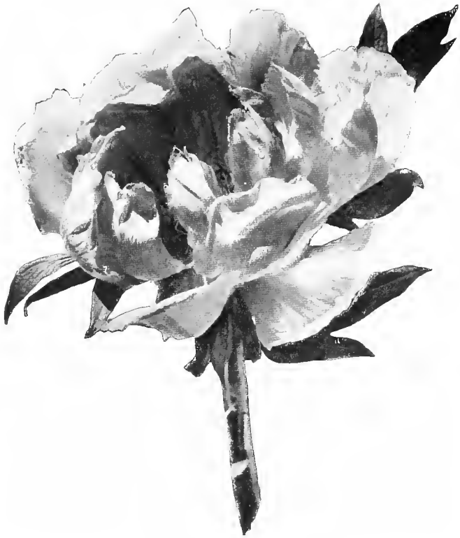
TREE PÆONY FLOWER, PARTLY OPEN