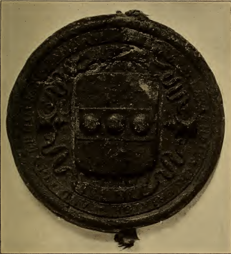
Great Seal of the Province of Pennsylvania. Arms of William Penn. 1699.