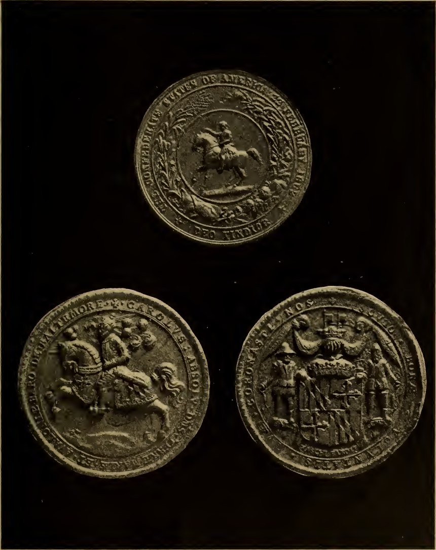
Confederate States. p. 46. Lord Baltimore. p. 44.