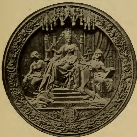
Queen Victoria. 1837 to 1901.