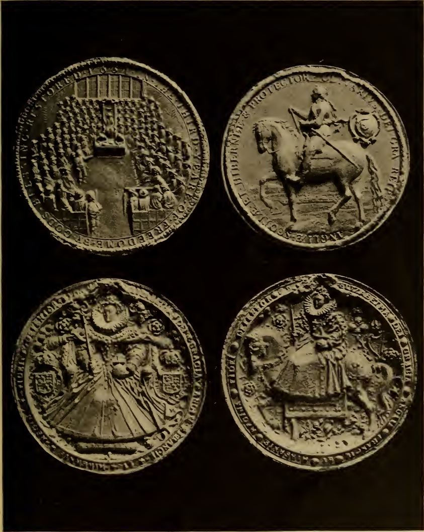
House of Commons. 1651. p. 32.