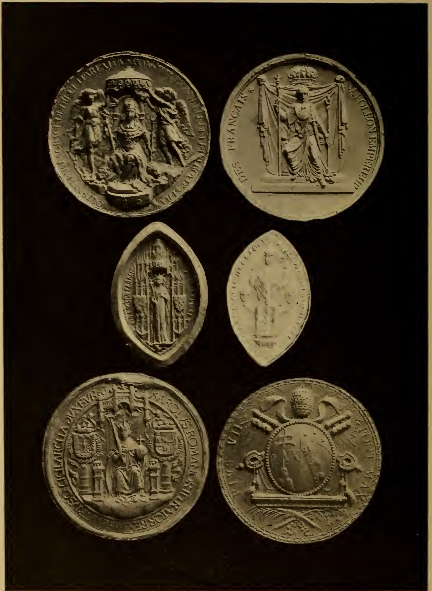
Louis XVI. p. 52.