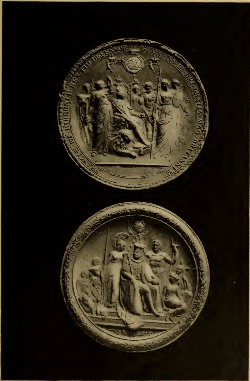
George III. p. 40. William IV. p. 42.