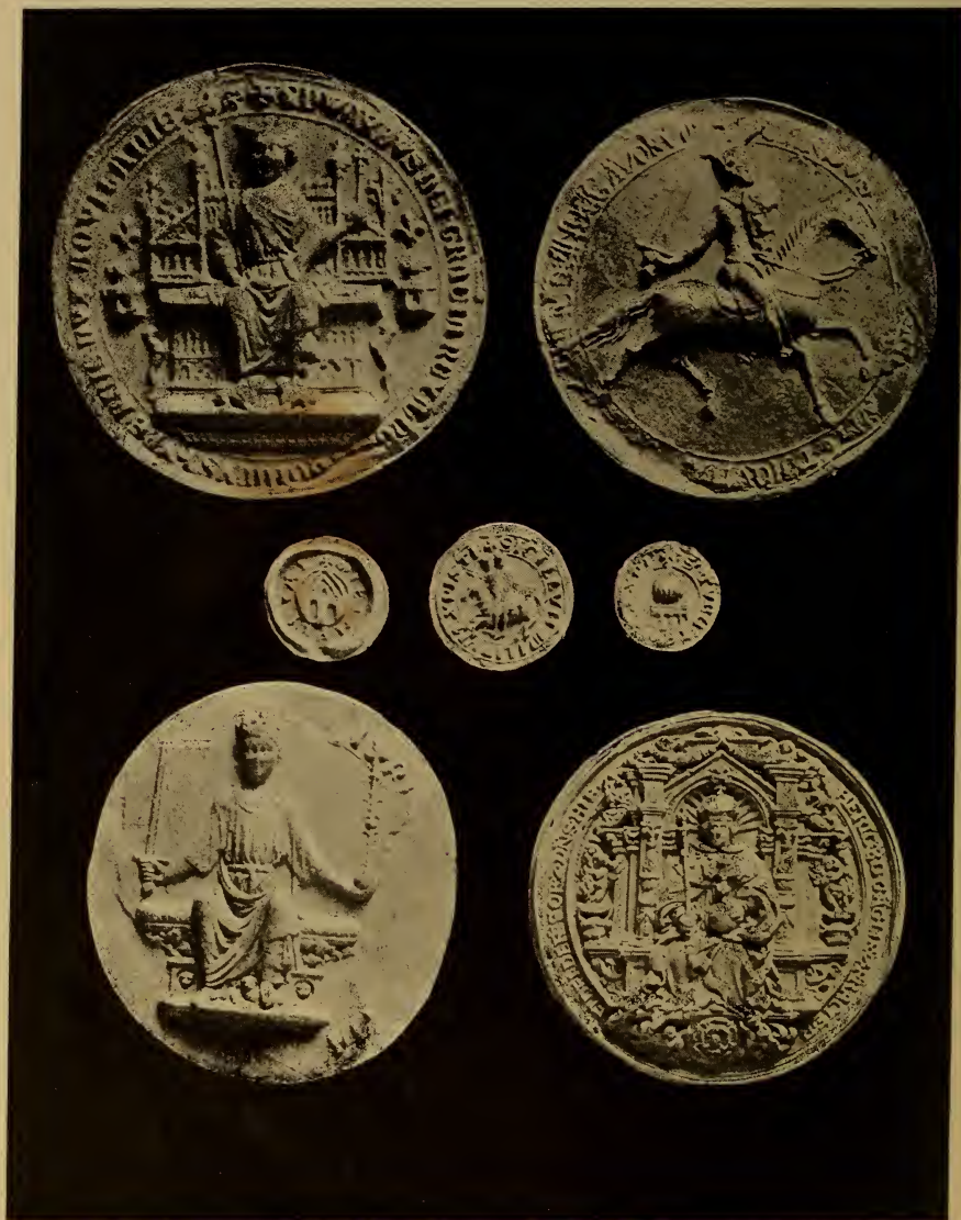
Edward I. p. 21.