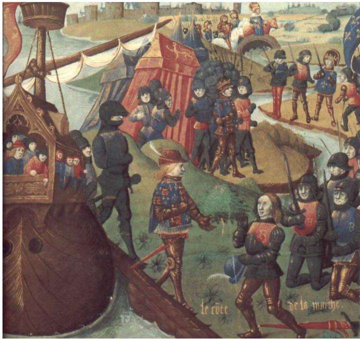
Figure 17 Henry III lands in Aquitaine, as shown in a 15th century from a later illumination.

Henry III was born on 1 October 1207 in Winchester Castle. He became King of England in 1216 aged only 9, when he succeeded his father, John. The barons who were in dispute with John quickly withdrew their support of Prince Louis as they considered Henry a safer option, especially as the regents who ruled for Henry declared their intention to rule by Magna Carta . Henry later grew into a thickset man of medium height, with a narrow forehead and a drooping left eyelid. When Henry reached maturity in 1227, the regency ended, and Henry was keen to restore royal authority.