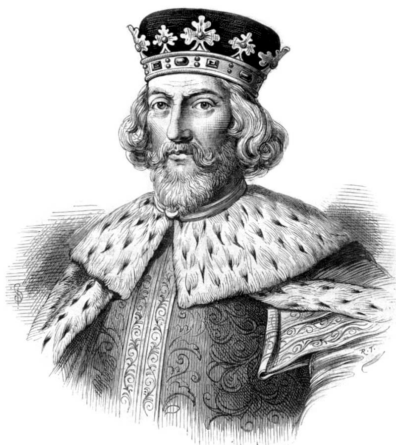
Figure 16 King John