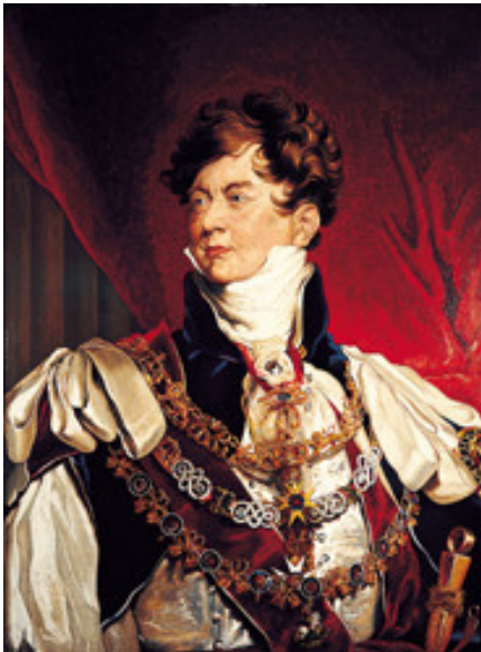
Figure 42 George IV

George IV was born in St James's Palace on 12 August 1762. George was the eldest son of George III and Charlotte of Mecklenburg-Strelitz. He was king of the United Kingdom of Great Britain and Ireland and Hanover from 29 January 1820 until his death on 26 June 1830. He had earlier served as Prince Regent when his father, George III, went insane. The Regency, which is the name given to this period, started in 1811 and ended with George III's death in 1820. It was marked by victory in the Napoleonic Wars in Europe. George was a stubborn monarch, often interfered in politics. For most of George's regency and reign, Lord Liverpool controlled the government as Prime Minister. George is often remembered largely for the extravagant lifestyle that he maintained as prince and monarch. He had a