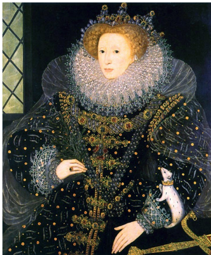
Figure 31 Elizabeth I

Elizabeth I was born on 7 September 1533. She was Queen of England and Queen of Ireland from 17 November 1558 until her death on 24 March 1603. Sometimes referred to as The