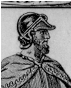
Figure 2 Artist's impression of Edward the Elder

Edward the Elder was king of England after Alfred. He reigned from 899 to his death in 924. Edward the Elder was Alfred's son.