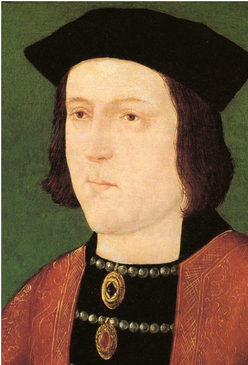
Figure 23 Edward IV