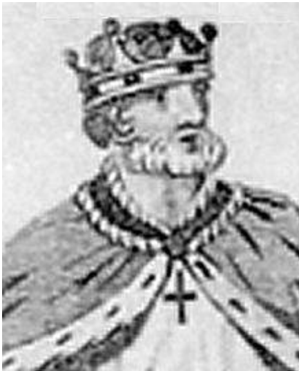
Figure 8 Edmund Ironside

Edmund II was born sometime between 988 and 993. He was king of England from 23 April 1016 until his death later that year on 30 November. He was nicknamed "Ironside" for his efforts to fend off the Danish invasion led by King Canute. After the death of Ethelred the Unready, although he succeeded to the throne, Edmund had little support from the London nobility, whilst Canute enjoyed greater support, particularly from the Southampton nobility.