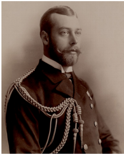
Figure 46 George V

George V was born at Marlborough House on 3 June 1865. His parents were Edward VII and Queen Alexandra. He was King of the United Kingdom of Great Britain and Ireland, King of the Commonwealth Realms and Emperor of India from 6 May 1910 until his death on 20 January 1936.