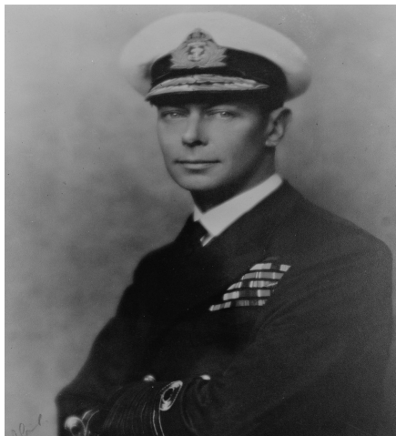
Figure 47 George VI

George VI was born at York Cottage on the Sandringham Estate in Norfolk on 14 December 1895. He was the second son of George V and Queen Mary. He was King of the United