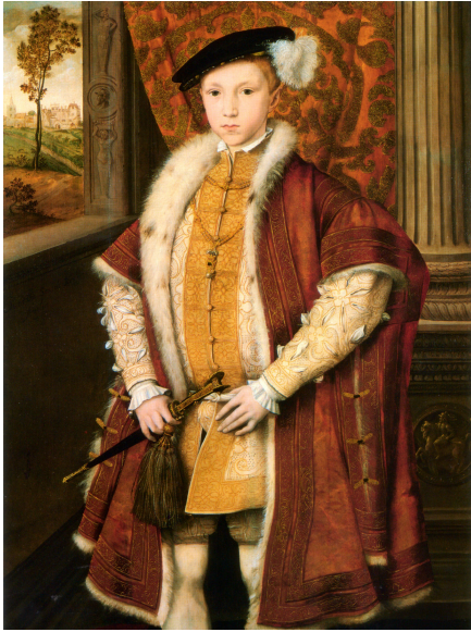
Figure 29 Edward VI

Edward VI was born at the Palace of Placentia in Greenwich on 12 October 1537. He was the son of Henry VIII and Jane Seymour. He was King of England and King of Ireland from 28 January 1547 until his death on 6 July 1553. Edward was England's first Protestant ruler. Although his father, Henry VIII, had broken the link between the English church and Rome, it was during Edward's reign that the decisive move was made from Catholicism to a form of Protestantism which came to be known as Anglicanism.