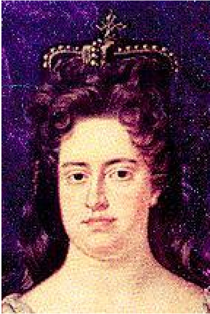
Figure 38 Anne

Anne was born in St James's Palace on 6 February 1665. She was the second daughter of James, who went on to become James II, and his first wife, Lady Anne Hyde. She was Queen of England, Scotland and Ireland from 8 March 1702 until her death on 1 August 1714. Anne was the last monarch of the House of Stuart. She was succeeded by a distant cousin, George I. Anne's reign saw the two party political system develop.