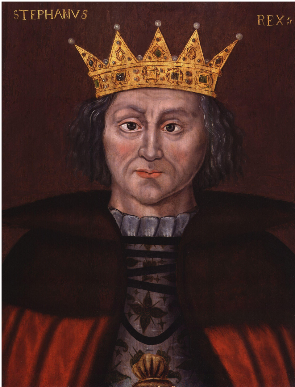
Figure 12 King Stephen.

Stephen was born around the year 1096 in Blois in France. He was the son of Stephen, Count of Blois, and Adela, daughter of William the Conqueror. He was the last Norman King of England, and reigned from 1135 to 1154, when he was succeeded by his cousin, Henry II, the first of the Angevin or Plantagenet Kings. At around the age of 10, Stephen went to be brought up at the English court of his uncle, King Henry I. After marrying a daughter of the Count of Boulogne, who was called Matilda, he became joint ruler of