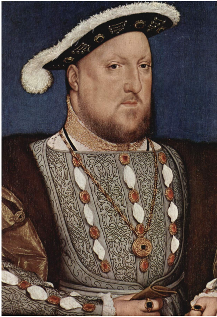
Figure 27 Henry VIII

Henry VIII was born at the Palace of Placentia at Greenwich on 28 June 1491. Henry VIII was the third child of Henry VII and Elizabeth of York. Only three of Henry VII's six siblings, Arthur, Margaret and Mary, survived infancy. In 1493, the young Henry was appointed Constable of Dover Castle and Lord Warden of the Cinque Ports. In 1494, he was created Duke of York. He was later appointed Earl Marshal of England and Lord Lieutenant of Ireland, though still a child. When his brother Arthur died in 1502, Henry found himself heir-apparent to the throne and soon after, he was created Prince of Wales. When his father died in 1509, Henry became King of England and Lord (later King) of Ireland, positions he held till his death on 28 January 1547.