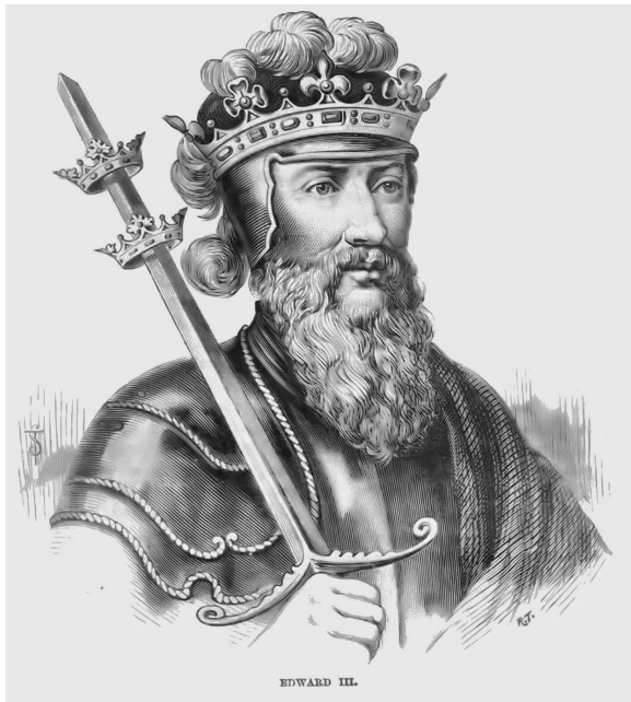
Figure 18 Edward III

Edward III was born at Windsor Castle on 13 November 1312. He was king from 1327 until his death in 1377. He was one of the most successful English kings of mediaeval times. Edward's reign was marked by an expansion of English territory through wars in Scotland and France. His reign was marked by the start of the Hundred Years' War.