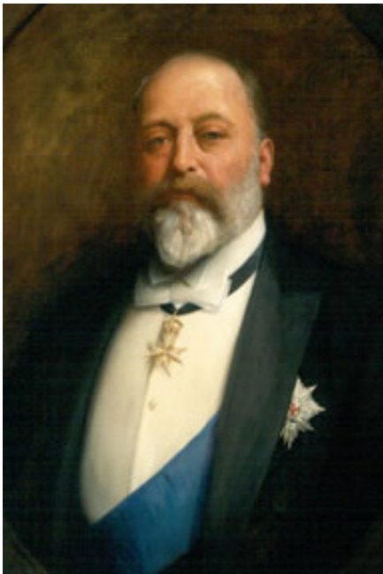
Figure 45 Edward VII

Edward VII was born at Buckingham Palace on 9 November 1841. His parents were Queen Victoria and Prince Albert. Edward VII was King of the United Kingdom of Great Britain and Ireland, King of the Commonwealth Realms and the Emperor of India from 22 January 1901 to his death on 6 May 1910. He was the first British monarch of the House of Saxe-Coburg-Gotha. Despite taking the name "King Edward", he was known to his family as "Bertie" as his first name was Albert.