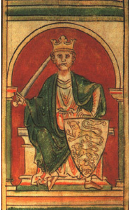
Figure 15 Richard the Lionheart

Richard I was born in 1157 in Oxford. He was King of England from 1189 to his death in 1199, and is often known as Richard the Lionheart or its French equivalent, Coeur de Lion .