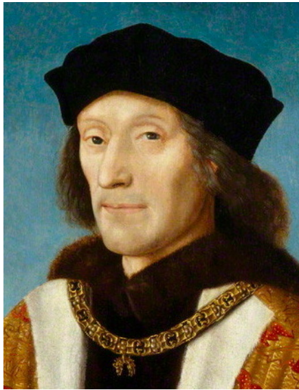
Figure 26 Henry VII

Henry VII , also known as Henry Tudor, was born at Pembroke Castle on 28 January 1457. He was King of England and Lord of Ireland from 22 August 1485 until his death on 21 April 1509. He was the founder of the House of Tudor. He was the only son of Edmund Tudor, who died two months before Henry was born. He spent much of his early life with his uncle Jasper Tudor. When Edward IV returned to the throne in 1471, Henry VII was forced to flee to Brittany, where spent most of the next fourteen years. After his second cousin's revolt failed in 1483, Henry VII became the leading Lancastrian contender for the throne of England. With French help, Henry made an unsuccessful attempt to land in England but turned back after coming across Richard III's forces on the Dorset coast. Henry then gained the support of the in-laws of the late Yorkist King Edward IV and landed with a largely French and Scottish force in Pembrokeshire, and marched into England, with his uncle, Jasper Tudor, and the experienced Earl of Oxford. Henry's forces decisively defeated the Yorkists at the Battle of Bosworth Field on 22 August 1485 when several of Richard's key allies, switched sides or deserted the field of battle. Richard III himself died at the battle. This effectively ended the long-running Wars of the Roses, though it wasn't the final battle.