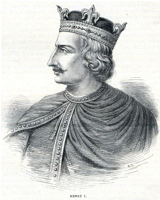
Figure 11 Henry I depicted in Cassell's History of England (1902)

In 1101, a year after Henry became king, his older brother, Robert, invaded England in an attempt to become king. They agreed a peace in the Treaty of Alton, in which Robert accepted Henry as King of England and returned peacefully to Normandy. In return Henry agreed to pay Robert 2000 marks each year. Four years later, though, Henry took an army across the English Channel. In 1106, he defeated his brother's Norman army decisively at Battle of Tinchebray. He imprisoned his brother Robert, and claimed the Duchy of Normandy as a possession of England, as a result reuniting his father's lands.