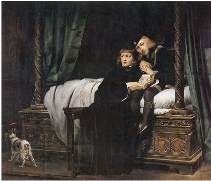
Figure 24 King Edward V and the Duke of York in the Tower of London

Edward V was born in sanctuary within Westminster Abbey on 4 November 1470, while his mother was taking refuge from the Lancastrians who were then in charge of the kingdom while his father, the Yorkist King Edward IV of England, was out of power. After his father returned to the throne, he was made Prince of Wales in June 1471 and appeared with his parents on state occasions. Edward IV had set up a Council of Wales and the Marches, and sent his son to Ludlow Castle to be its president. The prince was at Ludlow when news came of his father's sudden death. Therefore Edward became king on 9 April 1483, aged only 12.