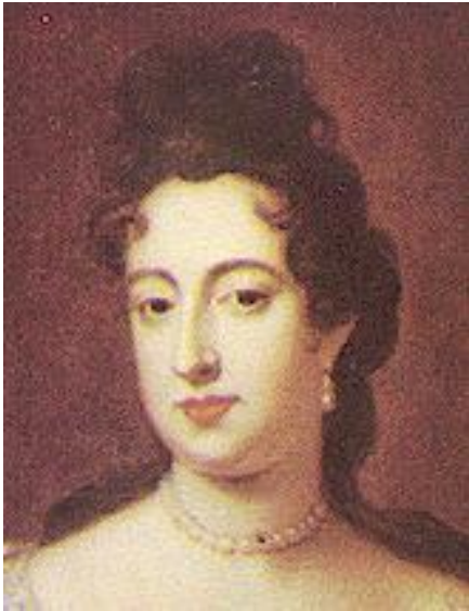
Figure 37 Mary II

Mary II was born in London on 30 April 1662. She was the eldest daughter of James II and his first wife, Lady Anne Hyde. She reigned as Queen of England and Ireland from 13 February 1689 until her death on 28 December 1694, and as Queen of Scotland from 11 April 1689 until her death. Mary came to the throne after the Glorious Revolution. Mary reigned jointly with her husband and first cousin, William III, who became the sole ruler upon her death. Mary, although a sovereign in her own right, did not wield power during most of her reign. She did, however, govern the realm when her husband was abroad fighting wars.