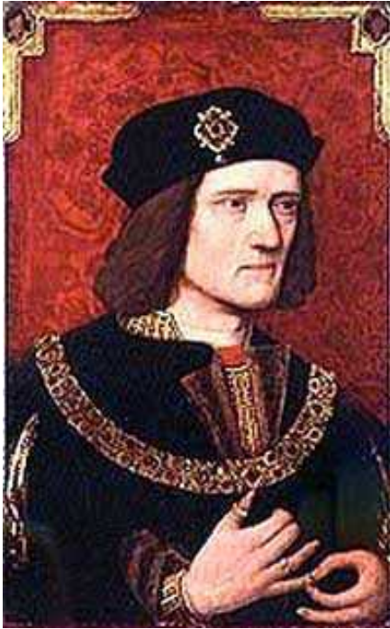
Figure 25 Richard III

Richard III was born at Fotheringay Castle on 2 October 1452. He was the fourth surviving son of Richard Plantagenet, the 3rd Duke of York, who was a strong claimant to the throne of King Henry VI. He has been portrayed as having a withered arm, limp and a crooked back, but this is most probably an invention from many years later. Richard was King of England from 1483, when he effectively deposed his nephew, Edward V. A rebellion rose against Richard later that year, and he died at the Battle of Bosworth Field in 1485. He is the last English king to die in battle, and he was succeeded by the winner of the battle, Henry Tudor.