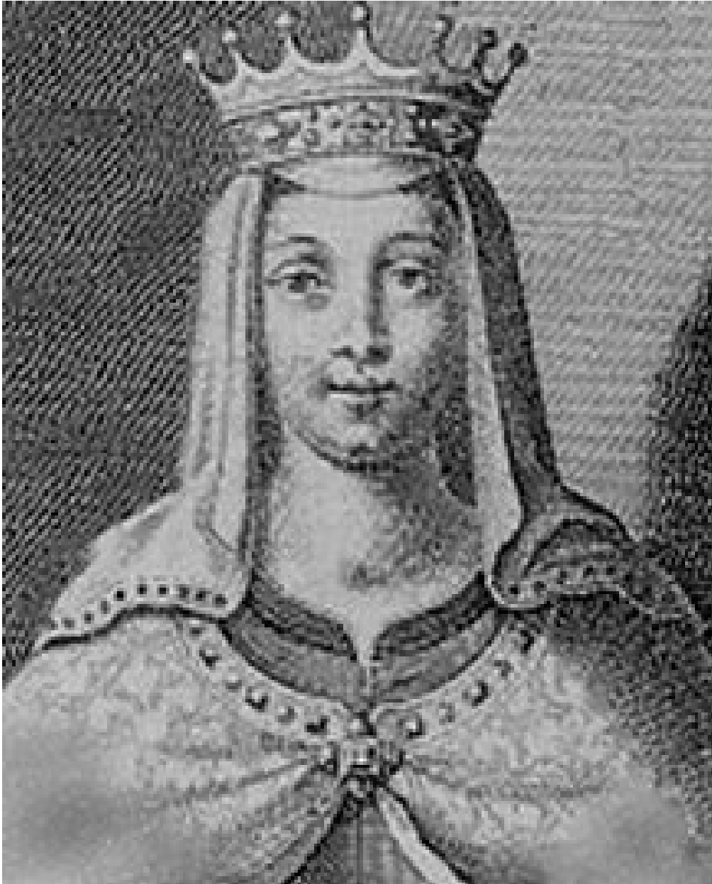
Figure 13 Empress Matilda (or Maud)

Empress Maud is the title by which Matilda , the only daughter and second child of King Henry I of England, is known. This is because Matilda was a very common name at the