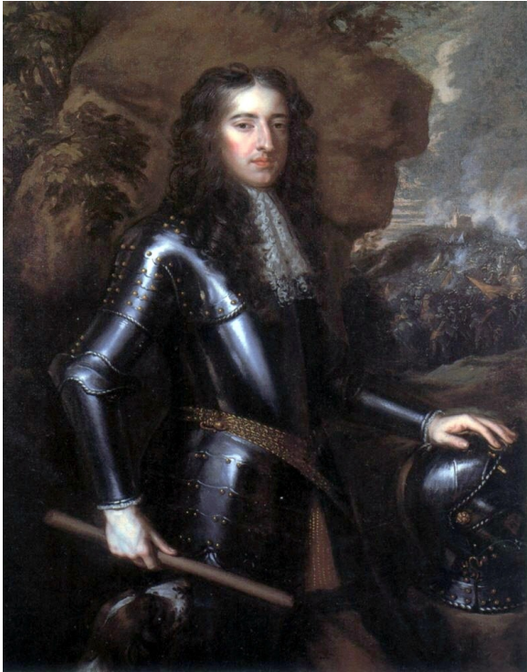
Figure 36 William III

William was born in The Hague in the Netherlands on 14 November 1650. He was the son of William II, Prince of Orange, and Mary Stuart. He was Dutch aristocrat and a Protestant Prince of Orange from his birth. He was King William III of England and of Ireland from 13 February 1689, and William II, King of Scots from 11 April 1689 in each case until his death on 8 March 1702.