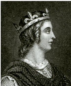
Figure 5 Edwy All-Fair

Edwy All-Fair or Eadwig was born in Wessex around the year 941 and became King of England in 955 when the nobility chose him to succeed his uncle, King Edred. Edwy was the eldest son of King Edmund I. His short reign was marked by disputes with his family; the Thanes, who were the king's retainers; and the Roman Catholic Church. Frustrated by the king's impositions, and supported by Odo, the Archbishop of Canterbury, the Thanes of Mercia and Northumbria switched their allegiance to Edwy's brother Edgar in 957. Edwy was defeated in battle at Gloucester, but rather than see the country descend into civil war,