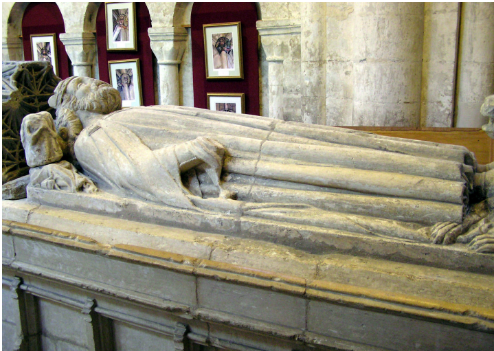
Figure 3 The tomb of King Athelstan in Malmesbury Abbey. There is nothing in the tomb beneath the statue, the relics of the king having been lost in the Dissolution of the Monasteries in 1539.

Athelstan was born around the year 895 and became king, first of Mercia, in 924 and then of Wessex in 925. He was the son of King Edward the Elder. Political alliances were high on Athelstan's agenda. A year after becoming king, he had a sister married to Sihtric, the Viking King of York. Sihtric died a year later, and Athelstan took the chance to capture Northumbria. This was a bold move, and made him the king of a larger territory than any Anglo-Saxon king before him, roughly equivalent to modern England, except for Cornwall. The rulers of the territories neighbouring Athelstan's then appear to have submitted to him at Bamburgh. The Anglo-Saxon Chronicle noted that these included " Hywel, King of the