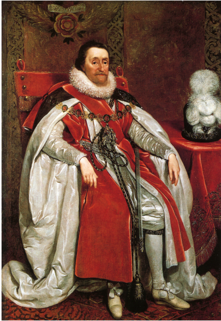
Figure 32 James I

James I was born at Edinburgh Castle on 19 June 1566. James was the only child of Mary, Queen of Scots and her second husband, Lord Darnley. James was a direct descendant of Henry VII through his great-grandmother Margaret Tudor, sister of Henry VIII. He ruled in Scotland as James VI from 24 July 1567 until his death on 27 March 1625. He was also King of England and King of Ireland as James I from 24 March 1603 until his death. He was the first monarch of England from the House of Stuart.