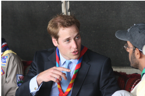
Figure 50 Prince William of Wales

Prince William of Wales was born at St. Mary's Hospital, Paddington on 21 June 1982. His parents are Charles, Prince of Wales and Lady Diana Spencer. He is second in the line of succession to the British throne.