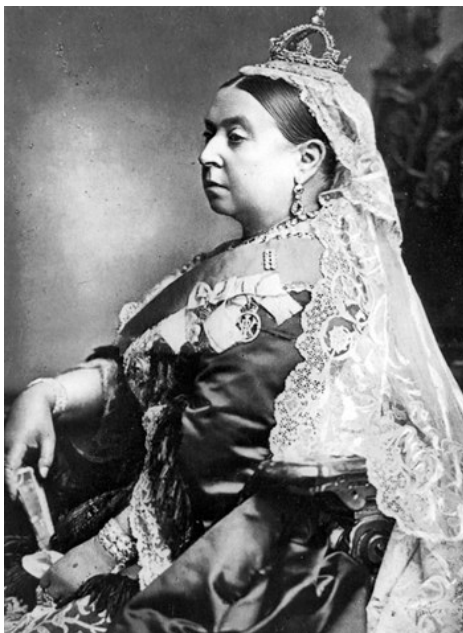
Figure 44 Victoria

Victoria was born on 24 May 1819. She was Queen of the United Kingdom of Great Britain and Ireland from 20 June 1837 and Empress of India from 1 January 1877 until her death on 22 January 1901. Her reign lasted more than sixty-three years, longer than that of any other British monarch. The reign of Victoria was marked by a great expansion of the British Empire. The Victorian Era was at the height of the Industrial Revolution, a period of significant social, economic and technological change in the United Kingdom. In that period the United Kingdom became the largest superpower the world had ever seen. Victoria was the last monarch of the House of Hanover, as her son and successor belonged to House of Saxe-Coburg and Gotha.