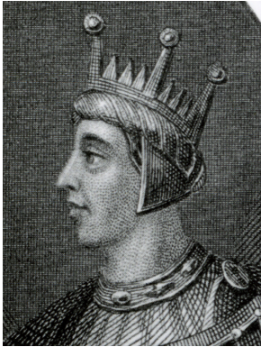
Figure 4 King Edred

King Edred or Eadred was born in Wessex around the year 923 and became King of England in 946. He was a son of King Edward the Elder. Like both of his older brothers, Edred enjoyed military success over the Vikings. He was a religious man, but his health was poor and he could barely eat his food. He died on 23 November 955 at Frome in Somerset, and was buried at Winchester Cathedral. He never married, and was succeeded by his nephew, Edwy.