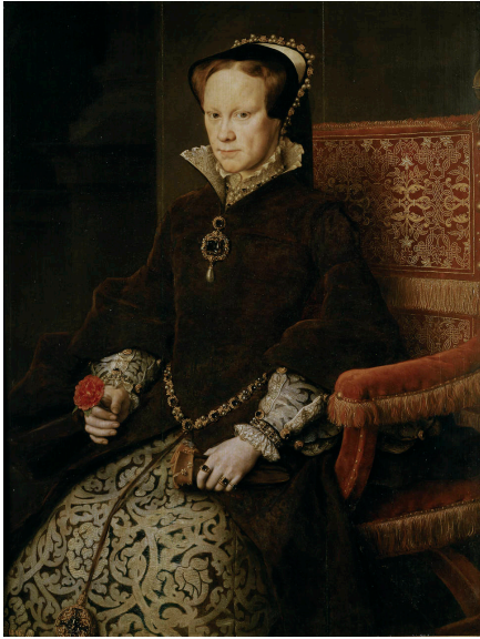
Figure 30 Mary I

Mary I (also known as Mary Tudor) was born at the Palace of Placentia in Greenwich on 18 February 1516. She was the only surviving child of Henry VIII and Catherine of Aragon. She was Queen of England and Queen of Ireland from 6 July 1553 (or 19 July 1553 if you count Lady Jane Grey as Queen Jane of England ) until her death on 17 November 1558. Mary is best remembered for her attempt to return England from Protestantism to Roman Catholicism. To this end, she had almost three hundred religious dissenters executed, giving her the nickname Bloody Mary. Her religious policies were in many cases reversed by her successor and half-sister, Elizabeth I.