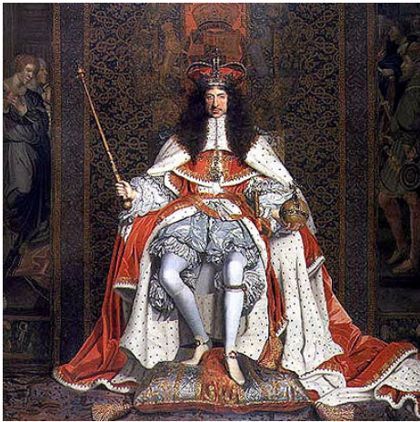
Figure 34 Charles II

Charles II was born in St James's Palace on 29 May 1630. Charles was the eldest surviving son of Charles I and Henrietta Maria of France. He was the King of Scots from 30 January 1649 and King of England and Ireland from 29 May 1660 until his death on 6 February 1685. Unlike his father Charles I, Charles II was skilled at managing the Parliament of England, so much so that Charles is still considered one of England's greatest kings. It was during his reign that the Whig and Tory political parties developed. He famously fathered numerous illegitimate children, of whom he acknowledged fourteen. Known as the "Merry Monarch", Charles was a patron of the arts.