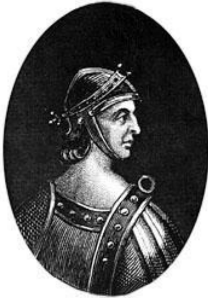
Figure 9 Harold Harefoot

Harold I Harefoot was born in Denmark around the year 1012. earned the name "Harefoot" for his speed and skill at hunting. He was the illegitimate son of King Canute by his concubine Aelgifu. Harold's younger half-brother Harthacnute, the son of Canute and his queen, Emma of Normandy, was the legitimate heir to the thrones of both Denmark and England at Canute's death in 1035. However, because Denmark was threatened with invasion from Norway, Harthacnute was unable to travel to England and instead sent as regents Emma and Harold Harefoot. Harold took effective power in England and in 1036 secured recognition by Harthacnute as regent during the latter's absence in Denmark. Harold and Emma argued over who should govern the kingdom. The powerful Earl Godwin sided with Harold, and in 1037, after Emma had fled, Harold seized the treasury at Winchester and thus the throne, and was crowned at Oxford.