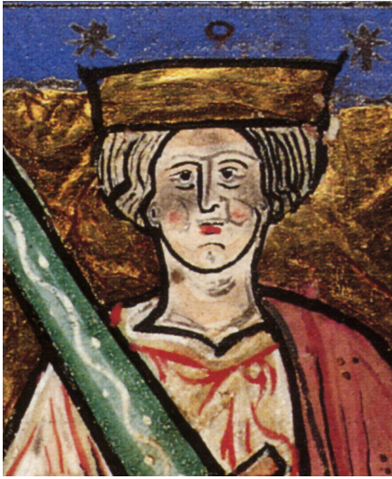
Figure 7 Ethelred the Unready

Ethelred the Unready was born around the year 968 in Wessex and died in 1016. He was King of England between 978 and 1013, and then again between 1014 and 1016. He is also known as King Ethelred II. His nickname "The Unready" does not mean that he was ill-prepared, but comes from the Anglo-Saxon unræd meaning "without counsel" or "indecisive". This could also be interpreted as a pun on his name, Æðelræd , which may be understood to mean "noble counsel". Ethelred became king when he was aged about 10 after the death of his father, King Edgar, and the murder of his half-brother King Edward.