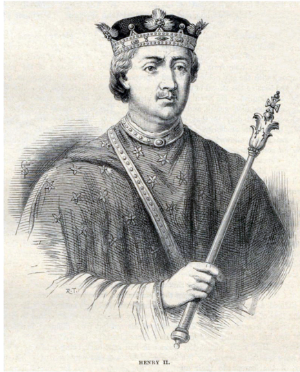
Figure 14 King Henry II

Henry II was born on 5 March 1133 in Le Mans. He ruled as Count of Anjou, Duke of Normandy and as King of England from 1154 until his death in 1189. Following the disputed reign of King Stephen, Henry's reign saw efficient consolidation. Henry II has a reputation as one of England's greatest medieval kings. At various times he controlled parts of Wales, Scotland, eastern Ireland, and western France. He was the first of the Plantagenet or Angevin Kings. Before becoming king Henry already controlled Normandy and Anjou. Whilst king, he had an empire, known as the Angevin Empire, that stretched from the Solway Firth almost to the Mediterranean and from the Somme to the Pyrenees. His mother was Empress Matilda, and his father was her second husband, Geoffrey of Anjou. He was brought up in Anjou, which is where the name Angevin comes from, though he visited England in 1149 to help his mother with her claim to the English throne.