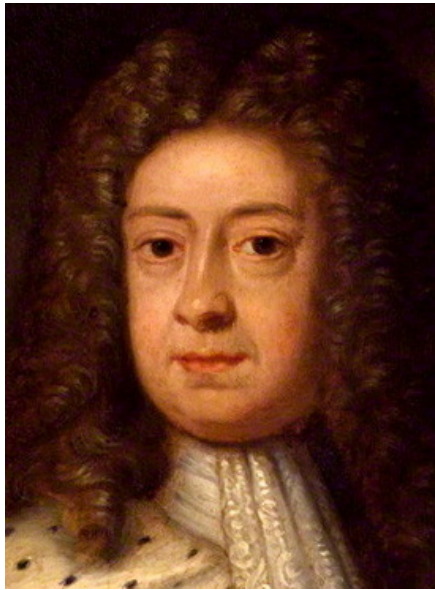
Figure 39 George I

George I was born in Hanover, Germany on 28 May 1660. He was the eldest son of Ernst August, Duke of Brunswick-Lüneburg, a German prince, and of his wife, Sophia. He was Duke of Brunswick-Lüneburg from 23 January 1698, and King of Great Britain and King of Ireland from 1 August 1714, until his death on 11 June 1727. He was also a Prince Elector of the Holy Roman Empire. George I was the first Hanoverian monarch of Great Britain and Ireland, but was not a fluent speaker of English. He spoke his native German, and was ridiculed for this by his British subjects. During his reign, the powers of the monarchy reduced as the modern Cabinet system of government developed. During the later years of George's reign, the real power was held by Sir Robert Walpole, who is now generally thought of as being Britain's first prime minister.