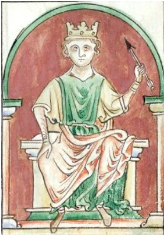
Figure 10 According to William of Malmesbury, William Rufus was " thickset and muscular with a protruding belly; a dandy dressed in the height of fashion, however outrageous, he wore his blond hair long, parted in the centre and off the face so that his forehead was bare; and in his red, choleric face were eyes of changeable colour, speckled with flecks of light ".

William II was born in Normandy sometime between the years 1056 and 1060. He was nicknamed " Rufus ", which is Latin for "red", perhaps because of his red-faced appearance. He was the second son of William the Conqueror and was King of England from 1087 until 1100, with powers also over Normandy, and influence in Scotland. He was less successful in extending his control in Wales.