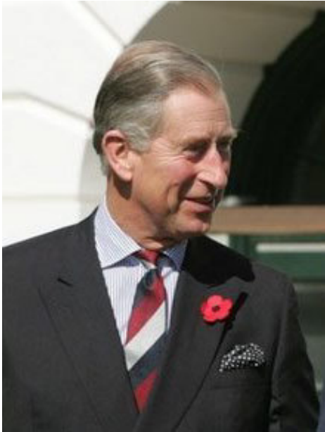
Figure 49 Prince Charles, the Prince of Wales

Prince Charles, who was born at Buckingham Palace on 14 November 1948, is the eldest son of Elizabeth II and Prince Philip, Duke of Edinburgh. He is the heir to the throne of the United Kingdom. The Prince of Wales is well known for his extensive charity work, particularly for the Prince's Trust. He also carries out a full schedule of royal duties, and increasingly is taking on more royal roles from his aging mother. The Prince is also well known for his high profile marriages to the late Lady Diana Spencer and subsequently to Camilla, The Duchess of Cornwall.