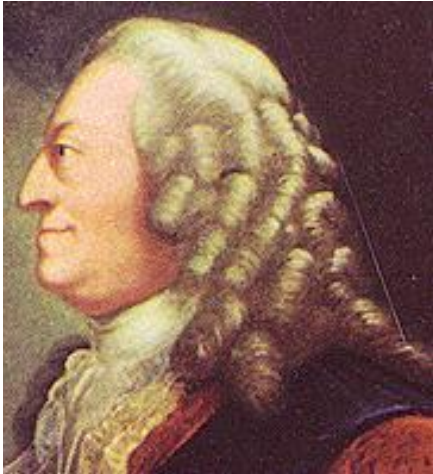
Figure 40 George II

George II was born at Schloss Herrenhausen, Hanover on 10 November 1683. He was King of Great Britain and Ireland, Duke of Brunswick-Lüneburg and Prince-Elector of the Holy Roman Empire from 11 June 1727 until his death on 25 October 1760. He was the second British monarch of the House of Hanover, and the last British monarch to personally lead his troops into battle (at Dettingen in 1743). He was also the last British monarch to have been born outside of Great Britain. George II was famous for his numerous conflicts with his father and afterwards with his son. His relationship with his wife was much better, despite his numerous mistresses. George II exercised little control over policy during his early reign, the government instead being controlled by Great Britain's first (unofficial) "Prime Minister", Sir Robert Walpole.