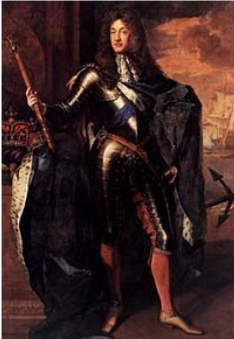
Figure 35 James II

James II of England and VII of Scotland was born at St James's Palace on 14 October 1633. He was the second surviving son of Charles I and Henrietta Maria of France. He became King of England, King of Scots and King of Ireland on 6 February 1685. He was the last Roman Catholic monarch to reign over England, Scotland and Ireland. Some of his subjects distrusted his religious policies and alleged despotism, leading a group of them to depose him in the Glorious Revolution. He was replaced not by his Roman Catholic son, James Francis Edward, but by his Protestant daughter and son-in-law, Mary II and William III, who became joint rulers in 1689. The belief that James remained the legitimate ruler became known as Jacobitism (from Jacobus , the Latin for James). However, James did not try to return to the throne, instead living the rest of his life under the protection of King Louis XIV of France. His son James Francis Edward Stuart and his grandson Charles Edward Stuart ( Bonnie Prince Charlie ) attempted to restore the Jacobite line after James's death on 16 September 1701, but failed.