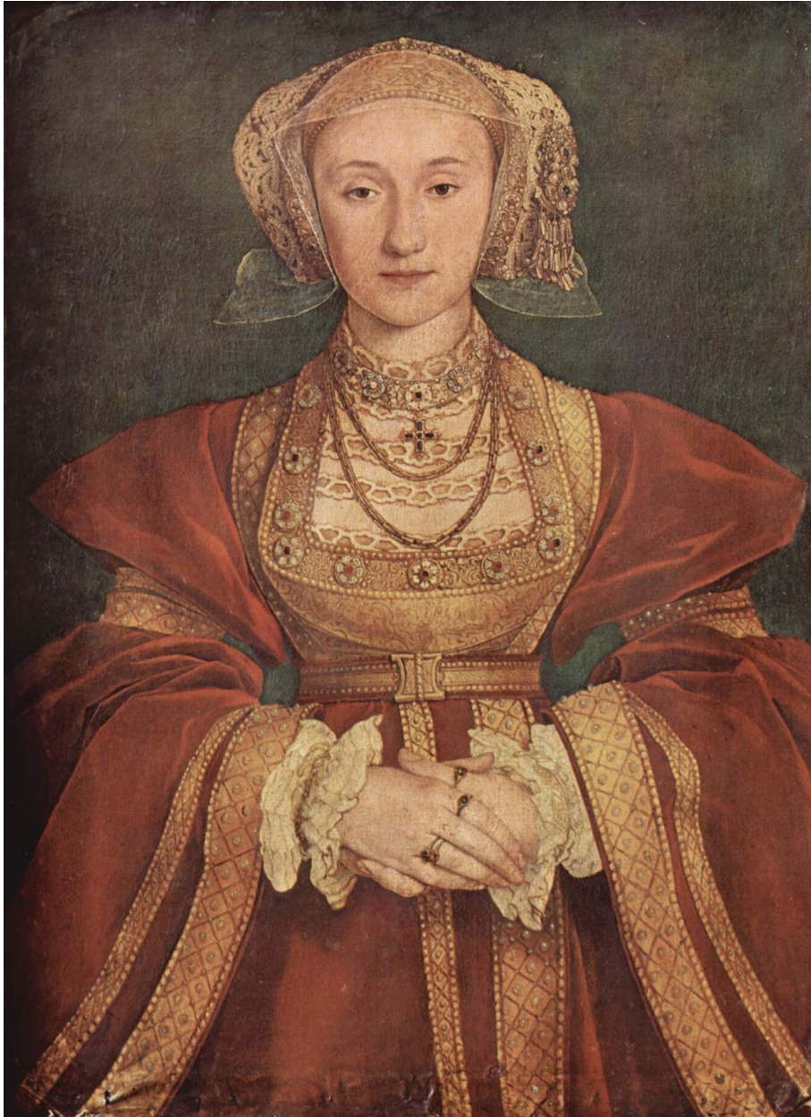
Figure 28 Henry was shown the above picture of Anne of Cleves.

Henry's only surviving son, Edward, was not a healthy child. Therefore, Henry wanted to marry again to ensure that a male could succeed him. Thomas Cromwell suggested Anne of Cleves, the sister of the Protestant Duke of Cleves, who was seen as an important ally in case of a Roman Catholic attack on England. Hans Holbein the Younger was dispatched to Cleves to paint a portrait of Anne for the King. After seeing Holbein's flattering portrayal, and hearing a complimentary description of Anne from his courtiers, Henry agreed to wed Anne. On Anne's arrival in England, Henry is said to have found her utterly unattractive, calling her a "Flanders Mare". She was painted totally without any signs of her pockmarked