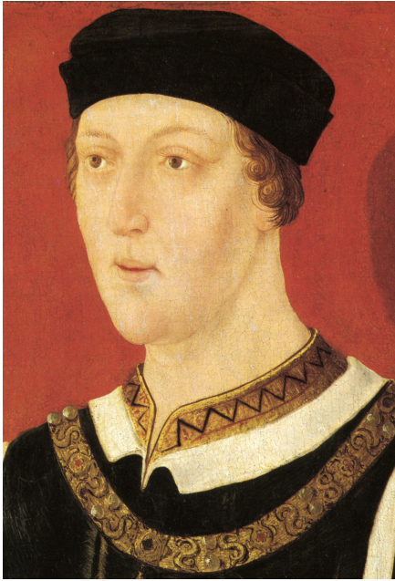
Figure 22 Henry VI

Henry VI was born at Windsor Castle on 6 December 1421, the son of King Henry V. He was King of England from 1422, when he was nine months old. In 1423, parliament was called and a regency council was appointed. Humphrey, Duke of Gloucester, Henry IV's youngest son, was appointed Protector and Defender of the Realm and the Church until the King came of age, but the Council had the power to replace him at any time. His duties were limited to keeping the peace and summoning and dissolving Parliament.