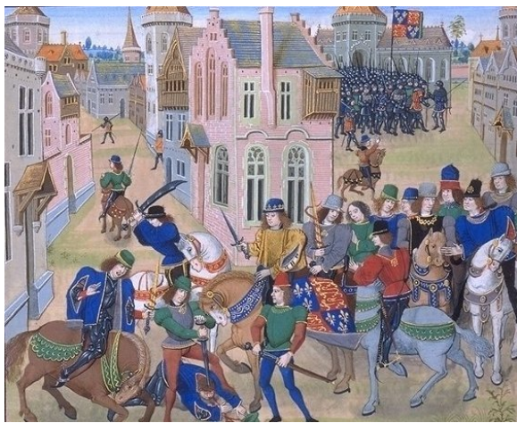
Figure 19 Richard II watches Wat Tyler's death and addresses the peasants in the background

John of Gaunt, his uncle, ruled on Richard's behalf for the first years of his reign and it was the Peasants' Revolt of 1381 that brought Richard into the limelight. It fell to him personally to negotiate with Wat Tyler and the other rebel leaders and their massed armed ranks of several thousand. As Richard was only 14 at the time, this must have taken some personal courage. He offered a pardon to the leaders of the rebellion, but he went back on his word and the ringleaders were eventually arrested and executed. It remains a matter of doubt as to whether Richard always intended this to happen, or whether he was forced to go against his word by some of the English nobility. Either way, his tactics had the desired effect of dispersing the rebel forces from the streets of London back to the shires and bringing the disorder to an end. The young king seemed to be showing great promise. As he matured into adulthood, however, he was unwilling or unable to deal and compromise, which was an essential aspect of 14th century politics. This led to his downfall.