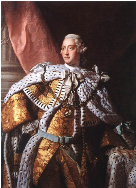
Figure 41 George III