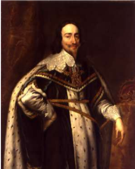
Figure 33 Charles I

Charles I was born at Dunfermline Palace on 19 November 1600. He was the second son of James I and Anne of Denmark. He was King of England, Scotland and Ireland from 27 March 1625 until his execution in 1649. He famously engaged in a struggle for power with the Parliament of England. He was a supporter of the Divine Right of Kings, and many in England feared that he was attempting to gain absolute power. There was widespread opposition to many of his actions, especially the levying of taxes without Parliament's consent. Religious conflicts continued throughout Charles's reign. He selected his Catholic wife, Henrietta Maria, over the objections of Parliament and public opinion.