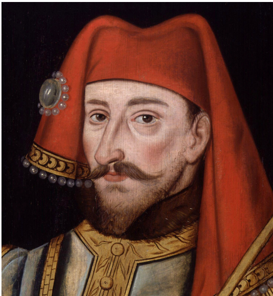
Figure 20 Henry IV

Henry IV was born on 3 April 1367 at Bolingbroke Castle in Lincolnshire, which was why he was also known as Henry Bolingbroke. His father was the third son of King Edward III of England, John of Gaunt. After landing in Yorkshire in 1398, Henry had enough support to be declared king by parliament in 1399. As king, Henry consulted with parliament often, but he sometimes disagreed with them, particularly over church matters. Henry was the first English king to allow the burning of heretics.