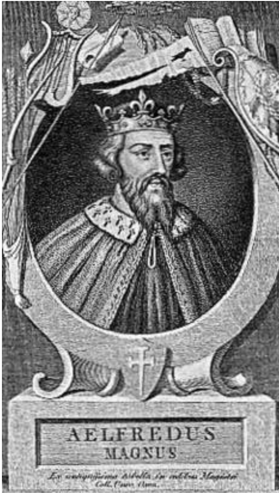
Figure 1 King Alfred the Great

Alfred the Great was born around 850 in Wantage, in what is now Oxfordshire. Alfred was the fourth son of King Ethelwulf of Wessex. He became king of the southern Anglo-Saxon kingdom of Wessex in 871, when his brother Ethelred I died.