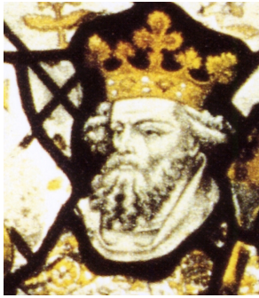
Figure 6 King Edgar

King Edgar was born around the year 942 in Wessex. He was the younger son of King Edmund I. Because of his peaceful reign Edgar is known as "the Peaceable". He was a stronger king than his elder brother, Edwy, from whom he took the kingdoms of Northumbria and Mercia in 958. Edgar was named as King of England north of the Thames by a group of Mercian nobles in 958, but officially succeeded when Edwy died in October 959. Edgar was crowned at Bath, but not at the start of his reign. His coronation was in 973, and was planned as the culmination of his reign. The symbolic coronation was an important step, and six other kings of Britain, including the kings of Scotland and of Strathclyde, came and gave their allegiance to Edgar shortly afterwards at Chester. Edgar married twice, first to Ethelfled, and later to Elfrida. He had several children. When he died on 8 July 975 at Winchester he left two sons, both of whom became kings of England. His eldest son, Edward, by his first wife, succeeded him on his death, and a second son, called Ethelred, by his second wife, succeeded his half brother. Edgar was buried at Glastonbury Abbey. There is some belief that Edgar married his mistress, Wulfryth, in between his other two wives, and that she produced a daughter, Eadgyth, who became the Abbess at Wilton.