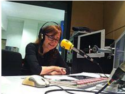
Journalist during an interview at Ràdio Barcelona (Cadena Ser)