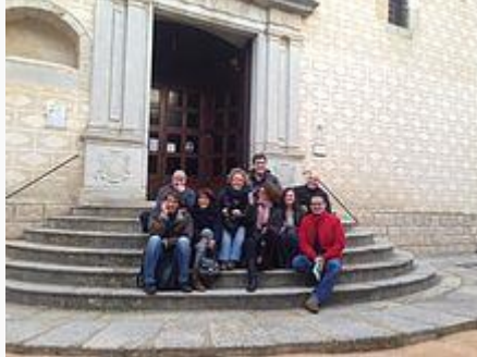
Caldes de Malavella editathon - group photo