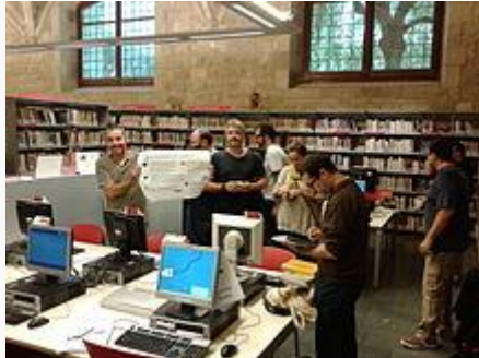
Archaeology Edit-a-thon at St.Pau i Santa Creu Library (Barcelona)