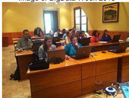
Wikipedia Workshop for Baix Empordà county professionals