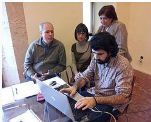
Meeting with AVL.