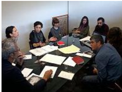
Meeting between School of Art and Design of Tarragona, the National Museum of Archeology of Tarragona and Amical Wikimedia ( Dvdgmz & Lluís tgn ).