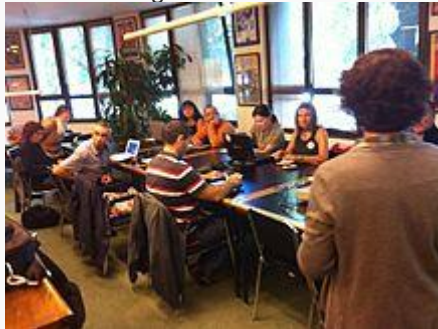
Workshop at Biblioteca Pública del Govern d'Andorra