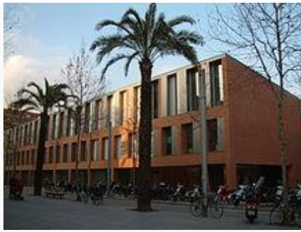
UOC: First EU university with a Wikipedian in Residence