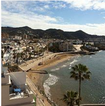
Report in Catalan about Sitges Museums presence on Wikipedia