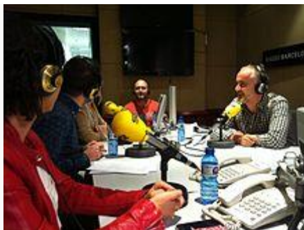
Interviews at Espècies protegides , Cadena SER