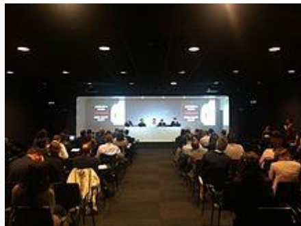
Image of BigData Week 2013