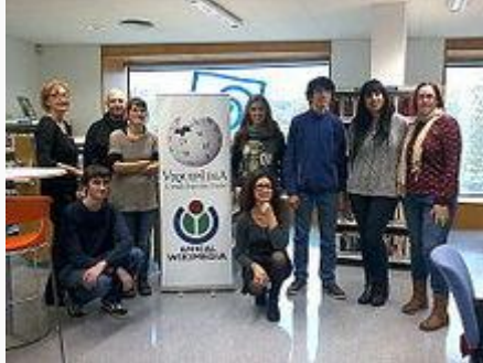
Group photo after Cambrils's editathon