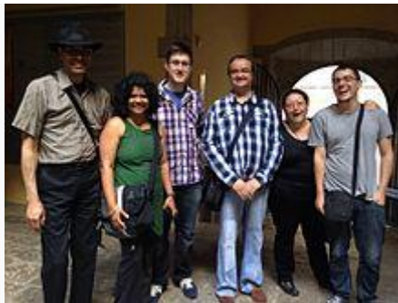
Amical and Wikimedia Foundation in Barcelona