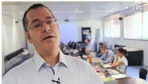
UOC responsables of Catalan Studies edit-a-thon