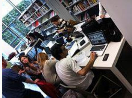
Edit-a-thon and Backstage Pass at Museu del Disseny de Barcelona- April 2014