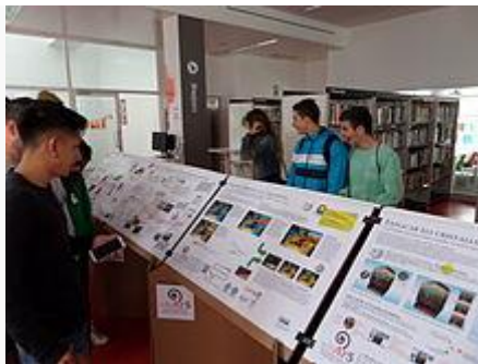
wikiArS exhibition at Rubí Library

The use of Internet open content for university education: an empirical study on the perceptions, attitudes and practices of university faculty on Wikipedia. This research project aims to analyze the use of Internet open contents for university teaching and explore and propose new ways of using these resources in learning processes, based on recent international experiences. Specifically, the project examines the educational uses of one of the most important open repositories of knowledge nowadays, Wikipedia, and explores the attitudes and perceptions of university teachers on this virtual collaborative encyclopedia, and, in general, on open resources. ( project page )