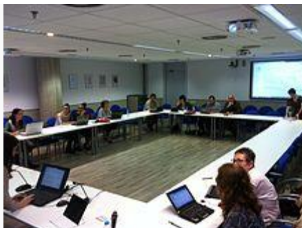
Viquiclàssics presentation at University of Barcelona, focus on filology teachers.