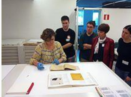
Wikipedians looking at Miró's original sketches during Joan Miró Global Challenge