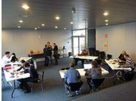
Fages de Climent Edit-a-thon