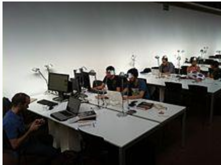
Joan Brossa editathon