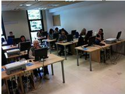
We did a 2 days workshop for cultural sector professionals in Andorra