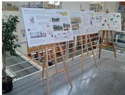
wikiArS exhibition at Pompeu Fabra Library in Mataró