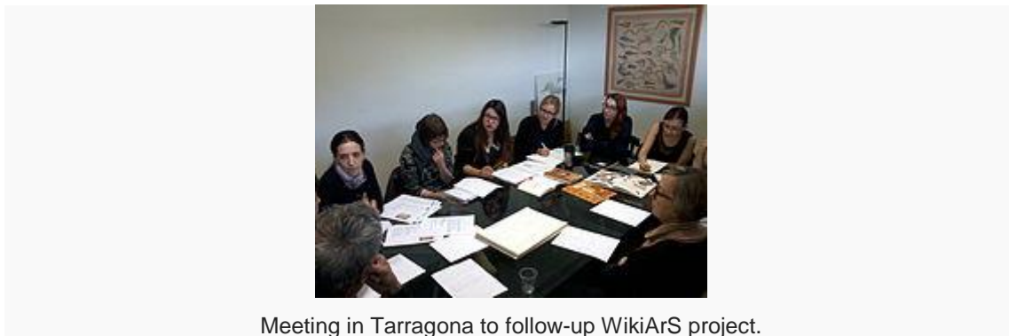
Meeting in Tarragona to follow-up WikiArS project.