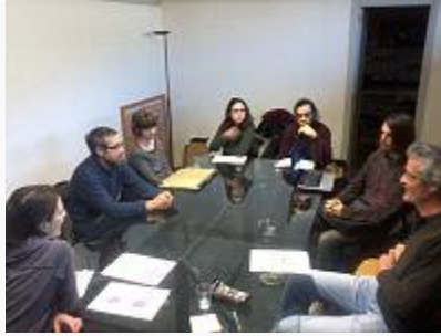
Meeting between School of Art and Design of Tarragona, the National Museum of Archeology of Tarragona and Amical Wikimedia (Lluís_tgn)