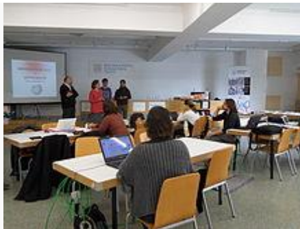
Editathon in Mataró