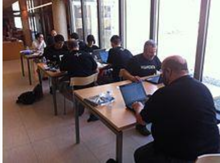
History edit-a-thon with special "Wikipedian" T-shirts ;)