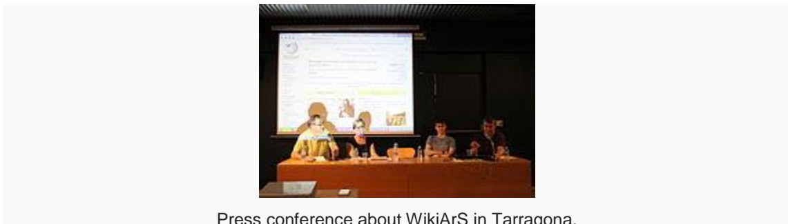
Press conference about WikiArS in Tarragona.