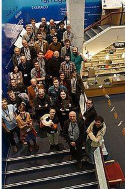
Amical Annual Meeting in Tarragona (2nd day)