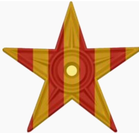
Catalan Culture barnstar