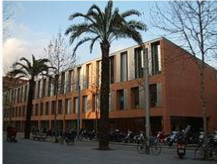
UOC: First EU university with a Wikipedian in Residence