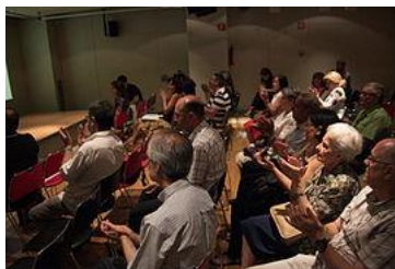
People attending the event