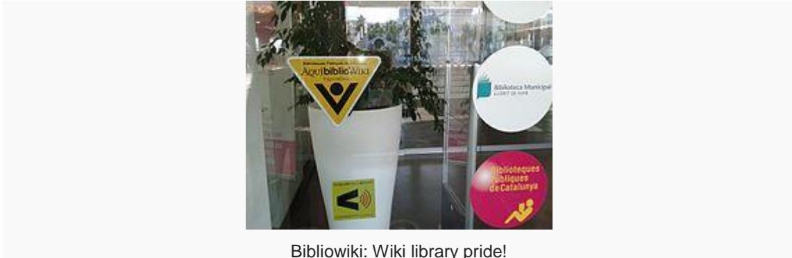
Bibliowiki: Wiki library pride!