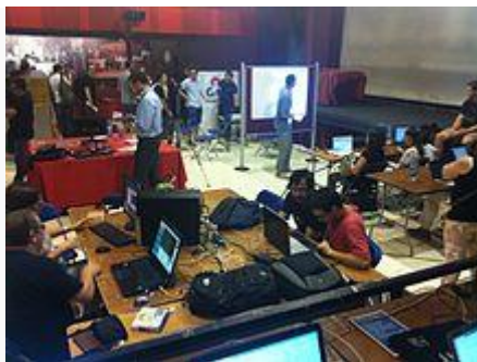
Editathon at La Palma de Cervelló 2014