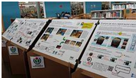
wikiArS exhibition at Badalona central Library Can Casacuberta