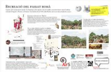
Poster about "Roman age recreations" for wikiArS exhibition

Universitat Oberta de Catalunya is the first university in Europe with a Wikipedian in Residence and Second in the World