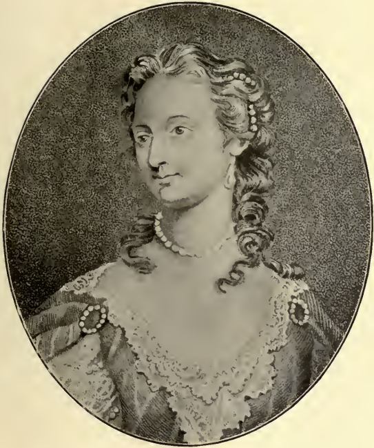
LADY MARY WORTLEY MONTAGU.