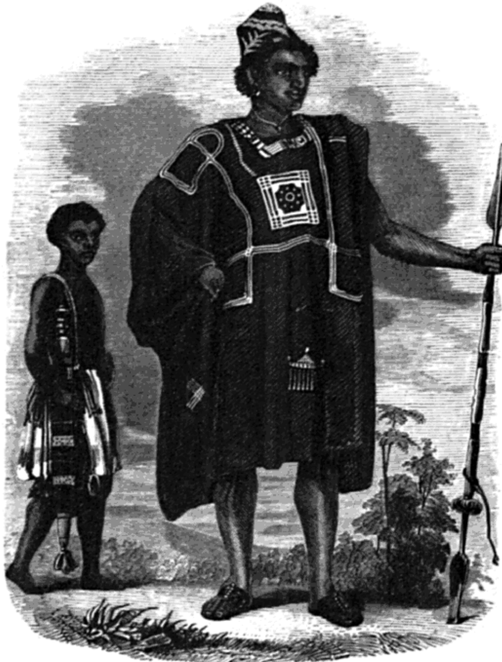
MANDINGO CHIEF AND HIS SWORD BEARER.

ENTERED, according to Act of Congress, in the year 1854, by