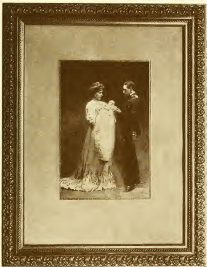
THE KING AND QUEEN OF SPAIN AND BABY