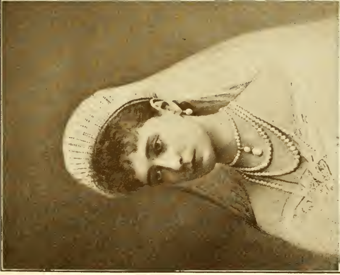
THE EMPRESS OF RUSSIA AND THE GRAND DUCHESS MARIE