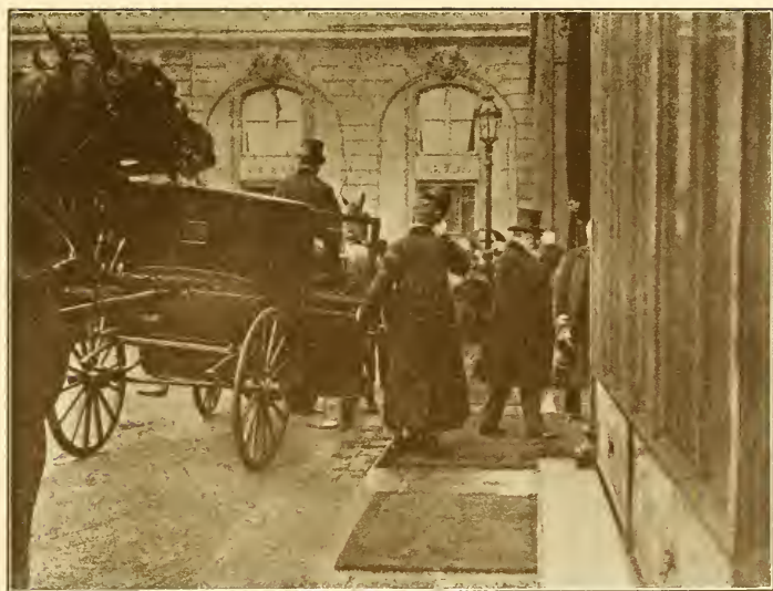
KING EDWARD ARRIVING AT THE ÉLYSÉE PALACE