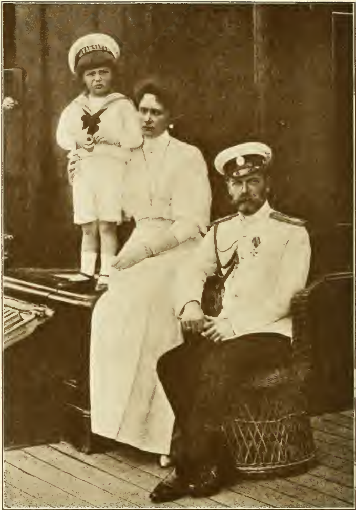
THE EMPEROR AND EMPRESS OF RUSSIA AND THE GRAND DUKE ALEXIS