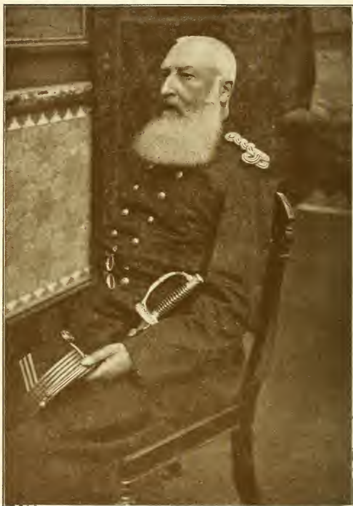
KING LEOPOLD II.