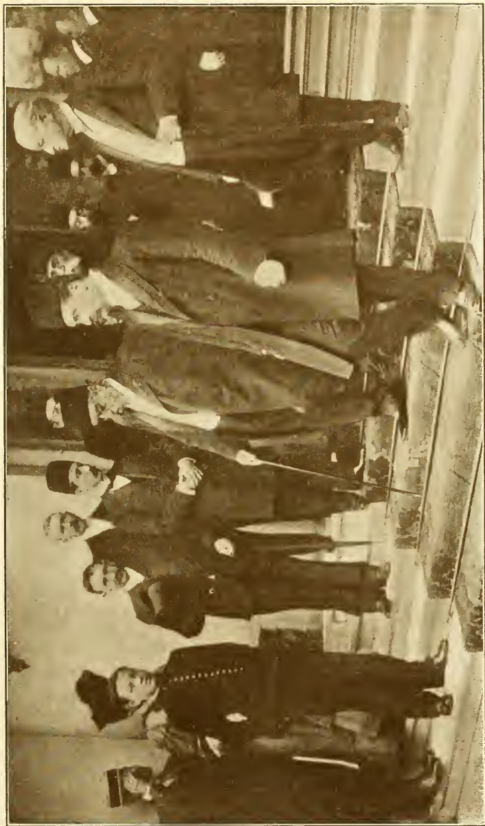
THE SHAH LEAVING THE ÉLYSÉE PALACE FOR A WALK