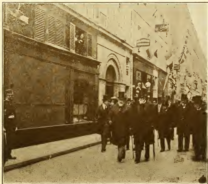
KING EDWARD ON THE WAY TO CHURCH