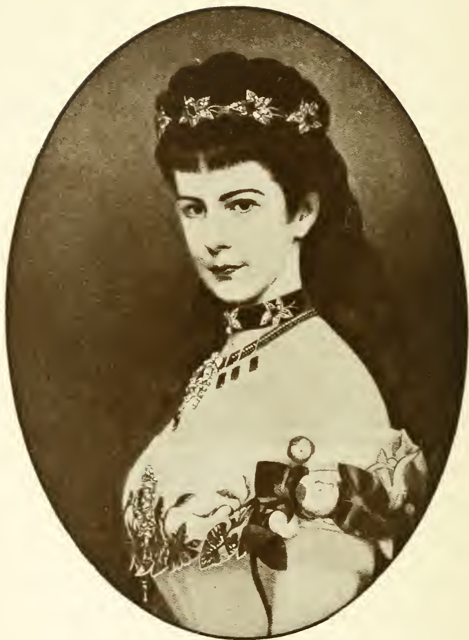
THE EMPRESS OF AUSTRIA