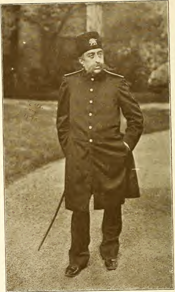
THE SHAH OF PERSIA