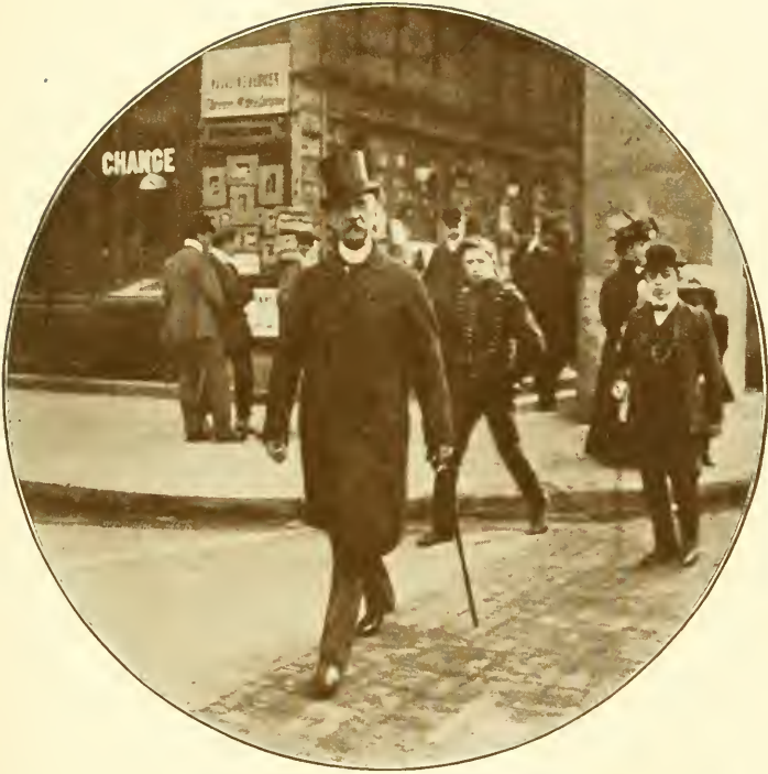
KING GEORGE OF GREECE IN THE STREETS OF PARIS