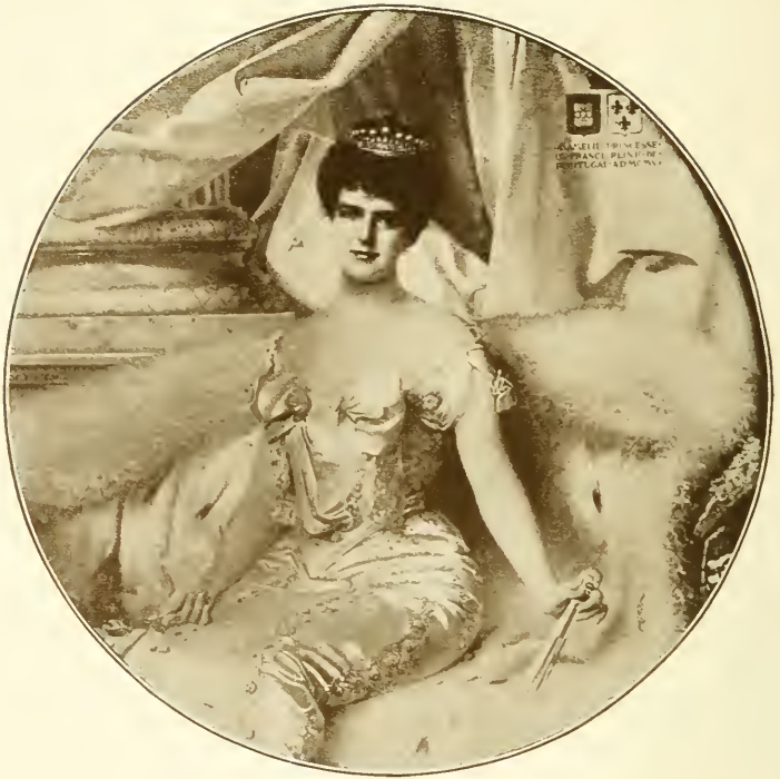
QUEEN AMELIE OF PORTUGAL