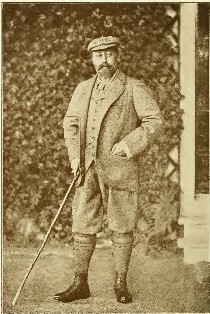
KING EDWARD VII