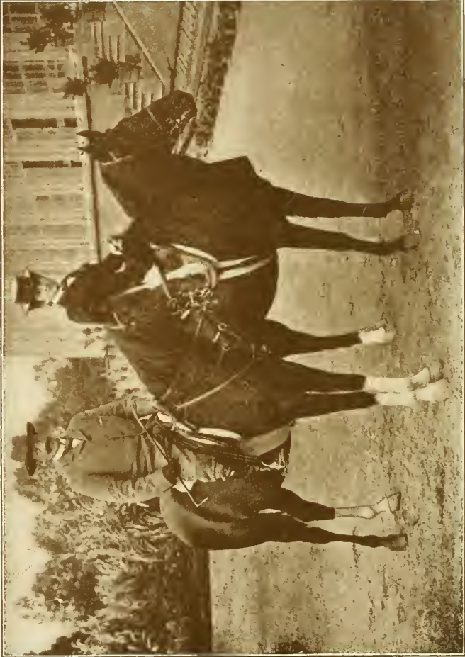
THE KING AND QUEEN OF ITALY