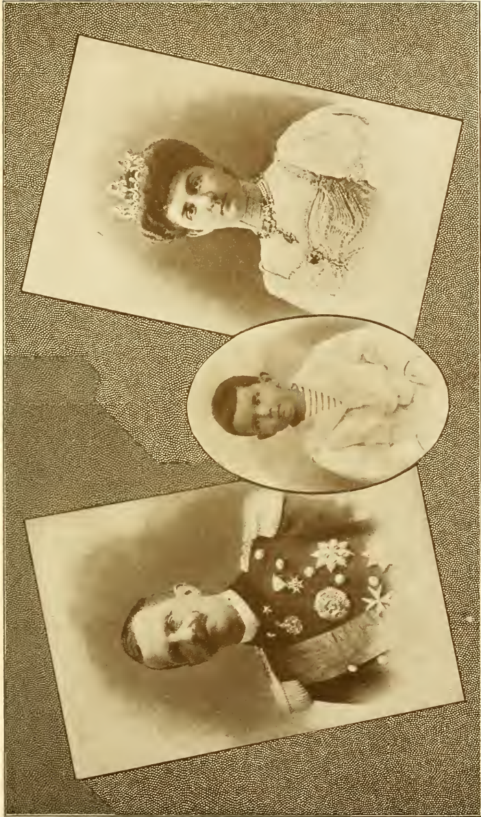
THE KING AND QUEEN OF ITALY AND THE CROWN PRINCE