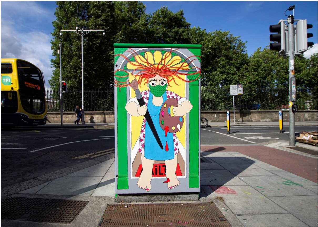
'BARRION NA FEINNE' by Gallanteers - Volunteers at the National Gallery of Ireland. Nassau Street, Dublin 2. (2021)