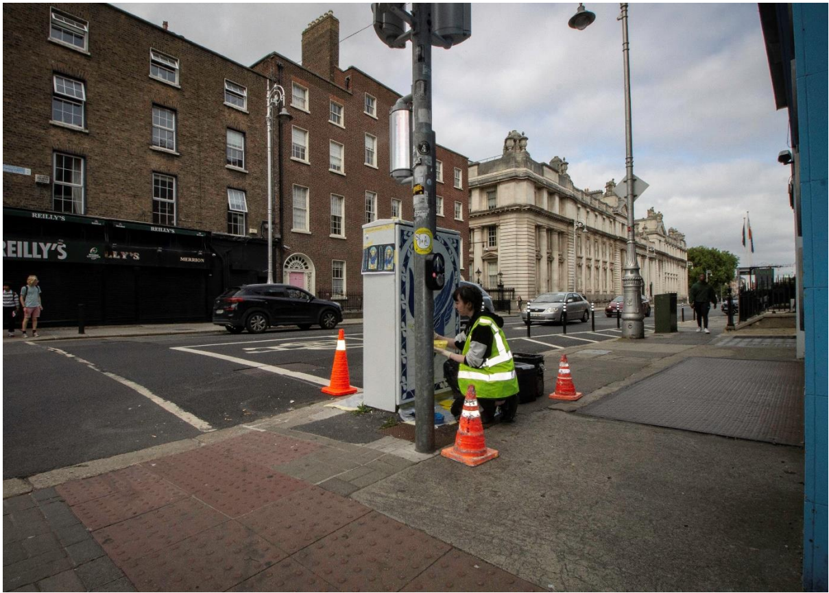
'Freedom' by Juliette O'Brien. Merrion Road, Dublin 2. (2021)