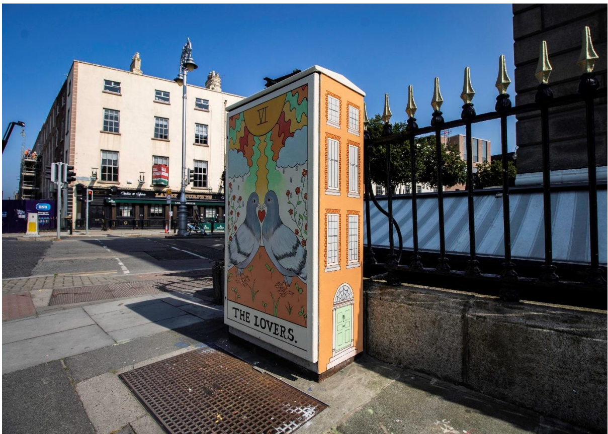
'Pigeons in Love' by Tara Lynch. Fitzwilliam Street, Dublin 2. (2021)