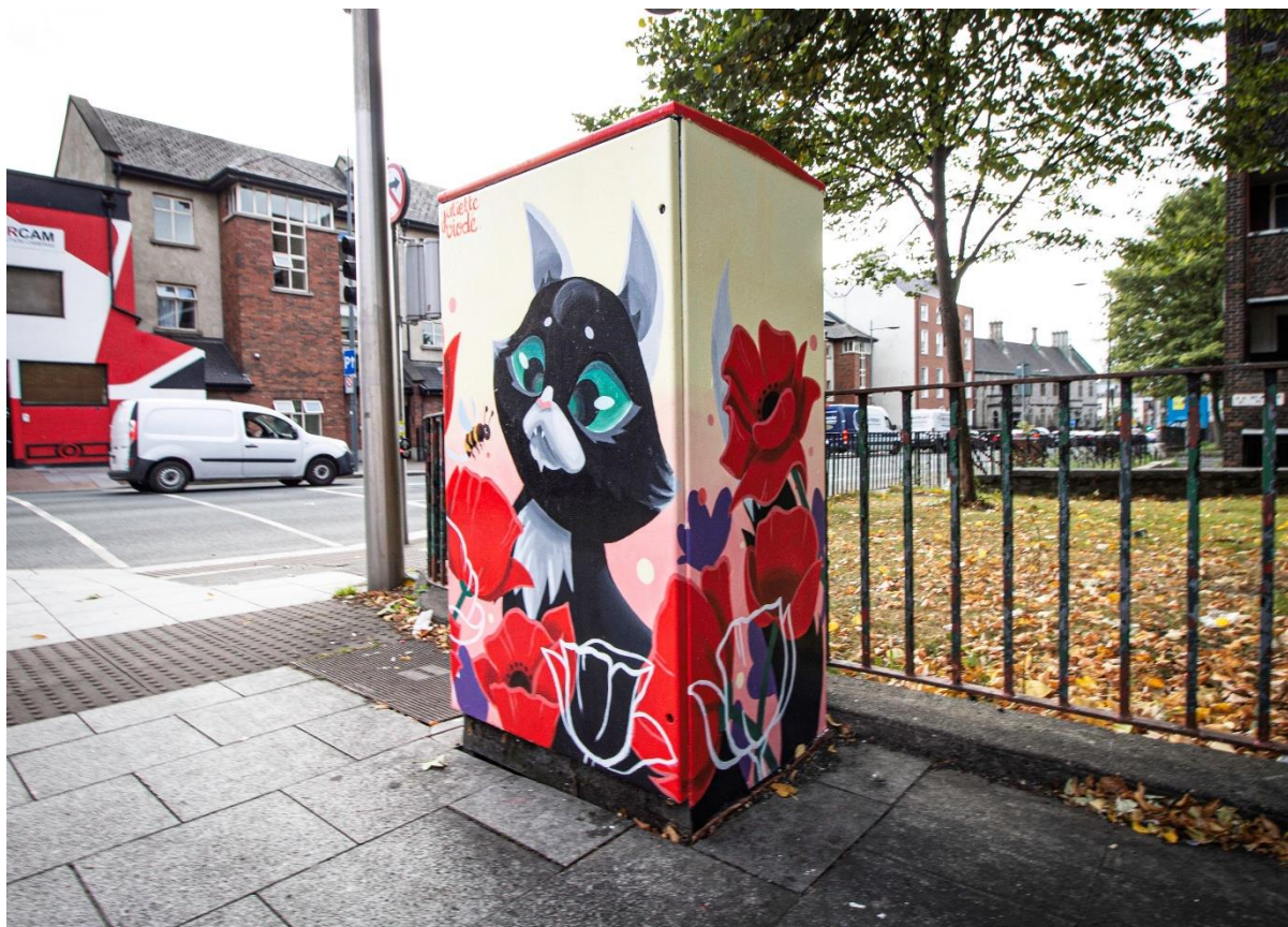
'Country Cat' by Juliette Viodé. Dorset Street Upper/Granby Road, Dublin 1. (2021)

Dublin Canvas is an idea, a public art project intended to bring flashes of colour and creativity to everyday objects within County Dublin. Less grey, more play! The project takes previously unused public space and transforms it into canvases to help brighten up each area. Making Dublin a more beautiful place to live, work and visit.