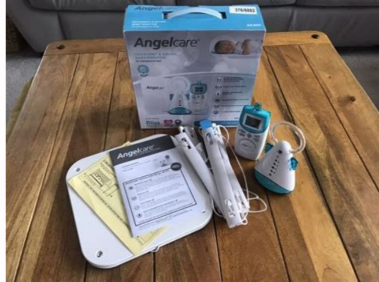
Angelcare baby monitor.

An Angelcare nanny is not your typical nanny. Instead of monitoring your baby's sounds remotely, the Angelcare monitor allows you to monitor your baby's actual breathing movements. When the monitor stops detecting movement, possibly because the baby is not breathing, an alarm sounds. Although the Angelcare monitor requires a little more work to set up and use than a traditional baby monitor, the process doesn't take much time. Prepare the sensor support. The sensor must rest on a completely flat and solid surface. If the base of the crib does not have this type of surface, place a thick sheet of plywood between the base of the crib and the mattress, covering the entire size. This will ensure that the sensor pad maintains sufficient contact with the mattress and baby's movements. Install the sensor pads under the mattress. With the printed side up, place the sensor under the mattress in the center of the crib. There should be no bedding between the mattress and the sensor pad. Fasten the sensor with a zipper. The sensor cable should go under the mattress and along the floor out of reach of the child.