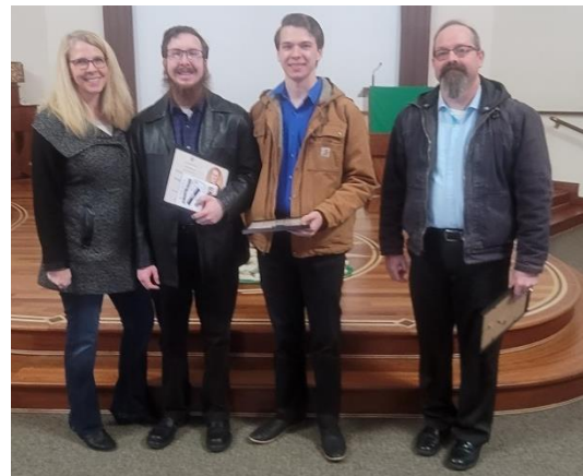
Proud Knight mother and wife with a Knight family