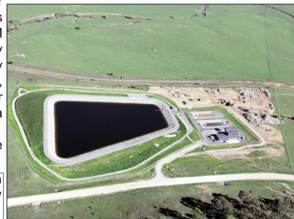
Right: The $10.8 million Gunning-Dalton Water Supply Scheme.

The project is expected to be completed by late 2017.