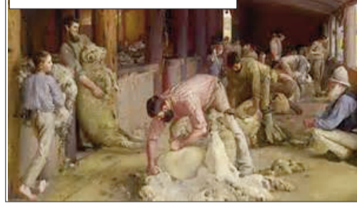
Shearing the Rams, 1890

The National Gallery of Australia will be holding information sessions at Crookwell and Gunning Libraries on the upcoming Tom Roberts exhibition to be held at the National Gallery of Australia in Canberra.