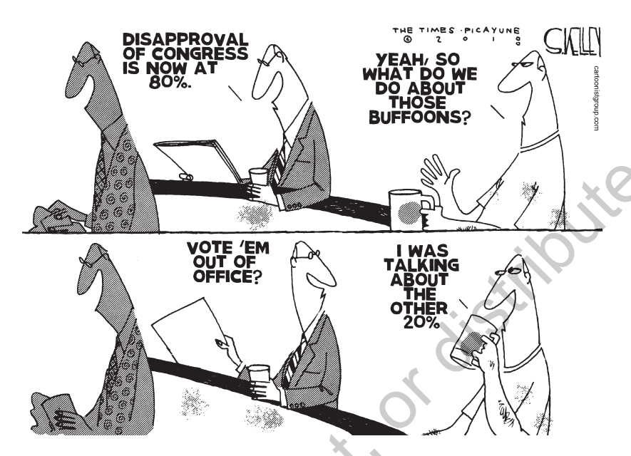
Steve Kelley Editorial Cartoon used with the permission of Steve Kelley and Creators Syndicate. All rights reserved.

Tracking polls were prominent in the 2000 presidential campaign but less so in 2004 (Traugott 2005) and 2008 when more resources were devoted to polling in key battleground states and more media attention was given to those battleground state results. Undoubtedly, the key role played by Florida in 2000 and Ohio in 2004 sensitized the media that a presidential contest is not simply a national popular-vote contest to be measured by national tracking polls but is also an Electoral College competition where the key battleground states will determine the outcome in a close contest. In 2000, as Election Day approached, the results of various mediasponsored tracking polls converged to yield predictions very close to the actual election outcome. But throughout the campaign, one particular tracking poll—that conducted by the Gallup Organization for CNN and USA Today—showed dramatic fluctuations over very short time periods. For example, one set of results showed Gore ahead by eleven points, yet two days later, Bush was up by seven. Such substantial volatility surprised observers, who questioned the accuracy of the Gallup results. It turned out that one reason for the results was dramatic variation in the proportions of Democrats and Republicans in their samples over short periods of time (Morin and Deane 2000). When the sample had relatively more Democrats, Gore did better, and vice versa. Gallup argued that the short-term fluctuations