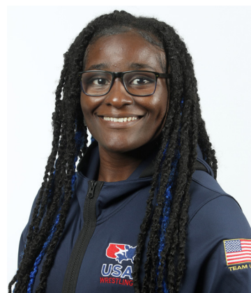
TAMYRA MENSAH STOCK