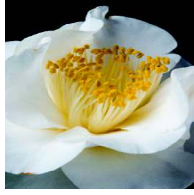
April Snow C. Japonica 'April Snow'

this compact shrub. With an erect structure and moderate growth, April Melody is a strong grower with an extended blooming season, beginning in early spring. Extremely cold hardy.