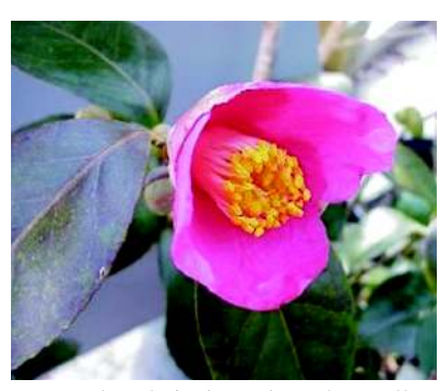
'April Melody' has relatively small, single red blooms in spring

Did this dreary, gray winter get you down? One way to cheer up your yard, and yourself, is to plant hardy Camellias. They bloom like crazy, and they bloom when most other flowering plants are snoozing away the winter. This plant, often called the 'rose of winter,' will win you over with its array of colors and bloom types, striking green leaves, and easy care. Hardy Camellias are long-lived, seldom need pruning, have low water requirements, and are shallow-rooted so they may be planted near foundations or other plants. They like acid soil that's well