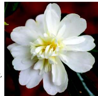
Prolific 'Snow Flurry' brings snow white, early fall blooms

Lashbrooke Nursery (specializing in Japanese Maples), and Sunlight Gardens.