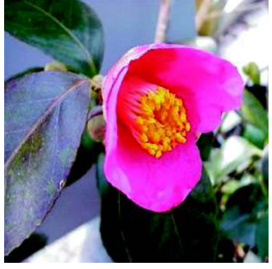
April Melody C. Japonica 'April Melody'

Its shell pink, profuse, semidouble blooms are striking against its deep green, relatively dense leaves. This compact bush has a slow to moderate growth rate and blooms early to mid spring. Extremely cold hardy.