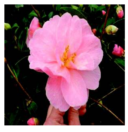
April Blush C. Japonica 'April Blush'

Members Only - Join or Renew at the Door April 16 5 - 7 pm Open to the Public April 17 9 - 3