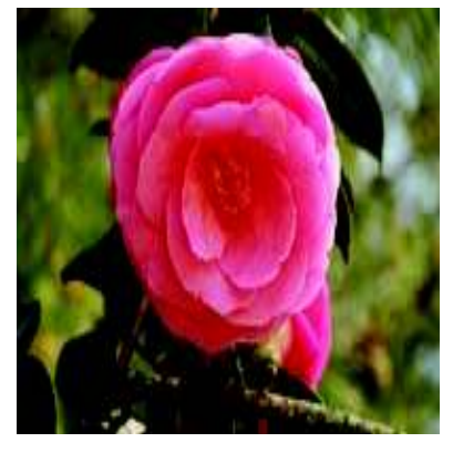
Jerry Hill C. Japonica 'Jerry Hill'

Rose red, single blooms cover Its rose-form, profuse double blooms are very fragrant and pure white, set off against its large, shiny, dark green leaves. The flowers open in early spring on this fairly slow-growing, compact (5-8' x 4') plant. Extremely cold hardy.