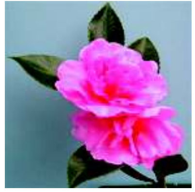
Frost Princess C. sasanqua 'Frost Princess'

This Ackerman cultivar with broad, glossy leaves and rose pink, formal double blooms grows at an average rate. It has an upright shape with dense growth and blooms relatively late in winter. Extremely cold hardy.