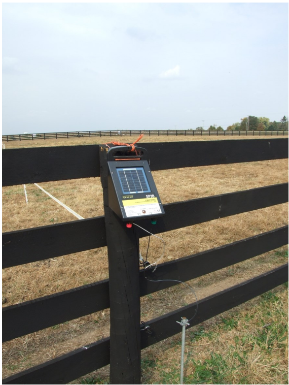
Many charger options are available: including those that need to be plugged into an electrical source, battery powered, or solar powered.

and easy to use as are the braided rope products. If you experience a lot of wind in your area, consider the rope rather than the tape products. How many strands of tape or ropes will depend on the horses in the pasture and horse owners' preference. One strand can be effective, but in some cases two strands are needed to keep horses where you want them.