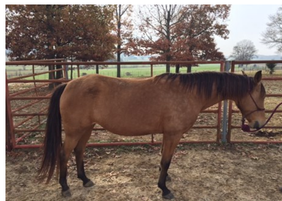
Body Condition Score 5

Horse owners and the public alike should be aware that basic training is a necessity to insuring a safe and enjoyable environment with horses. Horses should never be allowed to bite, kick, or endanger the safety of the handler. In order to establish a healthy respect from the horse, basic training (providing a stimulus, understanding the response from the horse, and reinforcing the behavior) must be understood and implemented. At times, basic training may require the use of training aids but these aids must be used as tools and not weapons. Those not involved with horses should understand that basic equipment such as halters, lead ropes, and saddles do not generally cause harm to the animal. Many people may think that a horse standing tied to a trailer or arena fence may be “cruel” treatment, when in reality it is a simple necessity to managing horses and causes no harm. The vast majority of livestock owners care and provide for their animals with meticulous attention to detail, requiring the owner to feed, groom, clean stalls, exercise, and manage animals on a daily basis.