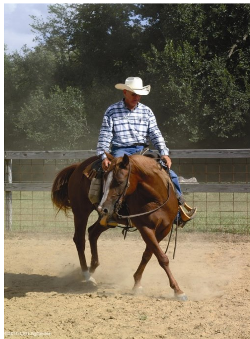
Appropriate training methods and proper use of equipment are important aspects of horse ownership.