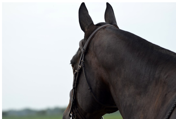
Information gathered in this study will provide an estimate of the overall impact the equine industry has in Alabama.

The updated Alabama Equine Impact Study will include Alabama's equine inventory and describe equine services, events, and other enterprises associated with the industry. Input/output modeling will be used with IMPLAN to estimate the economic impacts of the equine industry on the Alabama economy. In addition, thousands of visitors at Alabama equine events are being surveyed to help gauge specific equine interests and economic impact. The project will create budgets for different types of horse ownership from "backyard" horses to high-end show animals. This information will then be used to provide an estimate of the total economic impact of horses in the state, both direct and indirect.