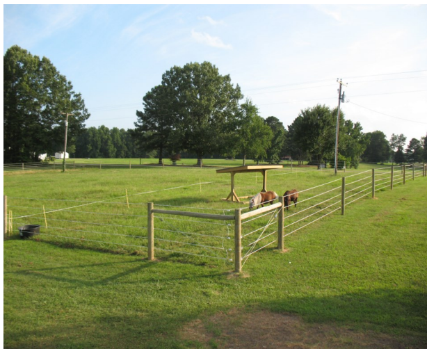
Pasture is an excellent source of nutrients.

Pasture is a variable source of minerals. In some cases, pasture can contain adequate amounts of minerals relative to requirements; whereas in others pastures it tends to be deficient. The concentrations of calcium and phosphorous reported for 9,432 pasture samples ranged from 0.27% to 0.82 % and 0% to 0.78%, respectively (Dairy One, 2013). The range of calcium and phosphorous requirements for horses is 0.2% (mature idle) to 0.8% (5-month old weanling), and 0.14% to 0.45%, respectively (NRC, 2007).