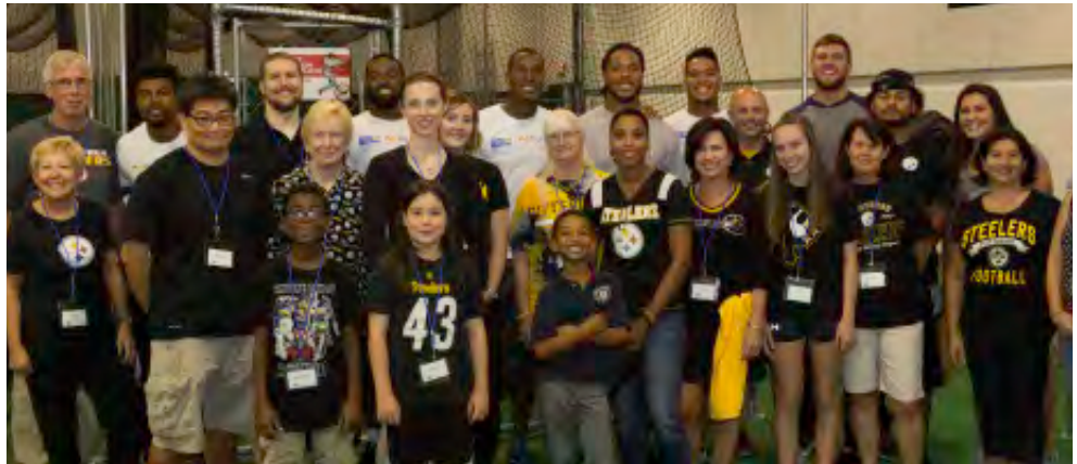
TOCQUEVILLE SOCIETY FIELD DAY WITH THE STEELERS, October 10, at the Boys & Girls Club, Shadyside