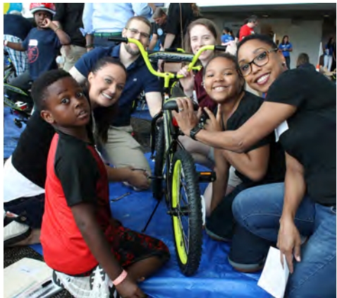
UNITED WAY'S BUILD A BIKE, June 21, at Heinz Field