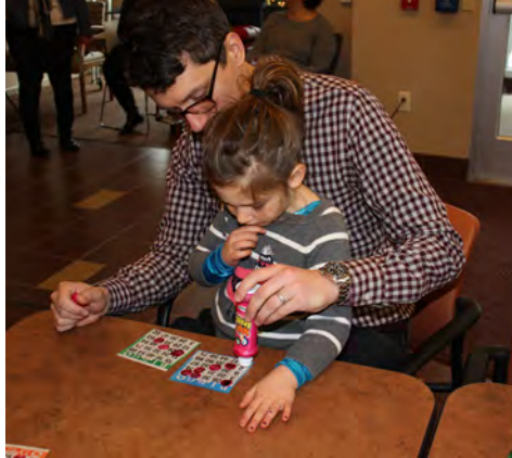
TOCQUEVILLE SOCIETY HOLIDAY SENIOR FUN DAY, December 2, at the Frank Mazza Pavilion