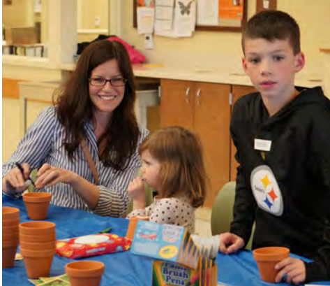
TOCQUEVILLE SOCIETY VOLUNTEER DAY, April 25, at the Women's Center & Shelter