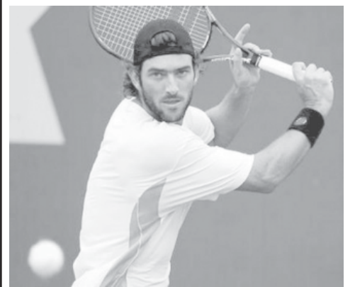
Brazil's Franco Ferreiro returns a shot to Spain's Ruben Ramirez Hidalgo during their match at the Copa Petrobras tennis tournament in Asuncion on 10 Nov, 2007.

Earlier on Saturday, Tulio scored two penalties to help Le Mans come from behind to beat St. Etienne 3-2 despite playing with 10 men for more than an hour.