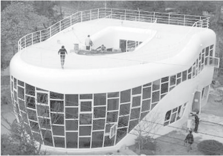
A lavatory-shaped house, Haewoojae, which means the house for satisfying one's anxiety, is seen in Suwon, about 46 km (29 miles) south of Seoul, on 9 Nov, 2007. South Korean sanitation activists will mark the start of a global toilet association on 21 Nov by lifting the lid on the world's first lavatory-shaped home that offers plenty of water closet space.