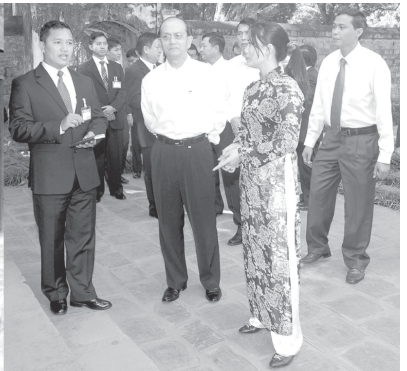
Prime Minister General Thein Sein views stone inscriptions at the ancient university in Hanoi.