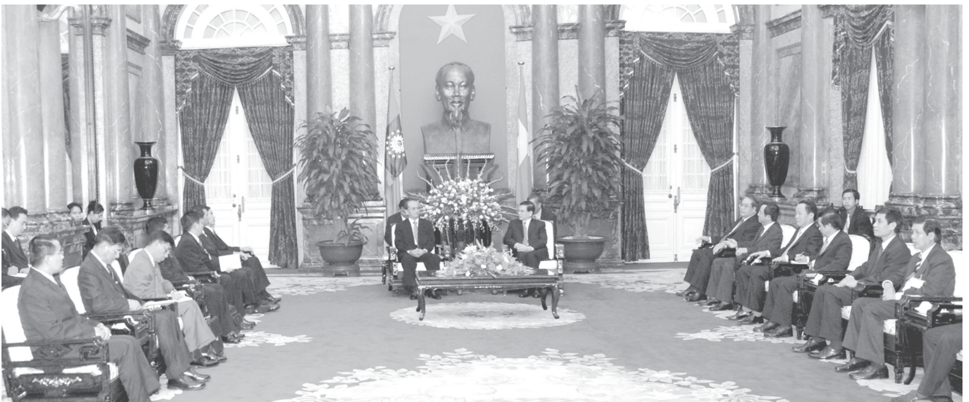
Prime Minister General Thein Sein calls on President Mr Nguyen Minh Triet at the Presidential Palace in Hanoi.

NAY PYI TAW, 11 Nov—Prime Minister of the Union of Myanmar General Thein Sein on 9 November called on President of the Socialist Republic of Vietnam Mr Nguyen Minh Triet at the Presidential Palace in