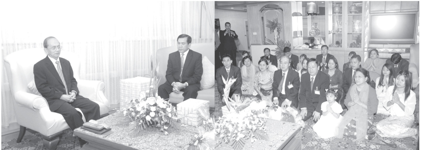
Prime Minister General Thein Sein gives instructions to staff and family members of Myanmar Embassy and Military Attaché's Office in Vietnam.—MNA

At the meeting, Prime Minister General Thein Sein stressed the need for the staff members to strictly follow the law, rules and regulations of countries in which they