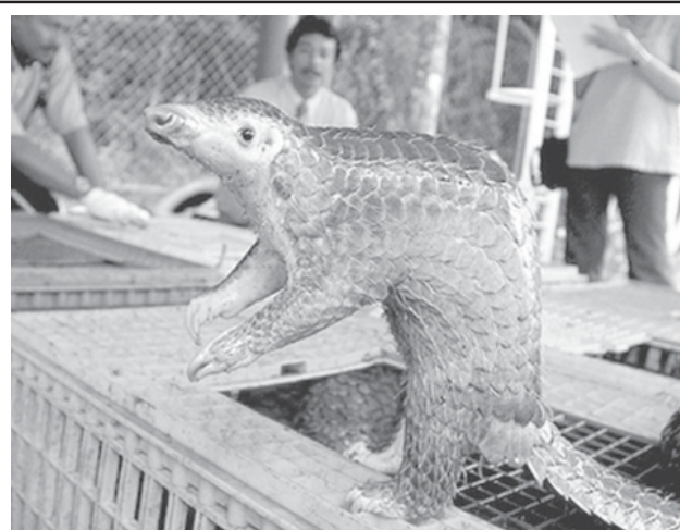
A Malayan pangolin is seen out of its cage after being confiscated by the Department of Wildlife and Natural Parks in Kuala Lumpur in 2002. Thai Customs officers said on Saturday they have rescued more than 100 pangolins and arrested three men attempting to smuggle the endangered animals to China, where they were destined for the cooking pot. — INTERNET

Zhang Zhihe, head of China Giant Panda Breeding Technology Commission, told Xinhua , "Considering the difficult breeding process of giant pandas, a survival rate of 80 per cent or so is quite high". According to Zhang, over the 40-year history of artificial breeding, the survival rate of newborn panda cubs averages less than 60 per cent. — MNA/Xinhua