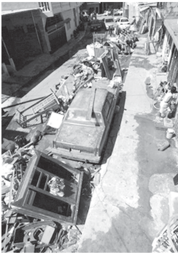
A car sits among debris after floods in Villahermosa, eastern Mexico, on 9 Nov, 2007. Floods have destroyed crops in the Gulf coast state of Tabasco, Mexico's largest producer of cacao and a major grower of bananas, but the losses were not expected to affect international prices, agriculture experts said.—INTERNET

Jansa said the sustainable development of Chinese economy would offer more opportunities for the two countries to cement cooperation.—MNA/Xinhua