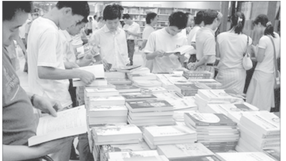
In this file photo, people read from a display of books, in Shenzhen, Southern China. Chinese author Jiang Rong used his personal experience of living in the Chinese-Mongolian border region during the Cultural Revolution to write his prize-winning novel "Wolf Totem." Jiang scooped the inaugural Man Asian Literary Prize on 10 Nov, 2007.

It added: "It would have been preferable not to have given viewers the impression that all the children in the item had contacted the programme through the website."