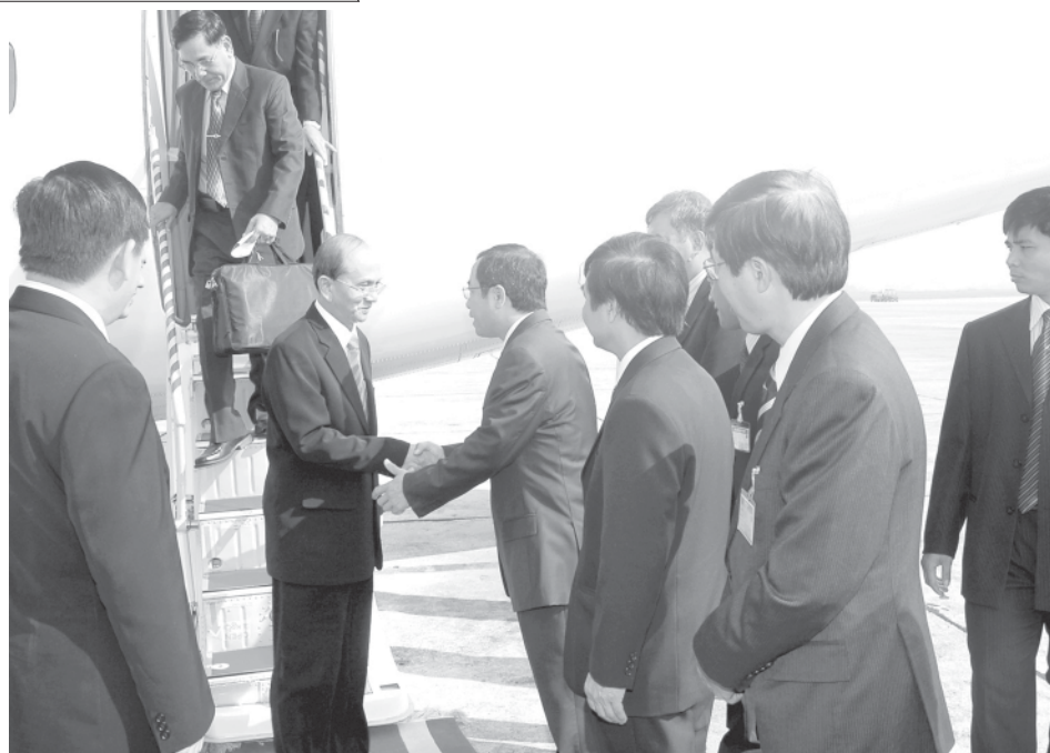
Prime Minister General Thein Sein being welcomed at Noi Bai International Airport by Vietnamese Deputy Minister of Foreign Affairs Mr Dao Viet Trung and party. — MNA

and frankly discussed promotion of agricultural production and cooperation. — MNA