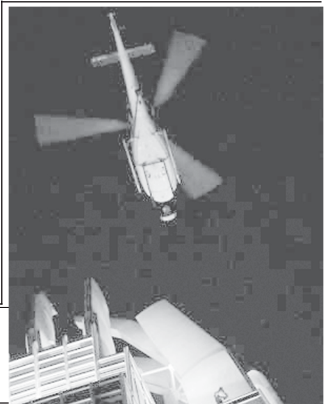
The shooting on the top of Hong Kong's tallest building later Friday must be quite a good experience, "Batman" Christian Bale said at a packed Press conference with over 100 local and overseas journalists Friday morning.