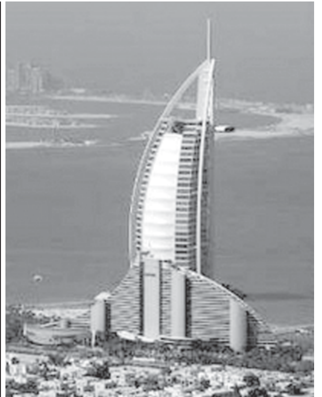
A view of the Burj Al Arab Hotel and Palm Island Jumeirah (background) in Dubai, on 9 Nov, 2007.