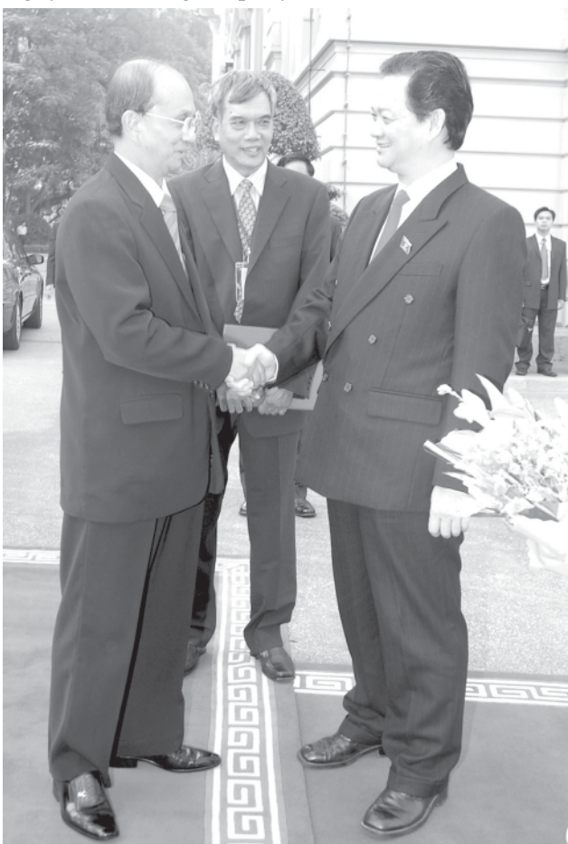
Prime Minister General Thein Sein shakes hands with Vietnamese Prime Minister Mr Nguyen Tan Dung at Presidential Palace in Hanoi.