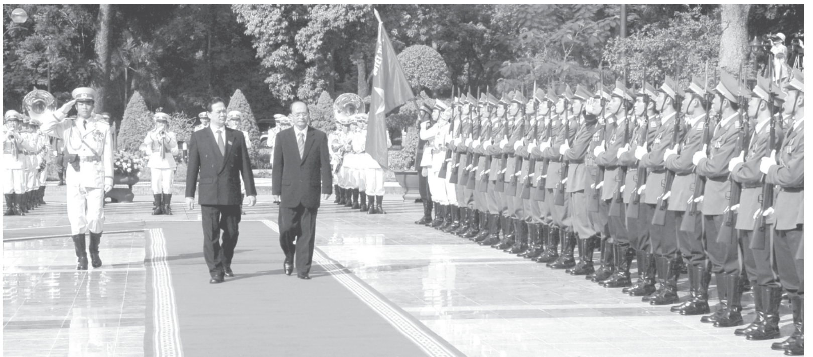
Prime Minister General Thein Sein and Vietnamese Prime Minister Mr Nguyen Tan Dung inspect the Guard of Honour.

At the welcoming ceremony, Prime Minister General Thein Sein and Vietnamese Prime Minister Mr Nguyen Tan