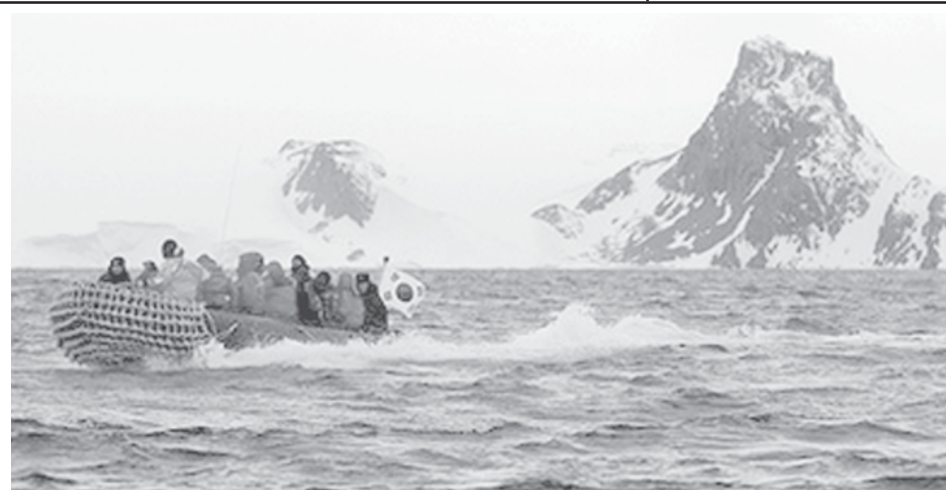
A boat transports United Nations Secretary General Ban Ki-Moon and delegates from South Korea during his visit to Antarctica. Ban flew to Antarctica on Friday on a fact-finding mission for climate change, becoming the first UN leader to make an official visit to the frozen continent. INTERNET

The airport is checking its electrical system, in an attempt to find the problem. — MNA/Xinhua