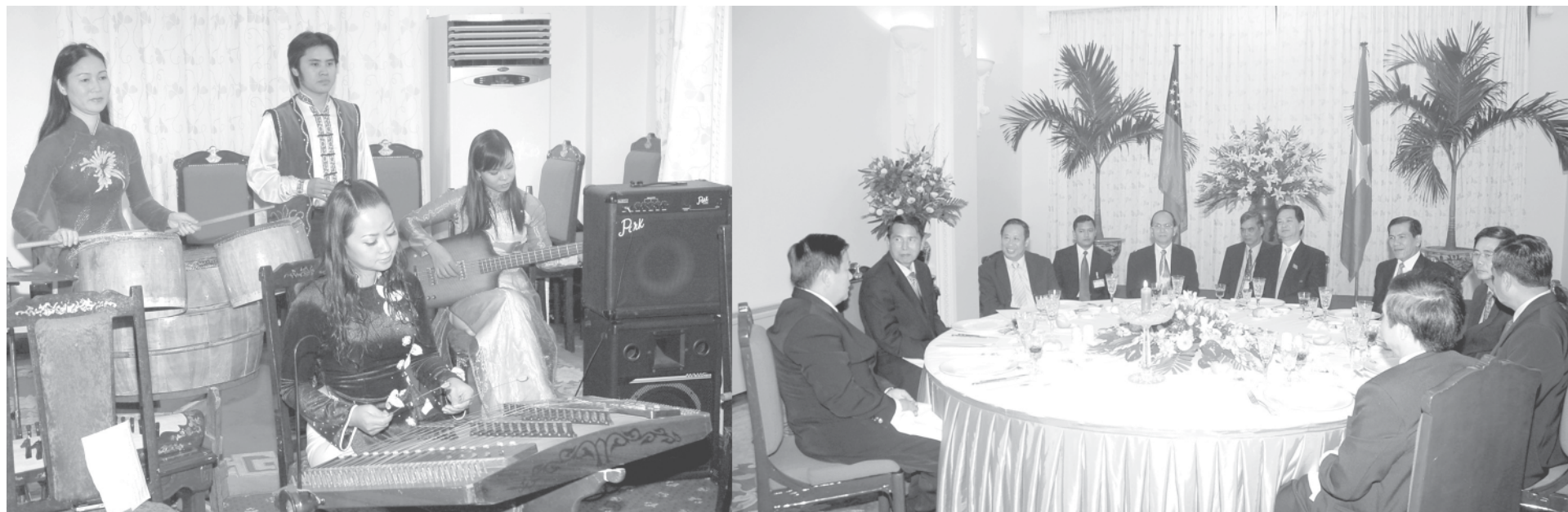
Prime Minister General Thein Sein and party being entertained with songs of cultural troupe at the dinner hosted by Vietnamese Prime Minister Mr Nguyen Tan Dung.