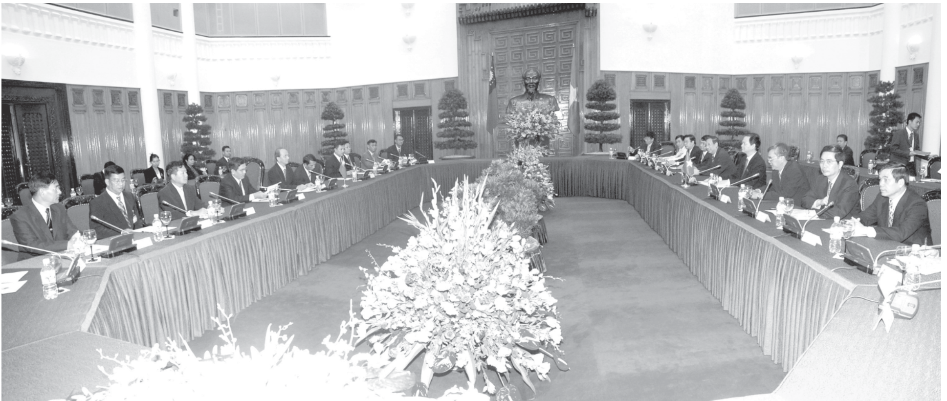
Prime Minister General Thein Sein and party hold discussions with Vietnamese Prime Minister Mr Nguyen Tan Dung and party.

NAY PYI TAW, 11 Nov — The visiting Myanmar delegation led by Prime Minister of the Union of Myanmar General Thein Sein, together with Prime Minister of the Socialist Republic of Vietnam Mr Nguyen Tan Dung and party arrived at the Government