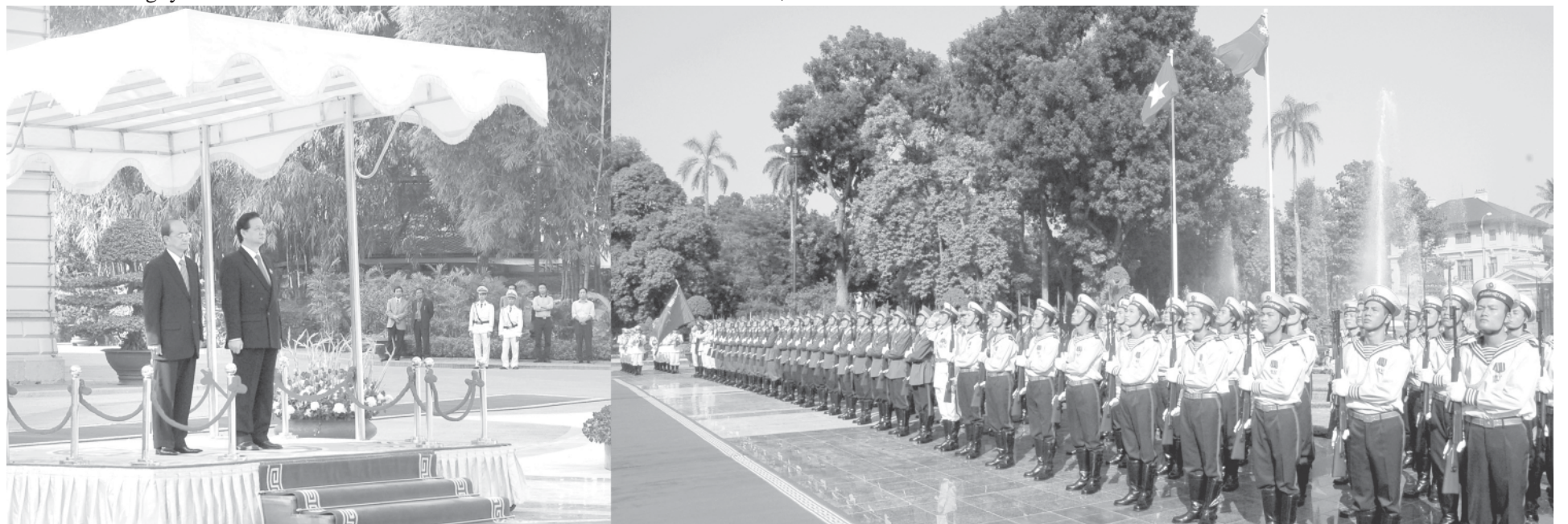
Prime Minister General Thein Sein and Vietnamese Prime Minister Mr Nguyen Tan Dung take the salute of the Guard of Honour.