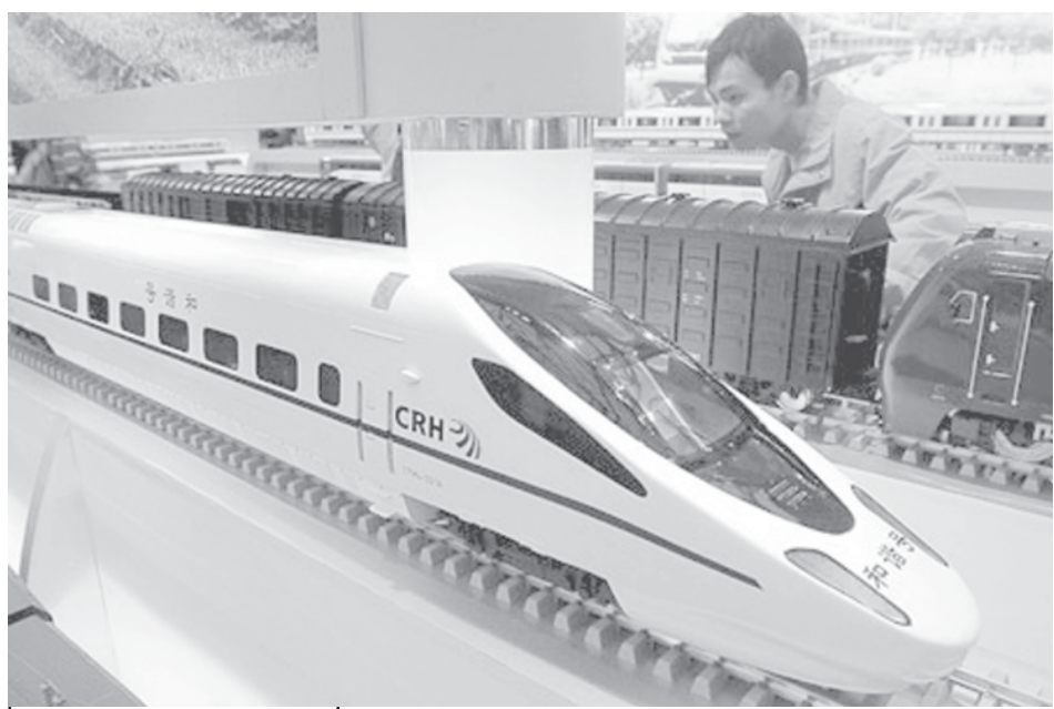
A visitor views the model of a CRH train at the 2007 China International Industry Fair in Shanghai, on 6 Nov, 2007. This event, initiated in 1999, is China's largest international industry expo.