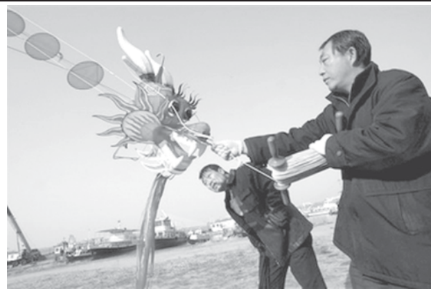
A Chinese man flies a dragon-headed kite on the bank of the Songhua River in Harbin, in China's northeast Heilongjiang Province on 10 Nov, 2007. Flying kites is a popular pastime in China, where they are believed to have originated almost 3,000 years ago.