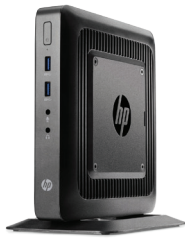
HP t520 Thin Client