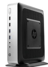
HP t730 Thin Client

For more information, visit hp.com/go/t730