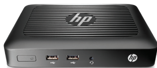
HP t420 Thin Client

The energy-efficient HP Thin Clients are versatile and rival the PC user experience with great speed and convenience. Your investment delivers added value—top application support, increased productivity, and essential software. IT managers get critical management tools, maximum security, and peace of mind. Stay future-ready with a long lifecycle and global support.