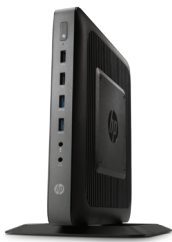
HP t620 Thin Client

For more information, visit hp.com/go/t520