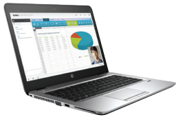
HP mt42 Mobile Thin Client