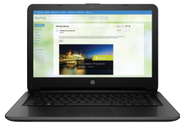
HP mt245 Mobile Thin Client

For more information, visit hp.com/go/mt42