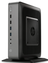
HP t620 PLUS Thin Client

For more information, visit hp.com/go/t620