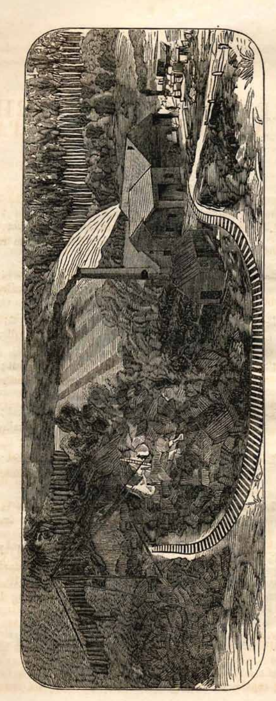
VIEW OF QUARRY NO. 2, AND WORKS OF THE ROXBURY VERD ANTIQUE MARBLE COMPANY, ROXBURY, VERMONT.