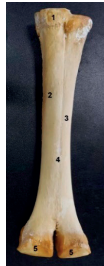
Figure 5. Metacarpal bone:

The main metacarpus (Mc.) is formed by fusion of Mc. III and IV. The proximal end of the main metacarpus has a slightly widened articular surface represented by three areas: an approximately triangular, planiform, lateral one, intended for the carpal bone, separated by a prominence from the areas for the 3 rd and 2 nd carpal bones; between the last two areas there is a second, much smaller eminence. In the central part, caudal to the main prominence, is a deep synovial fossa.