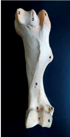
Figure 2. Left humerus - cranial view:

As concerns the humerus, the essential differential element is the reduction of the neck that supports the head, which leads to an increase of the angle between the axis that passes through the center of the articular head and the axis of the shaft. Dissimilar to cattle and horses, the brachial groove is not well defined; the epicondyle crest was absent.