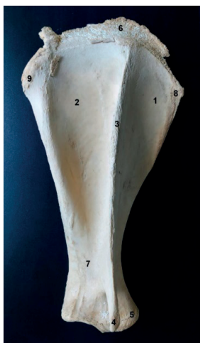
Figure 1. Right scapula - lateral view:

The lateral surface is crossed by an approximately rectilinear scapular spine, which increases progressively in height, starting from the dorsal edge, and reaching the maximum at the half of the bone.