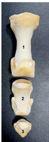
Figure 6. Phalanges of the anterior right limb: 1 – proximal; 2 – middle; 3 – distal

Phalanges of camels have a quite different appearance than those of bovines and horses. The most important difference from equines and cattle phalanges is the lack of the groove that crosses the proximal articular dorso-palmar surface, this being replaced by a shallow glenoid cavity that has contact only with the anterior, convex part of the distal articular surface of the metapodium bones (Figure 6).