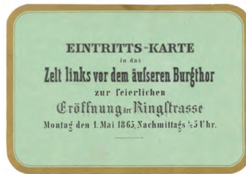
33. Invitation to the opening of the Ringstrasse. 1865. Printed card. (Wien Museum, Vienna).

It is My Will that the expansion of the inner city of Vienna be undertaken at the earliest possible moment, with due consideration to an appropriate link with the suburbs. In so doing, thought should be given to the regulation and beautification of My Residence and Imperial Capital. To this end, I approve the dismantling of the surrounding walls of the inner city as well as the dry moats around them. 2