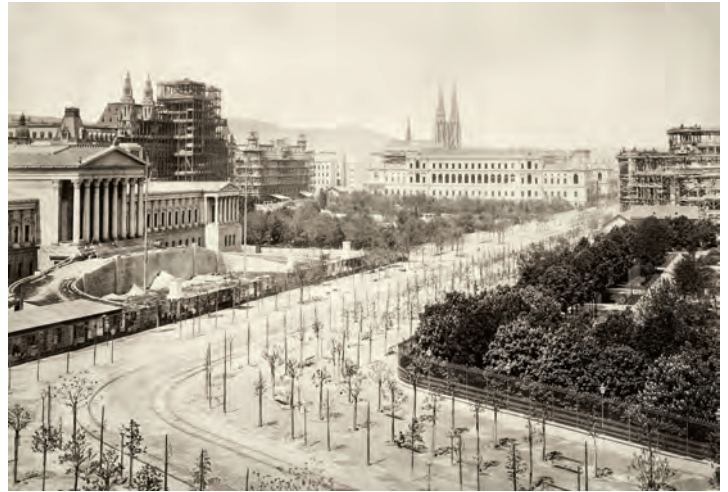
35. Parliament with Rathaus and Burgtheater under construction, c.1882.

More interface than area, the Ring (Fig. 35) nonetheless drew the Viennese into its course. Sigmund Freud walked it daily, counterclockwise, at a military clip, stopping at Café Landtmann for Tafelspitz and Gugelhupf. Interpreting his dreams while he marched, this unsung explorer of the human soul understood his path – in his hometown – around the vanished walls symbolically, as akin to Hannibal’s unsuccessful encirclement of the walls of Rome. 5 In 1900, Arthur Schnitzler had his stream-of-consciousness novella (the first ever) begin and end on the Ring; the five acts of Karl Kraus’s mammoth Last Days of Humanity circulate around ‘Ringstrassekorso, Sirk-Eck;’ and to the young Adolf Hitler, who came to Vienna from the Upper Austrian provinces in 1908 ‘to be something’, the ‘whole Ringstrasse seemed [. . .] like an enchantment out of “The Thousand-and-One Nights”’. 6 In 1938, Hitler had his motorcade circumnavigate the Ring before declaring Austria part of Germany – he delivered