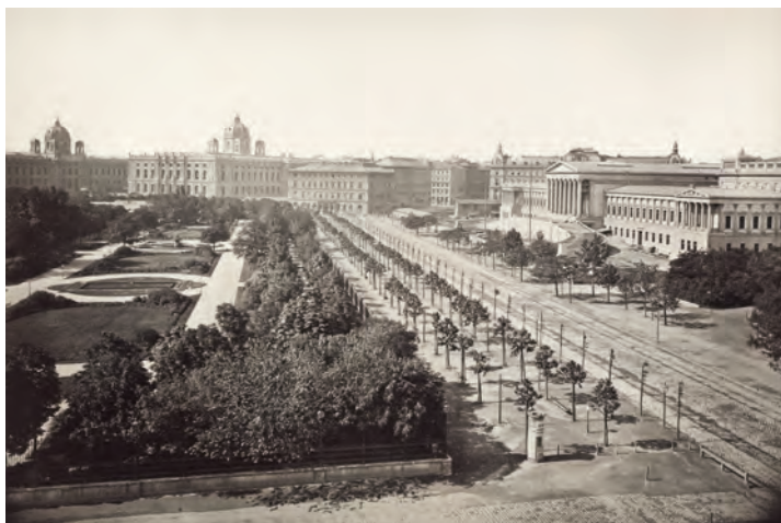
40. View overlooking the Volksgarten and Parliament, by an unknown photographer. 1882.

preoccupied the city's greatest minds. Pioneering architects and designers such as Wagner, Loos, Josef Hoffmann and Josef Frank, as well as artists such as Gustav Klimt and Kolomon Moser, endeavoured above all to fashion a new form of human dwelling. The Secession's exhibitions were at bottom experiments in Raumkunst : a new art of the interior space of home. Although not professional architects, Vienna's two most famous sons were deeply involved in this task. From 1925 to 1928 the philosopher Ludwig Wittgenstein laboured on the design of a house for his sister Margaret, creating on Kundemangasse what remains the most astonishingly modern of all Viennese interiors. And, first on the Ring and then on the nearby Berggasse, Freud created for the practice of psychoanalysis a unique interior space, part antiquities museum, part private domicile, where people who 'suffer principally from reminiscences' 22 could find relief through the talking cure.