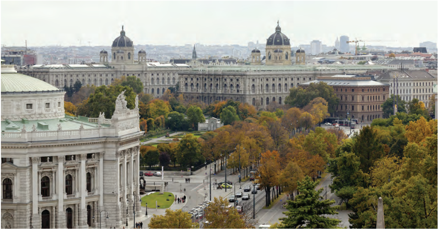
37. View over the Burgtheater to the museums and the Palais Epstein am Burgring, 2015. Photograph by Nora Schoeller. (From A. Fogassy, ed.: Vienna's Ringstrasse: The Book , Ostfildern 2015).

we are and whatever we will become derives from what we originally were. In architecture, this meant that a building's form and ornamental style should derive from that building's historical origins. Thus on the Ring, with perfect programmatic clarity, Parliament (1883) is in the Greek Revival style because legislative democracy was born in Athens (Figs. 39 and 40); City Hall (also 1883) is late Gothic because the trade capitals of the Burgundian Netherlands gave birth to municipal self-governance; and the Burgtheater is early Baroque because that era saw the happy alliance of the three estates (clergy, courtiers and commoners) in their shared love of theatre. 14 Architects understood that the forms of government and culture had changed since their point of origin, but new construction and manufacturing techniques enabled historical styles to be mass-produced and attached as cladding to buildings of a functional design. In the case of the Renaissance-style University, an especially bitter dispute arose over whether the new activities of scientific experiment, as well as learning's orientation towards the future, were served by older forms.