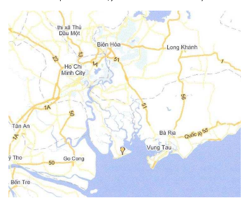
The mudflats where we saw White-faced Plovers are marked with a yellow arrow