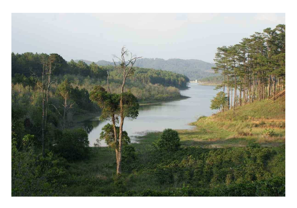
Lake Ho Tuyen Lam