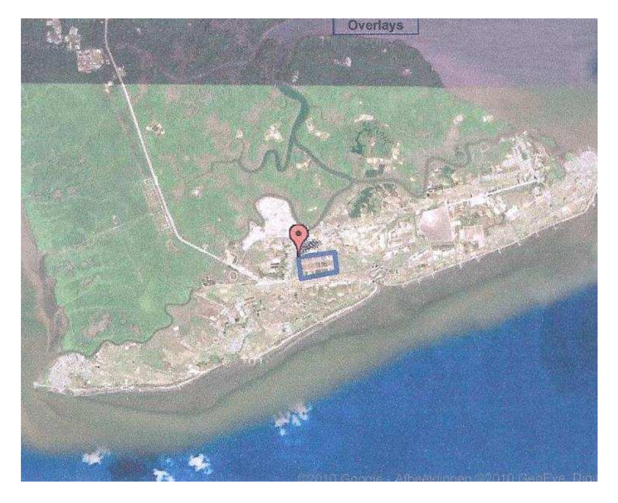
In more detail the place for White-faced Plover, Can Gio

For more information about White-faced Plover, see: <a href="http://www.thaibirding.com/ornithology/lostplover.htm">http://www.thaibirding.com/ornithology/lostplover.htm</a>