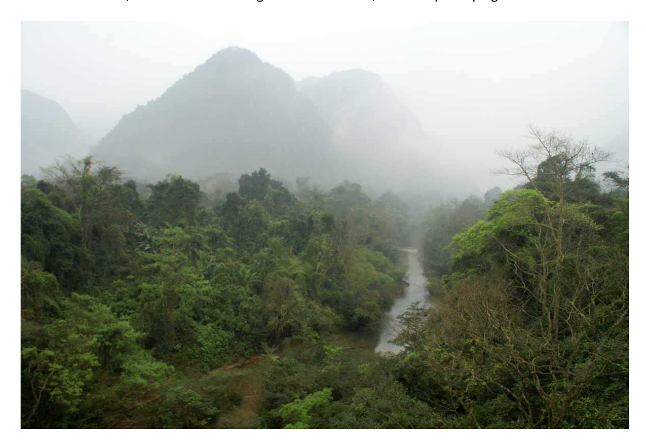
Phong Nha Kebang National Park

Greenpigeon (flying over), a big flock of Oriental Pied Hornbill, Black-throated Laughingthrush (heard only), Orange-bellied Leafbird (heard only), Large Cuckooshrike (heard only), Red-headed Trogon (brief views of 2 birds) and 9 White-winged Magpies flying in the distant. We tries in vain for the rare Red-Collared Woodpecker. One other star bird of this park, the Sooty Babbler, was also heard only, when it responded on the I Pod, but stayed in the cover. We returned at 18.15 PM in the hotel where it soon cooled down. So wearing a fleece we had dinner in the open air. The beer this time was the local brand "333", not bad at all. The night was rather cold, so we slept keeping on our fleeces.