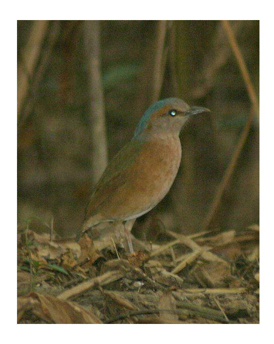
Blue rumped Pitta