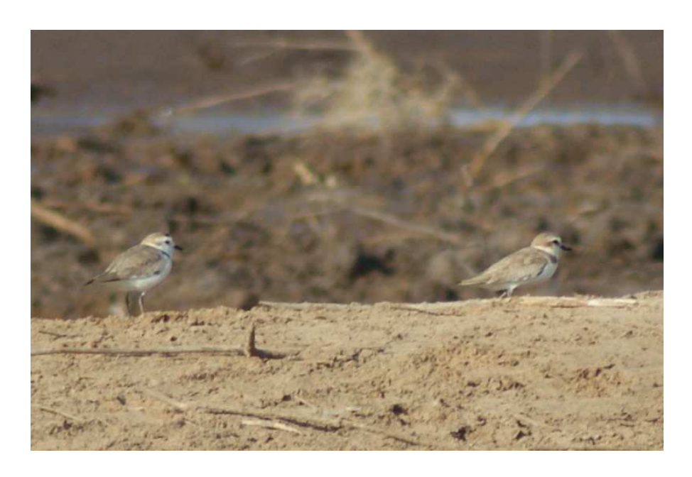
White-faced Plover (left) with Kentish Plover, Can Gio

For more information about White-faced Plover, see: <a href="http://www.thaibirding.com/ornithology/lostplover.htm">http://www.thaibirding.com/ornithology/lostplover.htm</a>