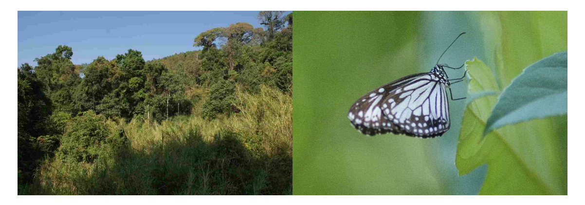
Ta Nung Valley