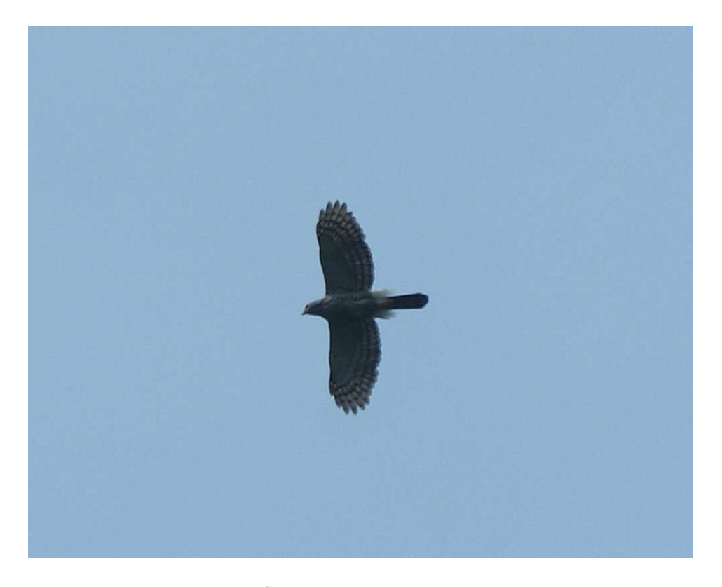
Crested Goshawk in display flight

We woke up at 5.00 AM again and this time breakfast consisted of two tough baguettes met fried eggs. We birded Phong Nha Kebang National Park until 9.30 AM, especially in the productive area 1 kilometer after the second large bridge. It was a bit drizzling and cloudy (19°C).