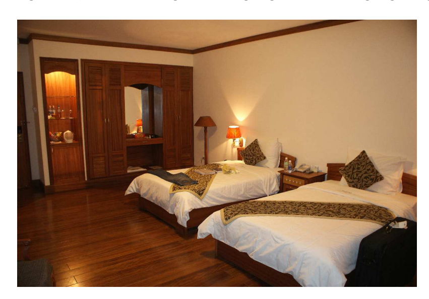
HAGL Resort, Da Lat

We had an excellent lunch at 13.30 PM with well fried thick chips (we call them Vlaamse frieten), rice, sweet and sour pork, beef, fried shrimps, salad and stuffed omelette. From the van we saw Bluetailed Bee-eater, Dollardbird, Indian Roller and many egrets. In a hilly area we had our first Striated Swallows and a nice Blue Rock Thrush of the subspecies philippensis (red belly). We birded along the main road in Bi Doup Nai Ba National Park, in search for Blyth's Kingfisher (in vain). We only had two Common Kingfishers, but also Annam Barbet, Mrs Gould's Sunbird (splendid male), 4 Slaty-backed Forktails, Grey-faced Buzzard and a Large-tailed Nightjar flying in the dusk. We reached Da Lat, a nice big town with French influences, at 18.50 PM and checked in the HAGL Resort. A very good hotel with spacious, clean rooms and very nice bathrooms. Very good beds. During dinner (good food with Tiger Beer) we met Truong, who was going to assist Quang in guiding us.