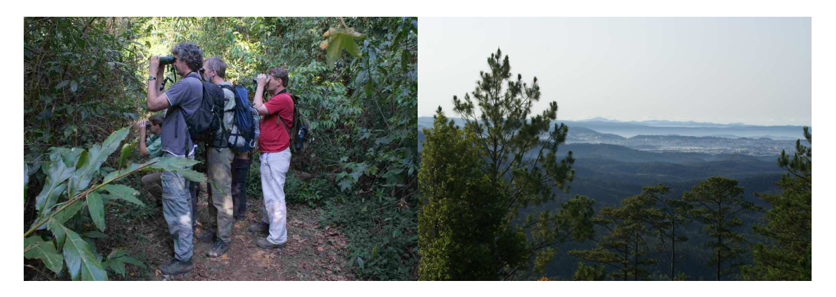
Looking for Collared Laughingthrush

This time we had a quick breakfast at 5.15 AM so we headed for Mount Lang Bian at 5.45 AM. After half an hour we reached the entrance and turned over to a jeep (which is obligatory). We were dropped at the start of Trail D, which is the trail every birder takes. But Quang knew this as well, so we considered the events of the afternoon before as an incident. The trail goes to the summit of the mountain through rather open pine forest and after some while (after passing a gully) tropical forest. The weather was exceptional: sun, 26 °C, little breeze. Today our luck changed somewhat, although we couldn't find Vietnamese Cutia. The star bird however was the Collared Laughingthrush. With much patience and some play back we managed to attract some of this beautiful birds, just behind the gully, but none came in very close. Only one bird showed some parts of this body: black head, silver cheeks and redbrown breast. Too bad Pim didn't succeed in seeing this bird. Other good records involved Little Pied Flycatcher, Rufous-capped Babbler, Grey-bellied Tesia (only heard), Snowy-browed Flycatcher, Blyth's Leaf Warbler, Mountain Tailorbird, Pygmy Wren Babbler (only heard responding on tape). Wim was the lucky bastard who saw the only Black-crowned Fulvetta of the trip.