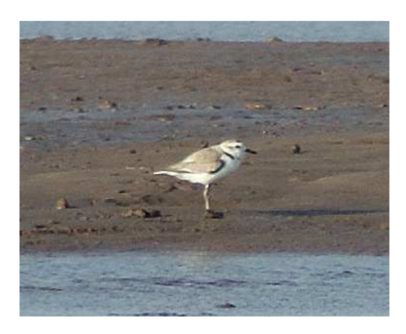
White-faced Plover, Can Gio

On our way back we made a short stroll on a trail into the silent mangroves, which produced some hear only records of Pied Fantails and Golden-bellied Gerygony and a nice Striated Heron. We heard our first of many Yellow-browed Warblers. After that we returned to Ho Chi Minh City where we had a delicious BBQ dinner buffet in the open air restaurant Lau Nuong. Some nice cold beers of some obscure Russian brand tasted well. At 21.00 PM we were back in the Park Royal Hotel and fell in a deep sleep after a long journey which began yesterday with the departure from Amsterdam.