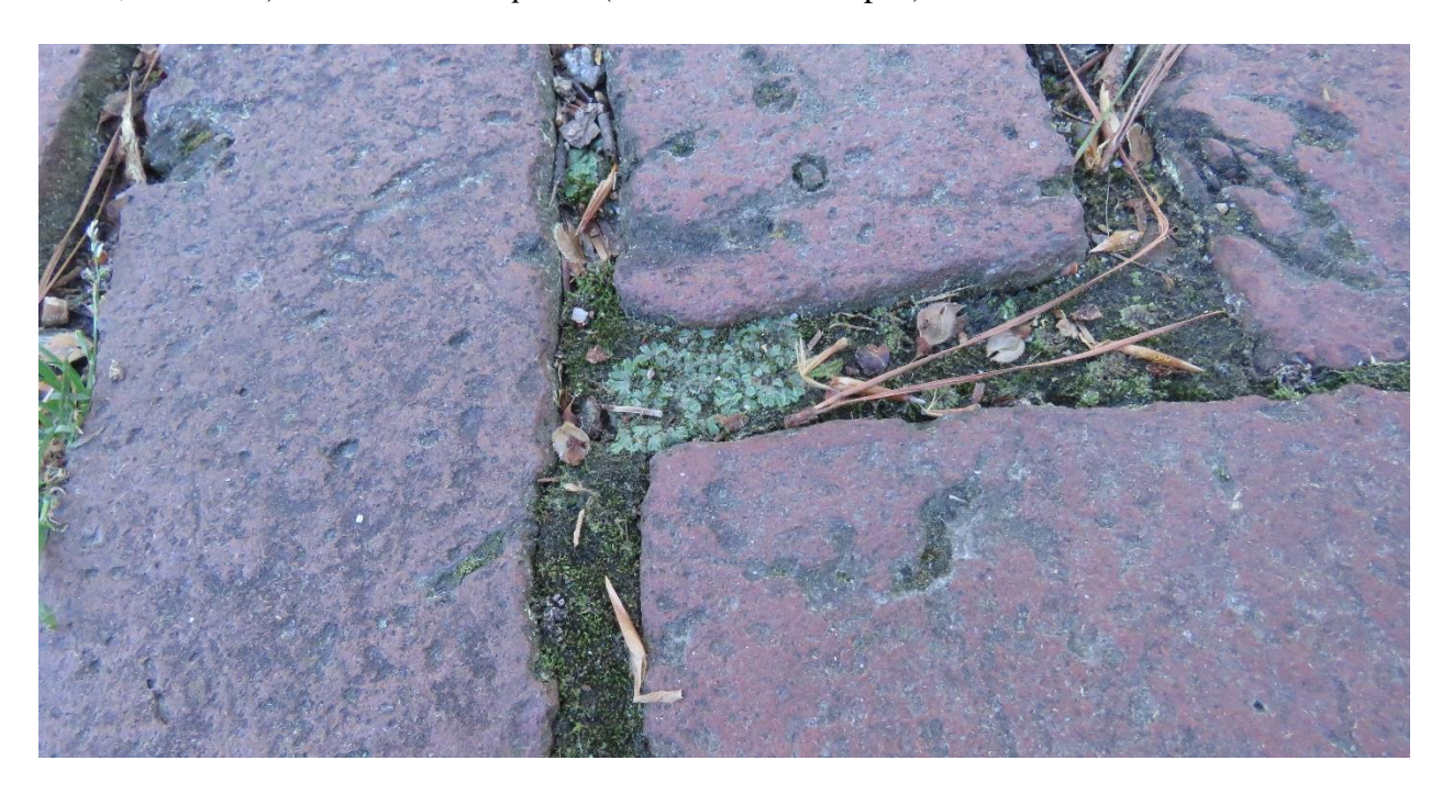
Figure 2. Riccia beyrichiana.

ravine slope); Pohlia wahlenbergii (creek bank on campus), Hypnum cupressiforme (brick walkway on campus), Leptobryum pyriforme (brick wall and moist soil on campus), and Schistidium viride (Fig. 4) (concrete on campus); and the liverworts Reboulia hemisphaerica (no habitat recorded, Patterson) and Frullania riparia (brick wall on campus).