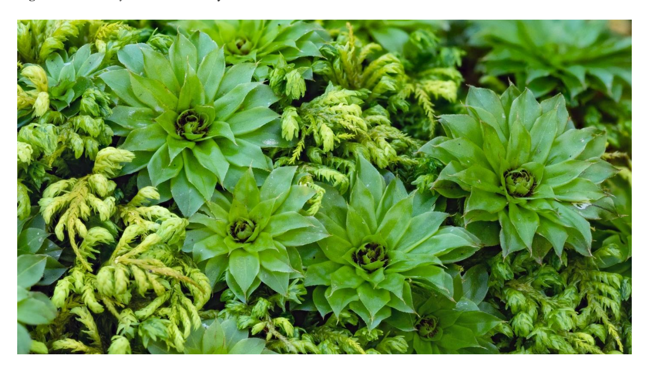
Figure 3. Rhodobryum ontariense .