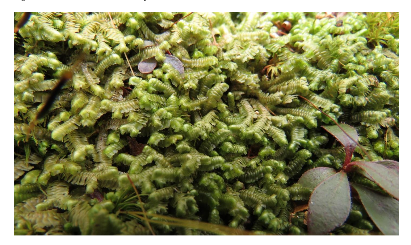
Figure 6. Bazzania trilobata.