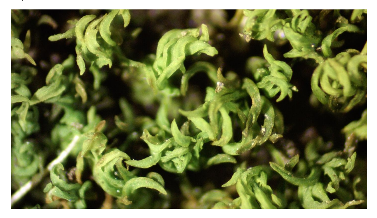
Figure 5. Weissia controversa.

resembling a millipede. Another liverwort, Riccia beyrichiana , grows in several areas of James City County but only a few rosettes were found on campus in the brick mortar of a shaded walkway.