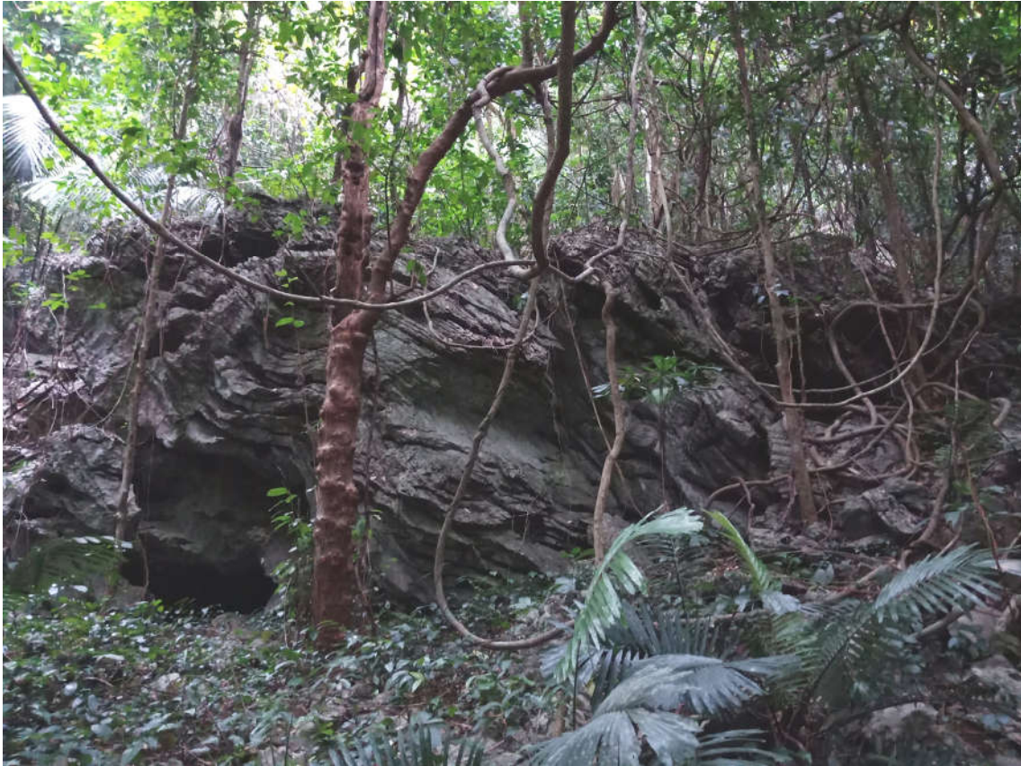
Figure 3. Habitat of Cyrtodactylus bobrovi in the limestone karst forest of Cuc Phuong NP