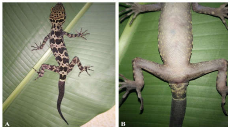
Figure 1. (A) Dorsal and (B) ventral view of the adult female Cyrtodactylus bobrovi (CPNP R.2017.122) in life from Thanh Hoa province

0.69), distinct from neck; loreal region concave; snout long (SE/HL 0.46), longer than diameter of orbit (OD/SE 0.51); snout scales small, granular; eye large (OD/HL 0.23), pupils vertical; ear oval shaped, small (ED/HL 0.06; rostral wider than high, rostral bordered by nostril, and supranasal and first supralabial on each side; nares round, surrounded by supranasal, rostral, first supralabial, and three postnasals; mental triangular; postmentals two, enlarged, in broad contact posteriorly, bordered by mental anteriorly, first infralabial laterally, and an enlarged chin scale posteriorly; supralabials 11 - 10; infralabials 11 - 10. Dorsal scales granular; dorsal tubercles round, conical, present on occiput and back, each surrounded by 9 - 10 granular scales; ventral scales smooth, medial scales 2 or 3 times larger than dorsal scales, round, in 41 longitudinal rows at midbody; lateral skin folds indistinct without tubercles; gular region with homogeneous smooth scales; 198 ventral scales between mental and cloacal slit; precloacal groove absent; enlarged femoral scales present; precloacal pores 7, in an inverted V-shaped arrangement; pore-bearing enlarged; femoral pores absent; postcloacal tubercles 2/2; dorsal surface of fore and hind limbs with few lightly developed tubercles; fingers and toes without distinct webbing; lamellae under fourth finger 21, under fourth toe 24.