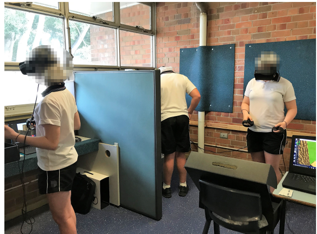
Figure 2: The VR space at one campus.

Even with the Guardian system in place, constant observation of students in VR was required by either the researcher or a student designated as a 'spotter' - a term used for someone with the role of spotting potential risk and keeping students safe. The teacher was unable to provide constant supervision as their role is necessarily