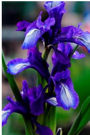
Iris aucheri 'Indigo'

Iris aucheri 'Indigo' Deep Indigo blue flowers on this Juno species make it a showstopper. $8