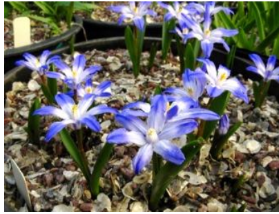
Chionodoxa 'Valentines Day'

Chionodoxa 'Valentines Day' Blue-Starry shaped flowers, early, Pair with Colchicum hungaricum 'Valentine', for a great early show in troughs, pots or rock garden $3