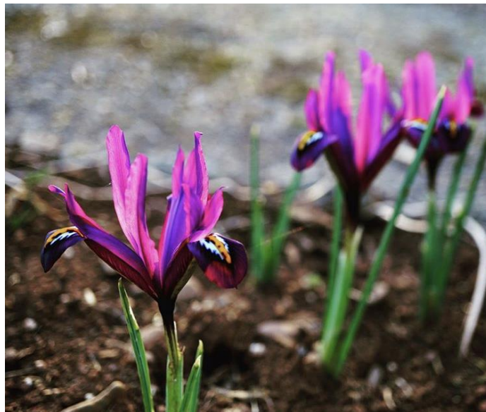
Iris reticulata JS Dijt.

Iris reticulata JS Dijt Plum colored version of the above, with intensely marked, white, yellow and black falls. $3