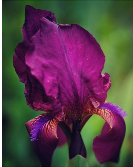
Iris reichenbachii Berry from.

Iris reticulata So much easier than the pesky Junos, since they don't have those fleshy storage roots to worry about. This is a nice purple, early blooming form. $3