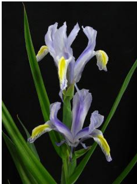
Iris vicaria x microglossa "Marjaneh"