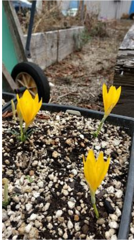
Sternbergia in late autumn

Sternbergia lutea The indomitable Autumn Daffodil, as it's sometimes called, is a beautiful fall bloomer with deep yellow flowers. $4