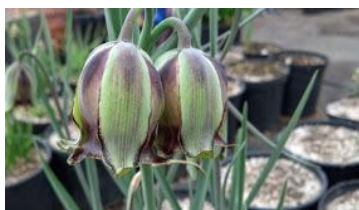
Fritillaria acmopetala 'Dark Form'

Fritillaria acmopetala 'Dark Form' Eastern Med; $6