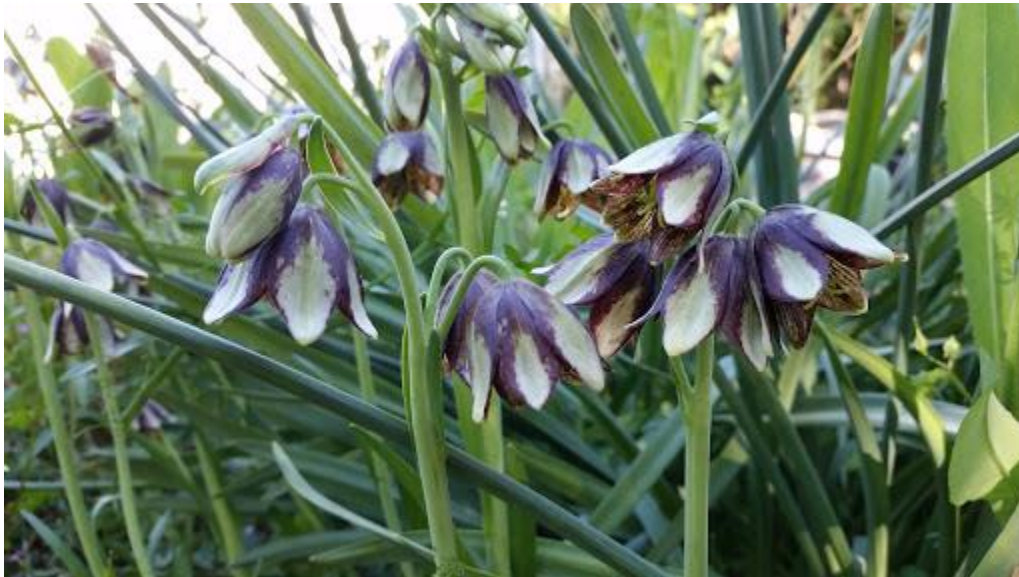
Fritillaria biflora ssp. ineziana

Fritillaria biflora v. ineziana Another quite rare Californian endemic, the Hillsborough Chocolate lily, is really a good garden specimen, a later bloomer than many of the Mediterranean fritillary species it's often the last species in bloom here in the Willamette valley. $6