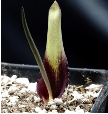
Biarum tenuifolium ssp. abbreviatum

Brimeura fastigiata Tiny plants with dark purple fls; hardy to at least 9 deg. F., for containers under protection from excess rain. $4