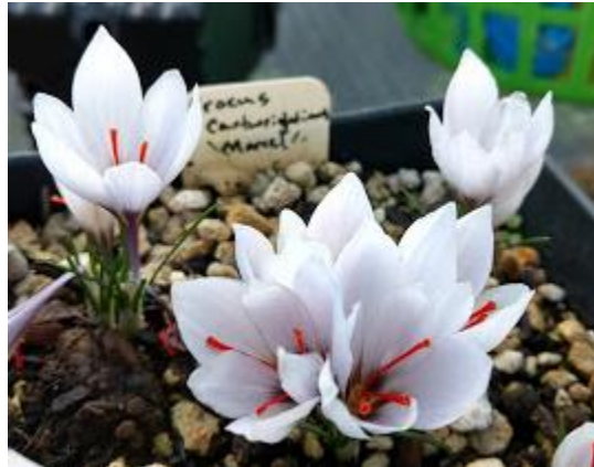
Crocus cartwrightianus 'Marcel'

Crocus cartwrightianus 'Marcel' Stunning selection by Antoine Hoog, white, with large stigmata and anthers. $5