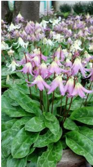
Erythronium 'Pacific Sunset Strain'

Dichelostemma multiflorum Tight heads of purple-blue flowers on long stems, late spring. $3