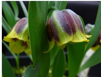
Fritillaria crassifolia JJA 17255

Fritillaria crassifolia JJA 17255 From the Archibald catalog: Iran, Kordestan, SW of Daraki (S of Marivan). 2500m. SW-facing limestone slope. #2nd pic (This coll. has to be almost precisely on Wendelbo's Iranian locality for F. crassifolia subsp. poluninii but this is a big, robust plant about 25cm. $6