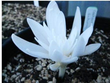
Colchicum 'White Waterlily'

Colchicum atropurpureum 'Drakes Form' An old form, known for its sweet, honey and clove scent. $6 sold out