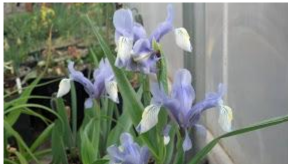
Iris graeberiana 'White Fall'

Iris graeberiana 'White Fall' Scorpiris from Tajikistan, and Turkestan. Stunning iris for the collector and knowledgeable grower. $9