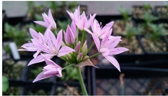
Allium unifolium 'Wayne Roderick'

Allium unifolium 'Wayne Roderick' Late spring bloomer with electric lavender pink flowers, named for the famous California bulb man who introduced it into the trade. $3