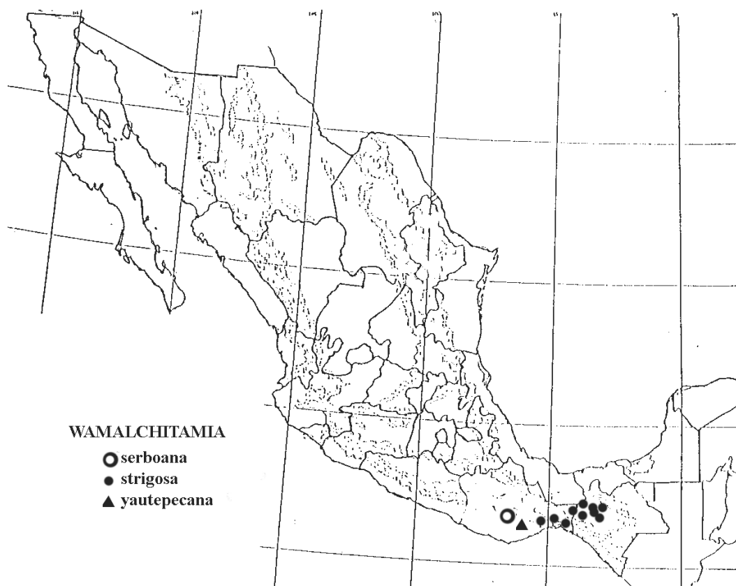
FIG. 3. Distribution of Wamalchitamia serboana , W. strigosa , and W. yautepecana .

This species is known to me only by the specimens cited by Strother (1991).