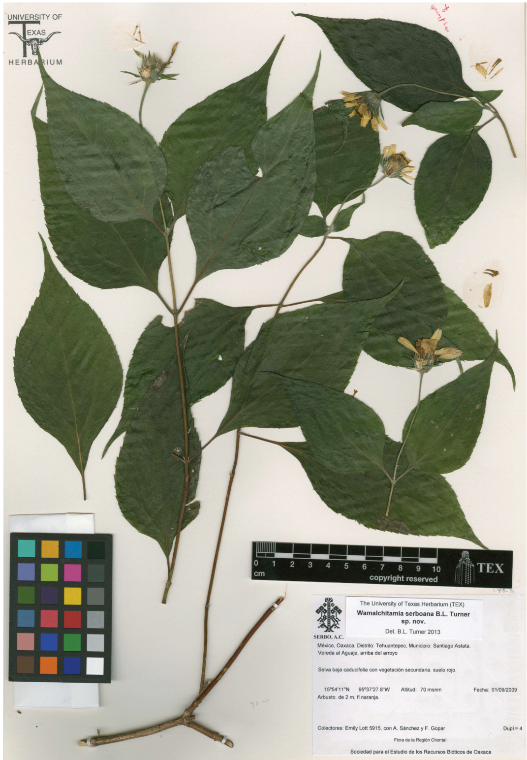
FIG. 2. Wamalchitamia serboana (Holotype).