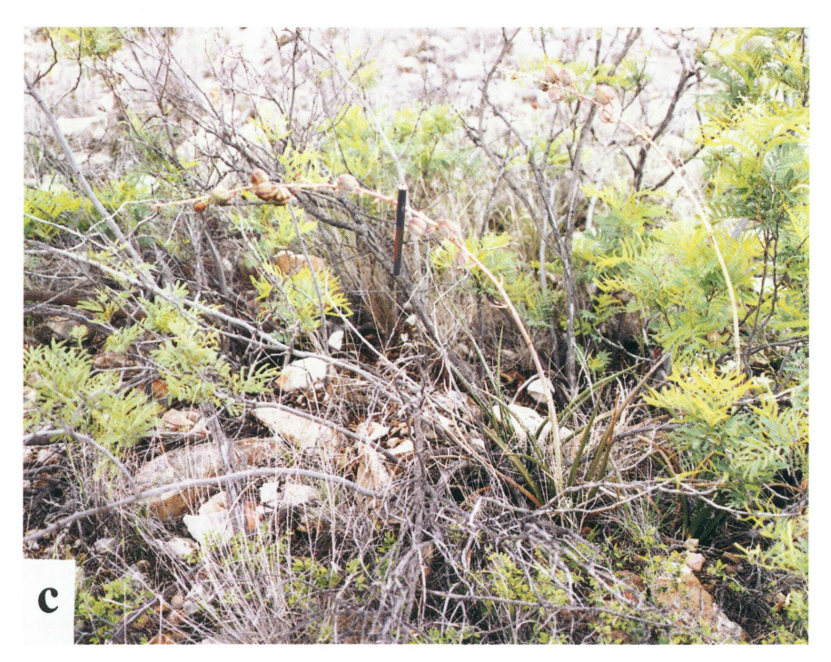
FIG. 1. a. Immature ovary and style of Hesperaloe engelmannii . b. Ovary and style of H. parviflora . c. Hesperaloe parviflora : showing habit, 6 miles east of Langtry, Val Verde County ( Turner 20-366 , TEX).