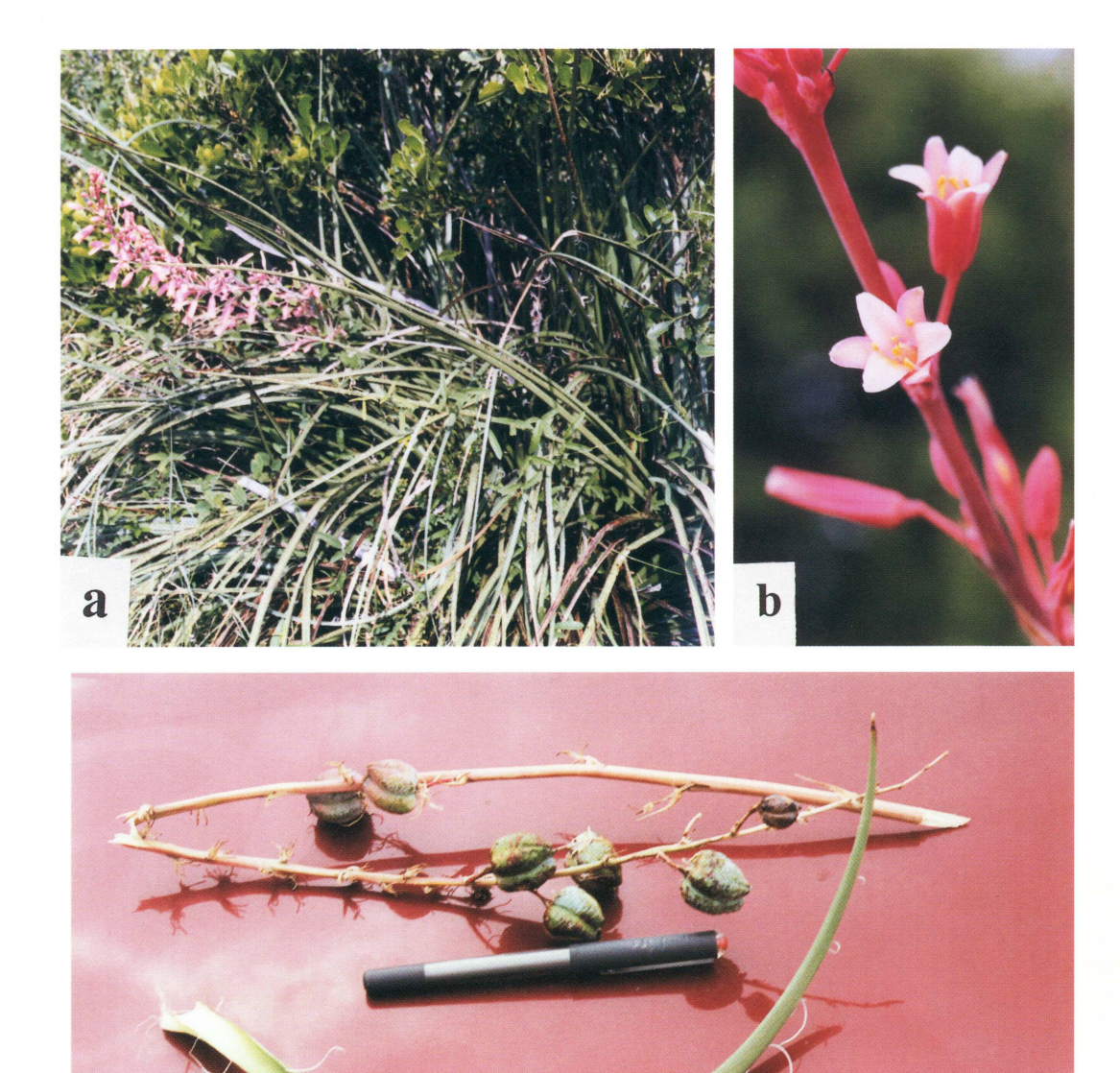
FIG. 2. Hesperaloe engelmannii. a. Habit, Edwards County (Turner 99-367). b. Flowers, Mills County (Turner s. n.). c. H. parviflora, fruiting racemes and longest leaf from plant shown in Fig. 1c.

One Mile Canyon), 28 May 1999, B. L. Turner 99-69 (TEX).