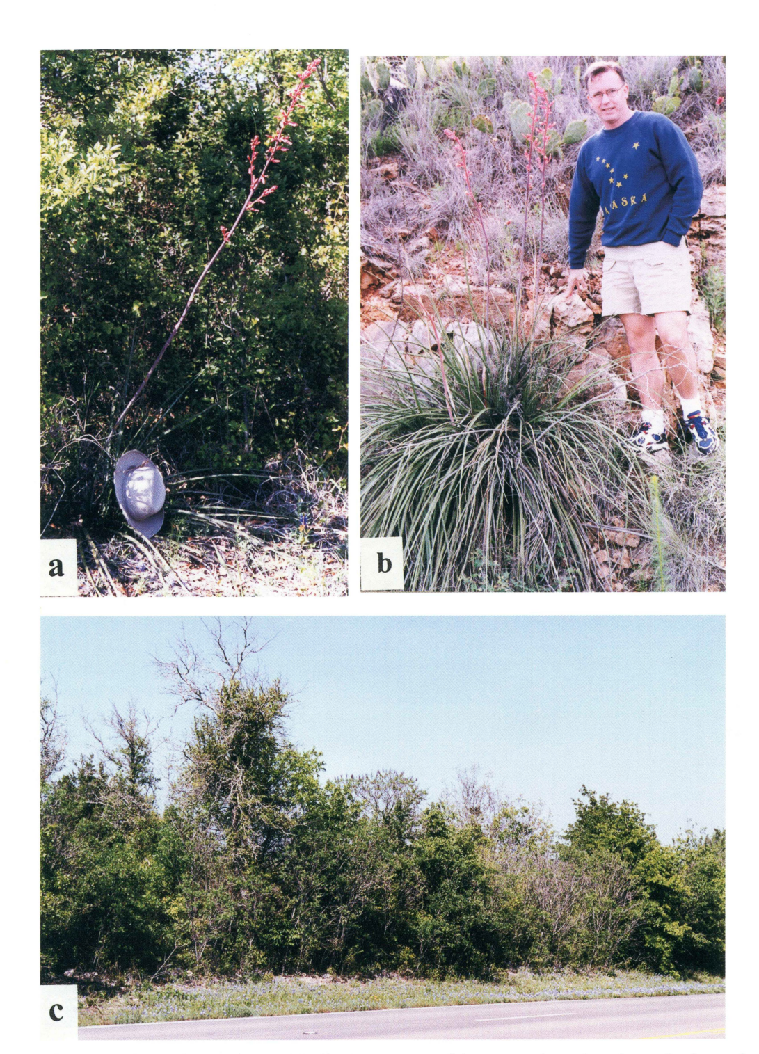
FIG. 3. a. Hesperaloe engelmannii , Mills County, one of the 15–30 plants found growing beneath the trees at the site shown in Fig. 3c. b. Individual of H. engelmannii from San Saba County, along with junior author. c. Roadside habitat of 15–30 plants of H. engelmannii , one of these shown in 3a.