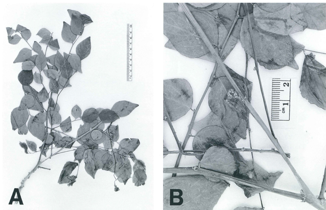
FIG. 2. Habit of Phyllanthus liesneri (Liesner et al. 7780, DAV). 2a, Branch with branchlets. 2b. Part of branchlet with node of indurated floral bracts.

PHENOLOGY: Collected in flower April, June; in fruit July.