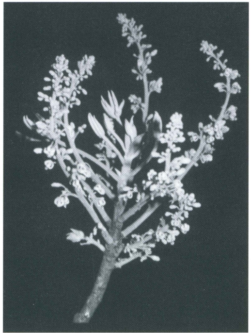
FIG. 4. Sterculia xolocotzii . Full flowering and early leaf flush, inflorescences arising from axils of fallen leaves of previous flush. Figs. 3 and 4 are from the same tree at the same time. (Wendt et al. 5260).

gy Station, Veracruz, in the extreme northwest portion of the Isthmus. The Uxpanapa region may be loosely characterized as having two floristically different extant major lowland rain forest types: "karst forest," an edaphically drier, partly deciduous rain forest on eroded limestone substrates in the northern part of the region, and "hill forest" in the strongly hilly southern part (extending southward into the Chimalapa area) with very deep soils derived partly from sedimentary substrates but mostly from the granites and associated igneous rocks of the Sierra de Tres Picos to the south (see Wendt, 1997, for overview of the area). Between these two major forest types is a flat alluvial east-west strip several kilometers wide and over 100 kilometers long from which the original forest has been completely removed, the original nature of