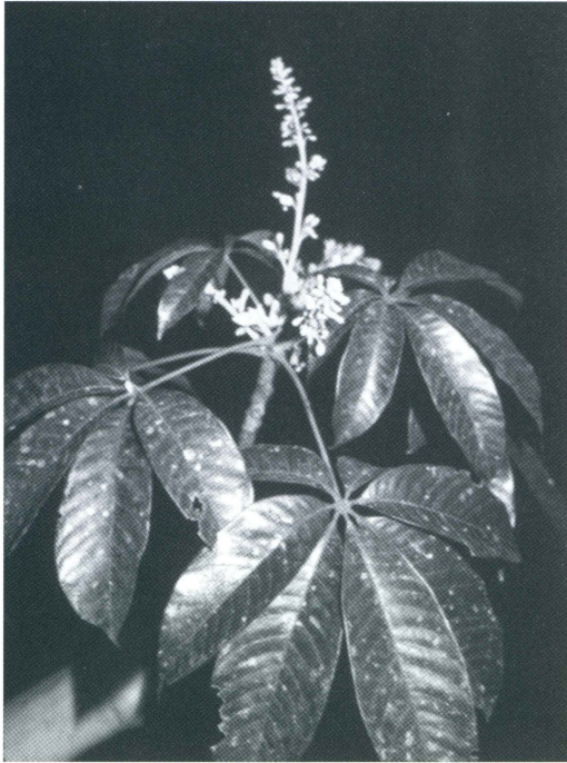
FIG. 3. Sterculia xolocotzii . Early stage of flowering, mature leaves of previous leaf flush still present. (Wendt et al. 5260).