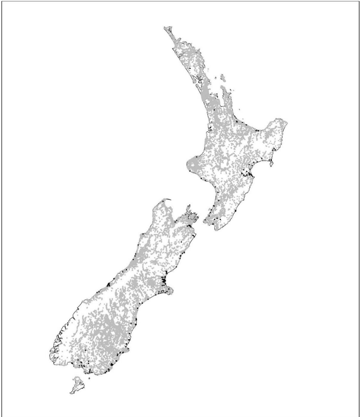
Figure 2: Locations of NZFFD records where black flounder are present (black circles) and absent (grey circles).