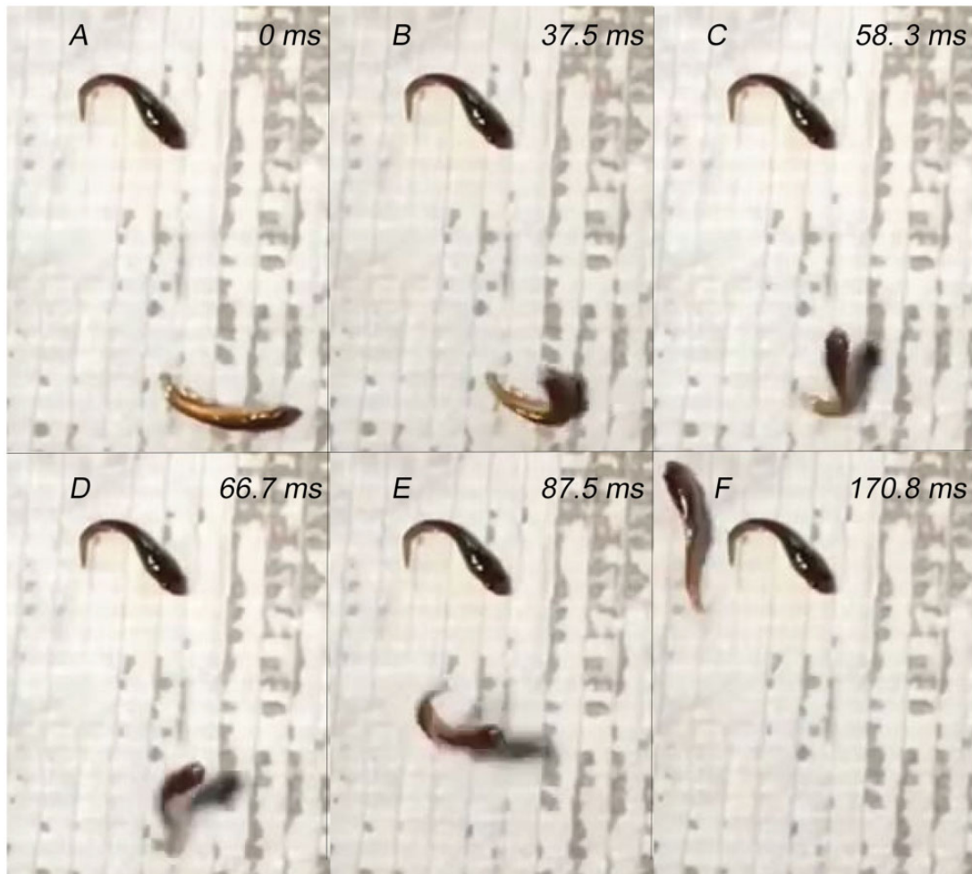
Fig. 4 Juvenile northern snakehead tail-flip jump. (A) A juvenile northern snakehead (bottom right of the panel, ~3.2 cm in TL) begins a tail-flip by lying on its lateral surface, and then (B) lifts its head above the substrate and bends it towards the tail, making a C-shape with the body. (C) Once the fish is maximally bent, it rapidly pushes against the substrate with its caudal peduncle, (D) launching itself into a ballistic flight path. (E) While the fish is airborne, it can travel several body lengths before landing (F) next to a stationary northern snakehead.

therefore, the tilted boat deck data were included in neither the ANOVAs nor correlation tests for velocity and relative velocity. While most individuals moved downslope on the tilted boat deck, one individual moved upslope, but was not included in the statistical analysis. Electrode implantation had no significant effects on any kinematic or performance parameters for individuals moving on turf (Table 3), so data from individuals with electrodes implanted were combined with the rest of the turf data for comparisons to other substrates. Overall, small northern snakeheads moved differently than large ones. As length increased, absolute velocity and CC significantly increased, while relative velocity and head and COM WA significantly decreased (Tables 2 and 3; Fig. 3).