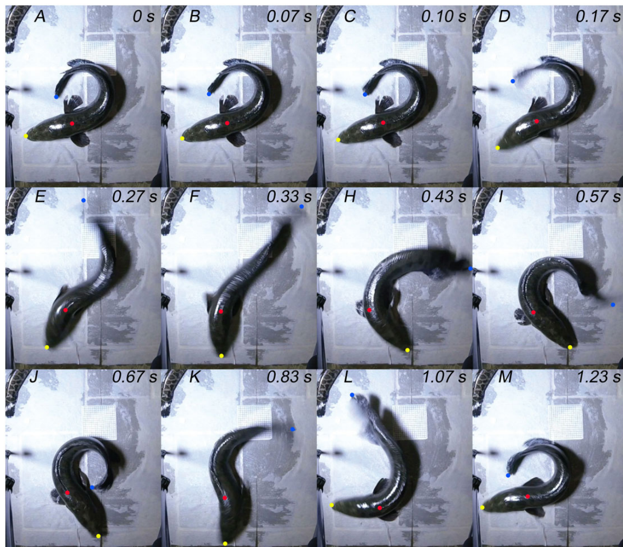
Fig. 2 Northern snakehead forward crawl behavior. (A) A northern snakehead begins crawling by (B) moving its head toward the left and swinging the tip of its tail laterally toward the right. (C) The head and tail continue to move as the left pectoral fin begins retracting. (D) The right pectoral fin begins to retract, and the tail tip has achieved its approximate maximum lateral amplitude as it begins swinging toward the body's midline. (E) Both pectoral fins are fully retracted as the head crosses the midline of the body. The fish rolls along its longitudinal axis partially onto its left pectoral fin, while the posterior axial body appears to push against the substrate. (F) The pectoral fins begin to protract as the tail crosses the body's midline. (H) The fish rolls along its longitudinal axis toward the right side of its body as the tail tip rapidly increases in amplitude toward the left. (I) Both pectoral fins are fully protracted and the head has reached its maximum amplitude on the left side of the body. (J) The head begins moving back toward the right as the tail tip has reached its maximum amplitude on the left. The pectoral fins begin to retract. (K) The head and tail are both moving toward the right side of the body as both pectoral fins are fully retracted. The fish rolls partially onto its right pectoral fin, as the posterior axial body appears to push against the substrate. (L) The head has approximately reached its maximum amplitude as the fish rolls toward the left side of its body and rapidly increases the tail tip amplitude on the right side of the body. (M) The tail tip has reached its maximum amplitude on the right side of the body and the head begins moving back toward the left side of the body, starting a new stride. The three points tracked—tip of the snout, anterior insertion of the dorsal fin/COM, tip of the tail—are shown by yellow, red, and blue dots, respectively.

push against the substrate to provide forward thrust. In addition to potentially providing thrust, the pectoral fins help support the fish, likely keeping them upright and preventing excessive rolling. The larger fish that were filmed laterally ( >30 cm) did not lift their ventral surface above the substrate (Supplementary Video S3).