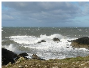
Stormy seas off the headland of Trwyn Porth Dinllaen .

The lifeboat station at Porth Dinllaen opened in 1864 and has been manned ever since. It is claimed to be the only station where the crew habitually communicate in Welsh. It was the subject of an S4C series in 2013.