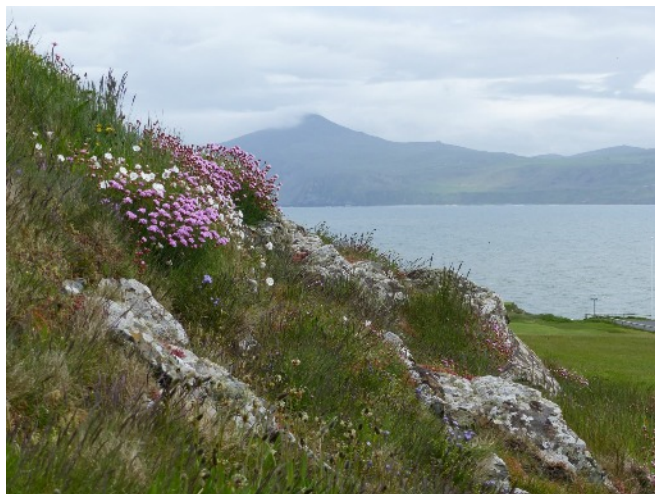
Thrift, Sea Campion and Spring Squill flourish on Trwyn Porth Dinllaen , which offers superb views across Porth Nefyn to Yr Eifl.

The lifeboat station at Porth Dinllaen opened in 1864 and has been manned ever since. It is claimed to be the only station where the crew habitually communicate in Welsh. It was the subject of an S4C series in 2013.