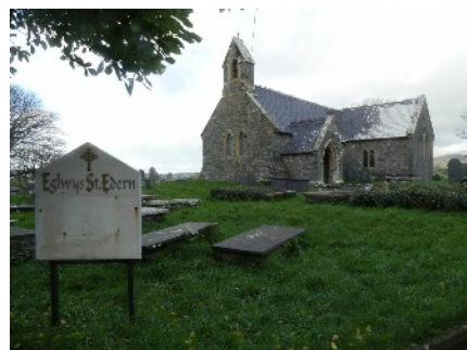
The simple Victorian Church of St Ederne retains some 15th-century roof timbers and occupies a medieval site.

Cors Geirch is an alkaline bog of international importance and a National Nature Reserve, the highest designation.