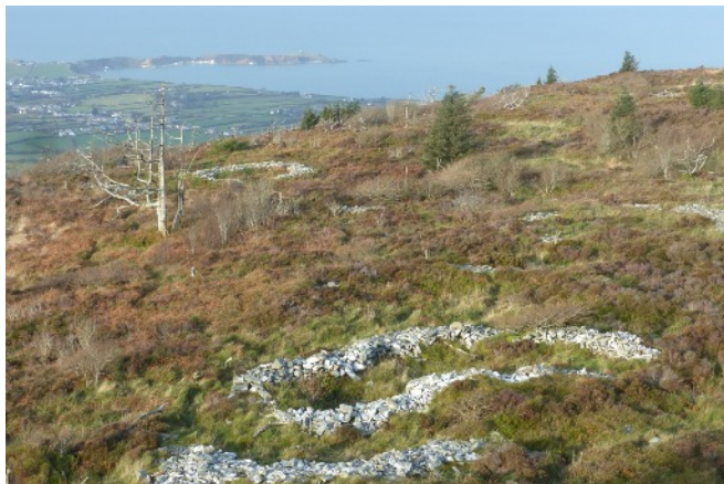
Over 100 hut circles have been identified below the Iron Age hill fort on Garn Boduan .