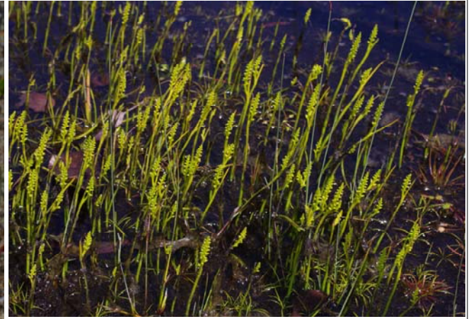
L-R: Cyrtostylis tenuissima, Cyanicula gertrudiae, Microtis atrata.