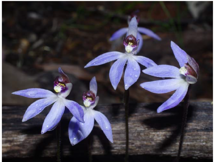
L-R: Pterostylis sp. 'Ravensthorpe' , Cyanicula aperta

DAY 8: CHEYNES BEACH TO WALPOLE August 22 ND