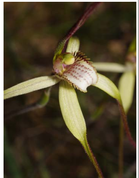
Anticlockwise from the top: Caladenia cairnsiana x polychroma , Caladenia longicauda x pectinata , Caladenia x enigma , C. plicata , Caladenia sp found by D. Lawson.