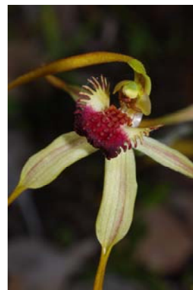
L-R: Caladenia marginata, Microtis brownii, C. magniclavata.