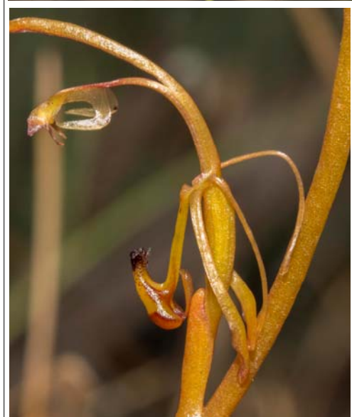
Caladenia serotina (top), Spiculaea ciliata .