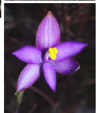
From top (L-R): Car troubles, Caladenia bryceana subsp. bryceana , Prasophyllum ovale , Prasophyllum sp. 'Southern granites', Pterostylis sp. 'sparse', Pt. microphylla flower and leaf, Thelymitra speciosa , T. uliginosa , Eriochilus scaber subsp. scaber , happy snapping.