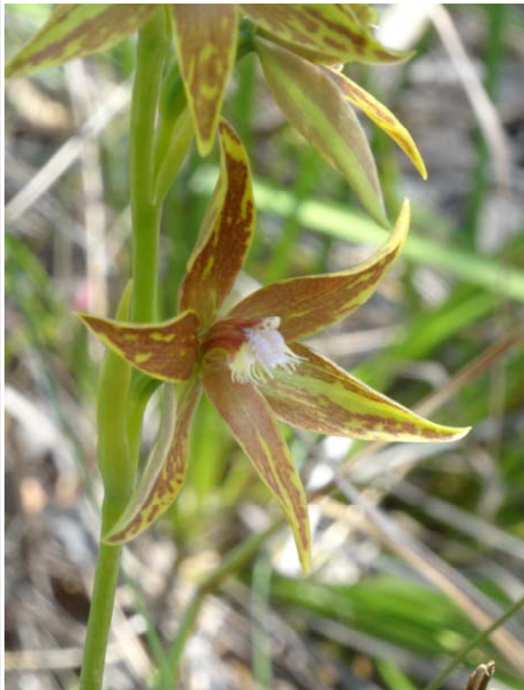
Thelymitra fuscolutea . Photo by T. Hodgkins