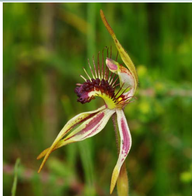
Caladenia corynephora.

Ed: This article is reprinted from an early WANOSCG Bulletin.