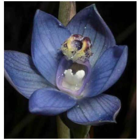
A selection of Thelymitras. Clockwise from left: Thelymitra fuscolutea ; T. cucullata and T. benthamiana ; T. mucida and T. xanthotricha