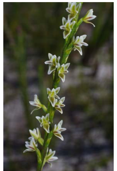
L-R: Prasopphyllum fimbria, hians, gibbosum and plumiforme.