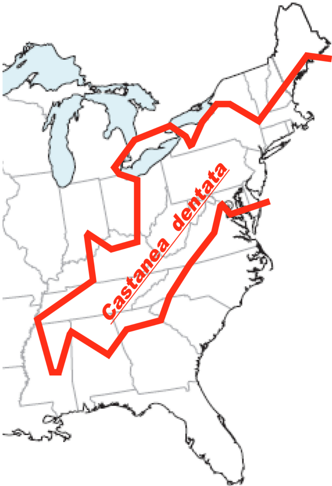
Figure 1: General range map of American chestnut ( Castanea dentata ).