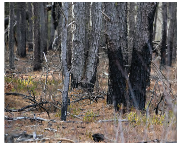
Blackened pitch pine trunks. Photo by Peter Lacouture