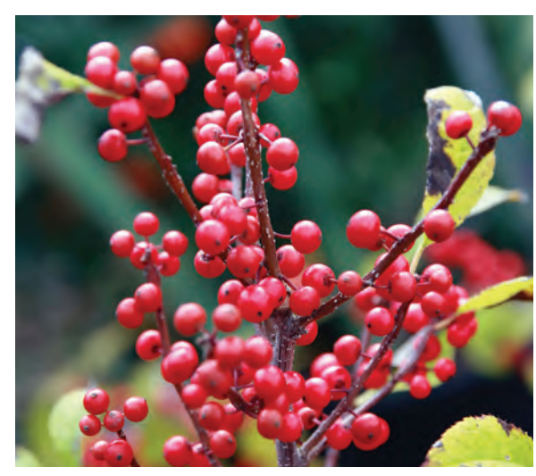
Birds find the fruit of 'Sparkleberry,' an interspecies hybrid bred for its large showy berries, too large to swallow, not to mention distasteful.

RIWPS' two spring plant sales and its fall sale offer a broad selection of native plants as well as knowledgeable volunteers who can help you choose those that will work well in your garden. Many local nurseries also carry native plants and cultivars. The RI Nursery and Landscape Association offers its member nurseries education, training, and certification programs for their staff, enabling them to provide accurate and helpful information.