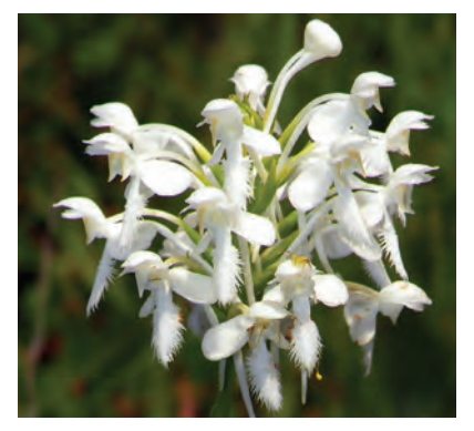
White-fringed bog orchid.

the first to observe and document this process, recording in his journal a pattern of changing vegetation on abandoned fields around Concord.