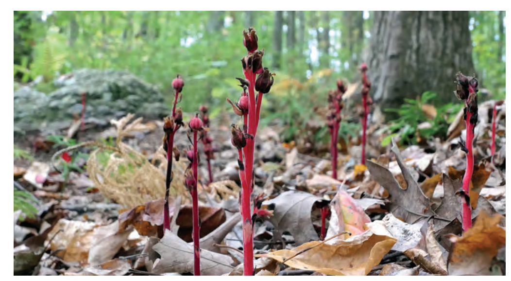
Hairy pine-sap.

Boxelder is common almost everywhere in the Eastern U.S., except New England. Sometimes considered a weedy pest, it evolved as a flood plain