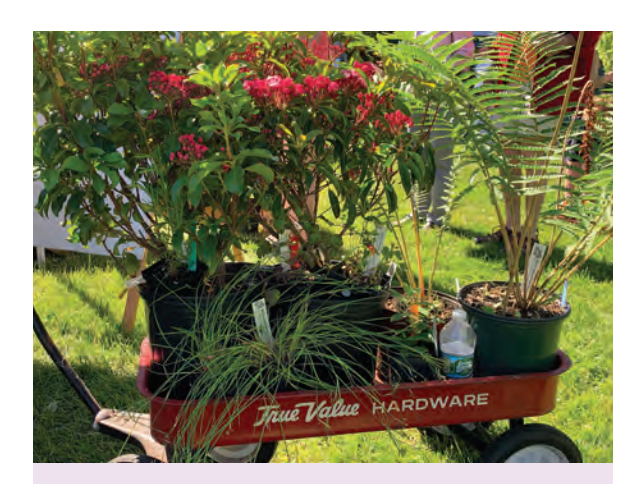
Please check our website, www.riwps.org, for any changes made to RIWPS plant sales or other events due to precautions taken for the coronavirus.

Volunteers are always needed at any of these sales. Email plantsales@riwps. org to help transport plants, set up tents, or help with parking cars.