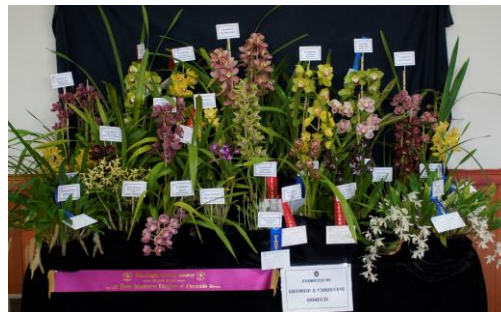
BEST MEDIUM DISPLAY By G & C Dimech