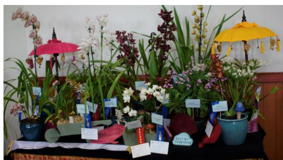
DISPLAY OF ORCHIDS BY NOVICE/ADV. NOVICE By Margret Bastecky