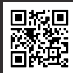
AgWest Farm Credit Employees (formerly Northwest Farm Credit Services) December 2022

Eastern Washington University Students Gonzaga University Students Gonzaga University Women's Softball Team Spokane Community College Nursing Students Setons of Gonzaga University University of Washington School of Medicine Students Whitworth University Students WSU Elson S. Floyd College of Medicine Students WSU Pharmacy & Pharmaceutical Sciences Students