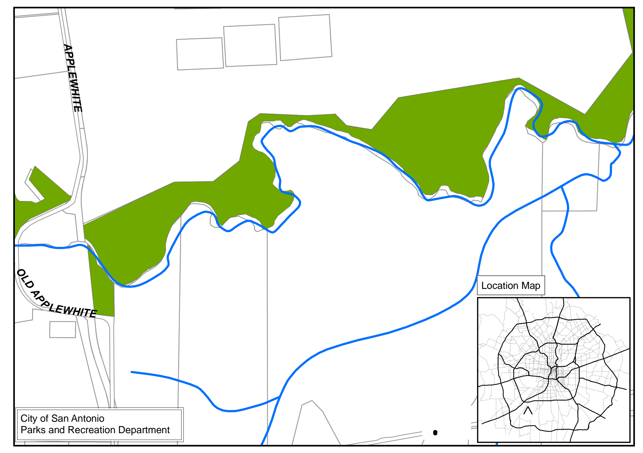
Site Map Medina River Greenway (Old Applewhite Rd to Medina River Crossing)