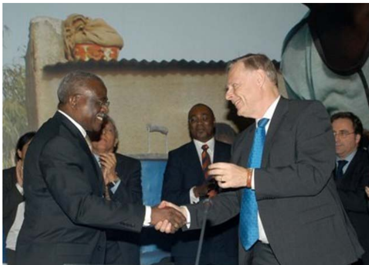
Mr Lennart Båge, President of IFAD and Mr Kanayo F. Nwanze, President-elect of IFAD