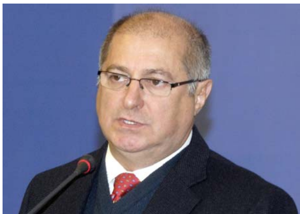
H.E. Paulo Bernardo Silva, Minister for Planning, Budget and Management of the Federative Republic of Brazil