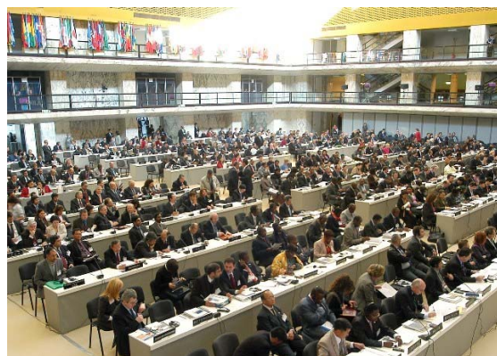
IFAD's thirty-second Governing Council in session