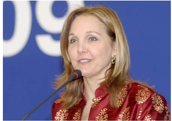
Ms Josette Sheeran, Executive Director of the World Food Programme