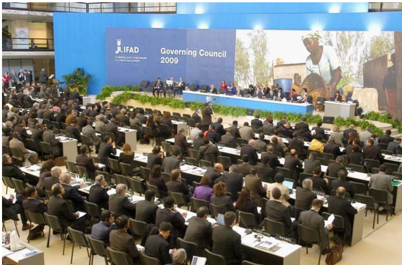
The plenary of the thirty-second session of IFAD's Governing Council