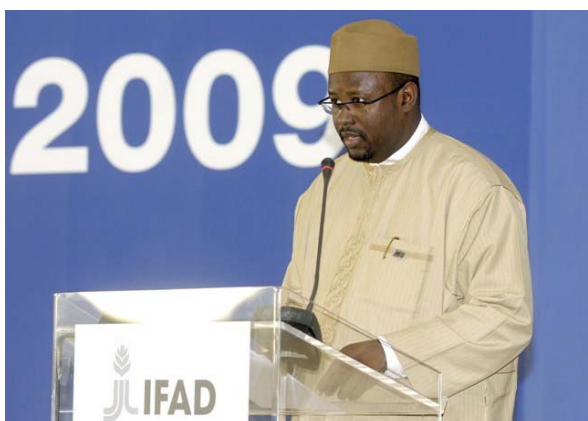
Hon. Dr Sayyadi Abba Ruma, Chairperson of the Council and Governor for Nigeria