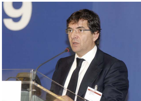
H.E. Nicola Cosentino, Under-Secretary of State Ministry of Economy and Finance of the Italian Republic