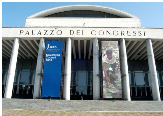
The Palazzo dei Congressi, venue of the IFAD Governing Council 2009