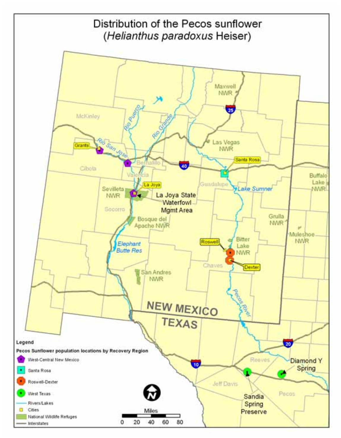
Figure 3. Distribution of Pecos sunflower populations.