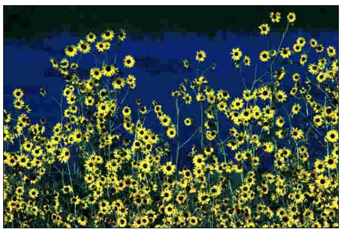
Figure 2. Pecos sunflower in bloom.

Pecos sunflower is an annual, herbaceous plant (Figure 1). It grows 1-3 meters (m) (3.3 - 9.9 feet (ft)) tall and is branched at the top. The leaves are opposite on the lower part of the stem and alternate at the top, lance-shaped with three prominent veins, and up to 17.5 centimeters (cm) (6.9 inches (in)) long by 8.5 cm (3.3 in) wide. The stem and leaf surfaces have a few short, stiff hairs. Flower heads are 5-7 cm (2.0-2.8 in) in diameter with bright yellow rays around a dark purplish brown center (the disc flowers) (Figure 2). Pecos sunflower looks much like the common sunflower seen along roadsides throughout the West, but differs from common sunflower by having narrower leaves, fewer hairs on the stems and leaves, smaller flower heads, and narrower bracts (phyllaries) around the bases of the heads. The prairie sunflower also has narrow leaves and phyllaries, but is distinguished from Pecos sunflower by having a white cilia