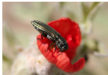
Agrilus lacustris .