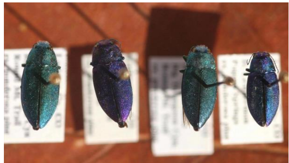
A series of Phaenops gentilis .

Buprestis species of conifers. In higher elevation forested areas of the state there are several brightly colored metallic green wood borers that develop in dead/dying conifers. All are considerably larger than the emerald ash borer (15-22mm), have a broader body form, and have distinctly grooved wing covers.