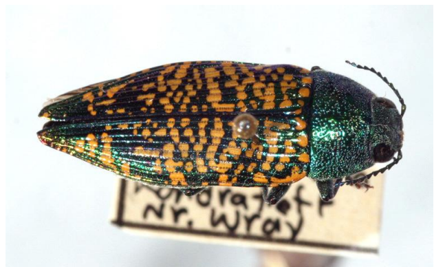
Buprestis confluenta .

Buprestis confluenta . Buprestis confluenta is more widely distributed in the parts of the state where ash is grown, and develops in aspen and cottonwood ( Populus spp.) It is a large (12-20 mm) metallic wood borer with green wing covers (occasionally a coppery-brown or purplish-blue) marked with yellow spots. These yellow spots are not found on any other species and make it easily distinguishable from other metallic green wood borers including the emerald ash borer.