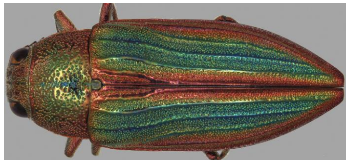
Buprestis aurulenta , the golden buprestid.

Buprestis aurulenta , known as the golden buprestid, develops in Douglas-fir and ponderosa pine.