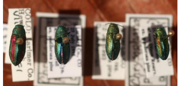
A series of Chrysophana placida .

Native Agrilus species. There are a great many Colorado native species of metallic wood borers in the same genus as the emerald ash borer, Agrilus . All are smaller in size and less intensively colored than is the emerald ash borer and most are bronze or reddish brown. But a few have metallic green hues of their wing covers. Examples include Agrilus cyanescens , a blue-green beetle about 6-mm in length that develops as a borer in honeysuckle. Agrilus pulchellus has wings with a green center band, but the wings are bordered by reddish purple. It is known to exist in Weld County and ranges in size from 7-11 mm. In southeastern Colorado Agrilus pulchrellus is present. It is usually bronze, but greenish forms exist.