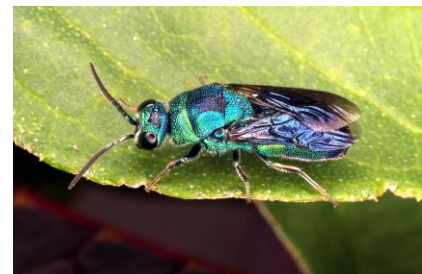
Cuckoo wasp.

Cuckoo wasps. Cuckoo wasps (Chrysididae family) are small, metallic blue-green wasps that are parasites of ground nesting solitary bees, such as sweat bees.