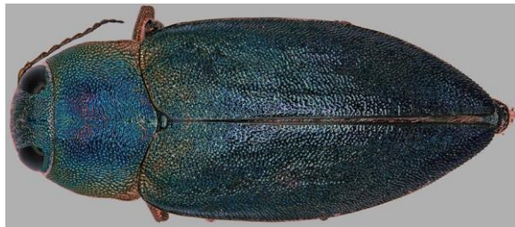
Phaenops gentilis .

Phaenops gentilis . Known as the "green flatheaded pine borer", Phaenops gentilis is likely to be the beetle most commonly encountered in Colorado that can be mistaken for emerald ash borer. It is approximately the same size as the emerald ash borer (9-13 mm) but has a broader body form and the wings are covered with minute punctures. The adults are bright bluish green and have no yellow spots. Phaenops gentilis develops in several species of pine.