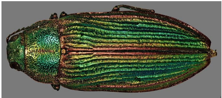
Buprestis intricata .

Buprestis intricata is also associated with lodgepole pine.