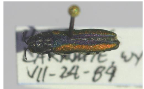
Agrilus pulchellus .