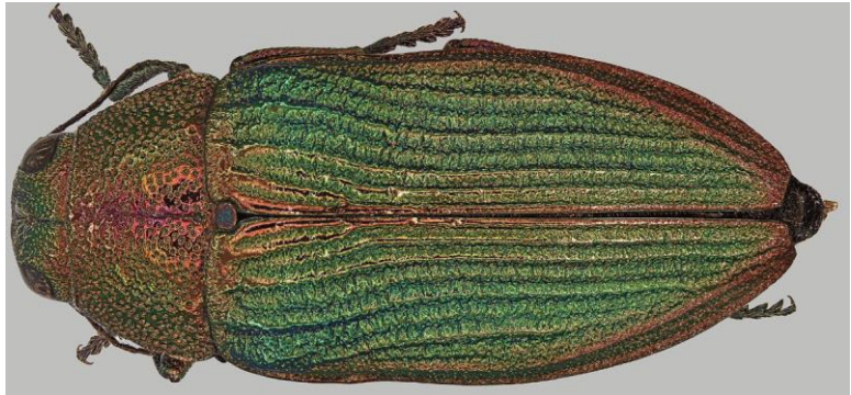
Buprestis adjecta .

Buprestis adjecta is associated with lodgepole pine.