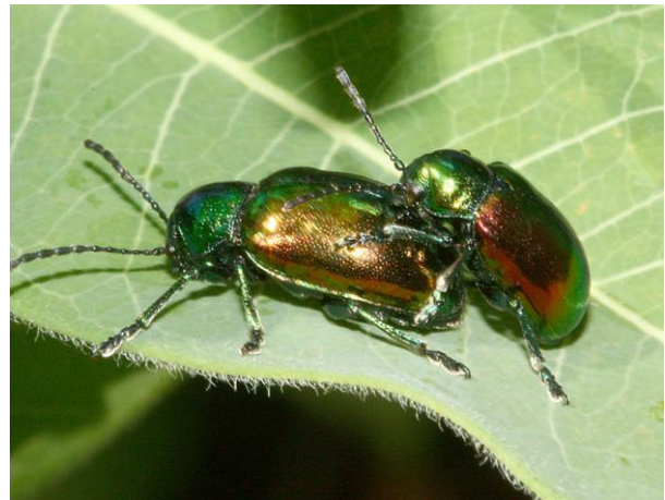
Dogbane leaf beetles.

Apple flea beetle. Apple flea beetle ( Altica foliaceae ) are small (5-6mm) shiny green beetles that are sometimes abundant on leaves of a great many plants, notably evening primrose, grape, Guara , and Epilobium . They jump readily when disturbed.