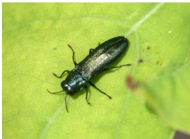
Agrilus cyanescens .

Native Agrilus species. There are a great many Colorado native species of metallic wood borers in the same genus as the emerald ash borer, Agrilus . All are smaller in size and less intensively colored than is the emerald ash borer and most are bronze or reddish brown. But a few have metallic green hues of their wing covers. Examples include Agrilus cyanescens , a blue-green beetle about 6-mm in length that develops as a borer in honeysuckle. Agrilus pulchellus has wings with a green center band, but the wings are bordered by reddish purple. It is known to exist in Weld County and ranges in size from 7-11 mm. In southeastern Colorado Agrilus pulchrellus is present. It is usually bronze, but greenish forms exist.