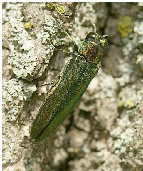
Emerald ash borer on bark.

Perhaps the most conspicuous feature is that the emerald ash borer has uniformly green bright, metallic wing covers, sometimes with slight purplish hues. The thorax may be more metallic brown and underneath the wing covers the abdomen is purple. Adults are active between late May to midAugust and almost always they would be found on the leaves or bark of an ash tree.