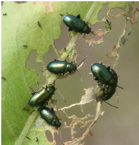
Apple flea beetles

Apple flea beetle. Apple flea beetle ( Altica foliaceae ) are small (5-6mm) shiny green beetles that are sometimes abundant on leaves of a great many plants, notably evening primrose, grape, Guara , and Epilobium . They jump readily when disturbed.