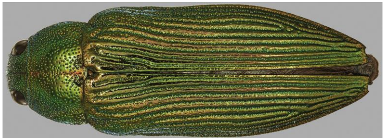
Buprestis langii .

Buprestis langii develops in Douglas-fir.