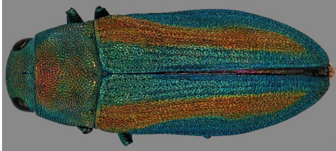
Chrysophana placida .

Chrysophana placida . This is a moderately sized (6-10 mm) metallic wood borer found in the dry cones, trunk and branches of dead pines, true firs, and Douglas-fir. C. placida ranges in color from green to red and usually has a reddish-bronze stripe on each wing cover. This species, sometimes known as the flatheaded cone borer, is common in many areas of the west, but is not considered an economically important pest species of native trees.