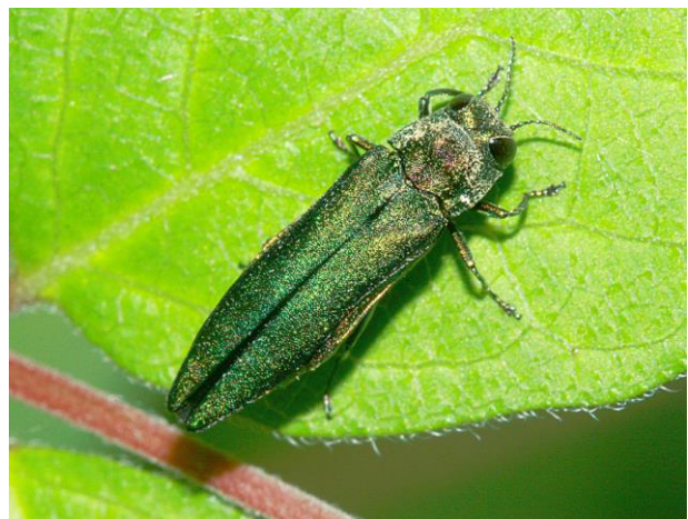
Emerald ash borer on foliage.

Damage to ash trees is caused by the immature (larval) stage of the emerald ash borer, a type of flatheaded borer that develops underneath the bark of ash. A comparison of the damage produced by this stage of the emerald ash borer, and damage produced by other wood boring insects in ash trees is