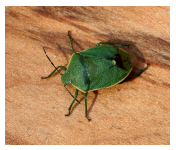
Adults of the (top) Say's stink bug and (middle, bottom) conchuela stink bug.