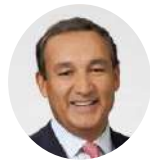
UNITED AIRLINES Oscar Munoz CEO