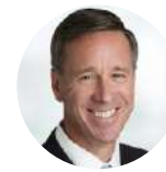
MARRIOTT Arne Sorenson President & CEO