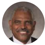
CARNIVAL CORPORATION Arnold Donald President & CEO