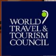
The WTTC Executive Committee