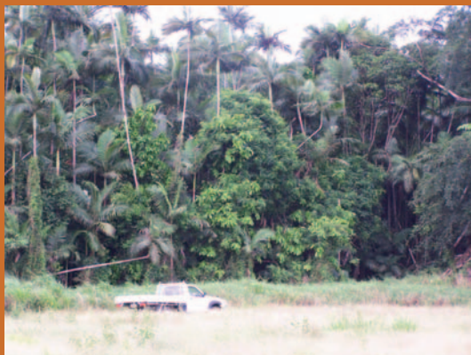
The delineation between an intact palm swamp and land cleared for agriculture

The most significant threats to Queensland's palm swamps in the past have been large-scale clearing for agricultural and urban development, and associated wetland drainage. As palm swamps are now endangered there are legal restrictions on clearing within these ecosystems. The challenge will be to maintain the remaining fragments in as healthy a condition as possible and to re-establish linkages across the landscape where the wetlands have become isolated. This will not be possible in all cases, and a strategic, regional approach to the maintenance of the palm swamp is required.