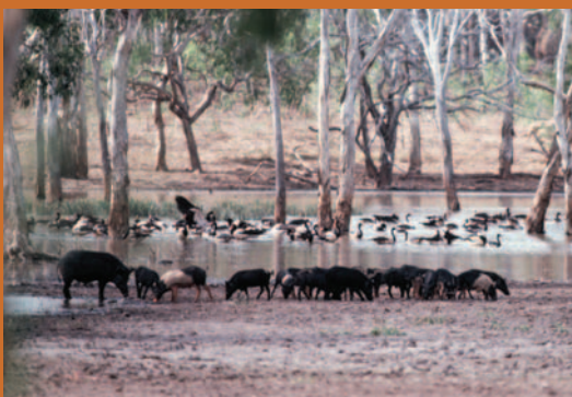
Feral pigs Sus scrofa can damage all types of wetlands.

Feral pigs Sus scrofa cause problems in wetlands by damaging habitat, competing for food with native species, disturbing nests, feeding on eggs and young of native animals, and spreading disease. They are considered the major pest animal of the Wet Tropics, particularly because of their fondness for rooting around the edges of watercourses and swamps, which disturbs the natural vegetation, degrades water quality, causes soil erosion, and promotes conditions that favour weed growth.