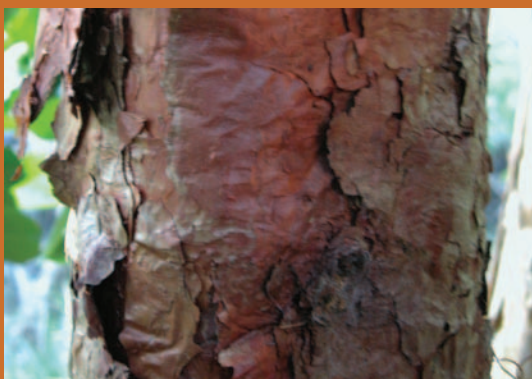
Golden guinea flower Dillenia alata is typically found in feather palm swamps and has distinctive bark.