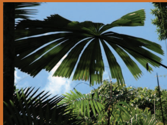
Fan-shaped leaves of the fan palm Licuala ramsayi

Fan palms have almost circular fan-shaped leaves up to 2 m across. In palm swamps they are slow growing, reaching up to 20 m tall, with other scattered emergent trees, including sclerophyllous species, to 36 m. In contrast to feather palm swamps, fan palms constitute only up to 20 per cent of the total number of stems in any site, and these are predominantly mature trees rather than seedlings, since fan palms have low seedling numbers with commonly only 50–500 per hectare. There is greater plant species diversity here than in the feather palm swamps with 247 plant species recorded in recent studies. Of these 60 per cent are trees, with around 20 species present in most fan palm swamps and also in adjacent vine forest and swamp forest types. The fan palm swamps also host a variety of shrubs, vines, epiphytes and herbs .