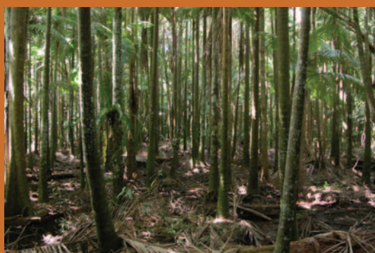
Up to 150 000 feather palms can be found per hectare of feather palm swamp.