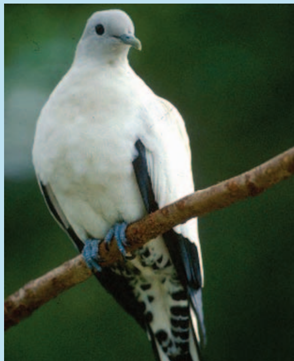
The Australian pied imperial pigeon Ducula bicolor feeds in palm swamps.

The pigeons are now considered common, but populations suffered dramatically in the past from hunters because the birds made easy targets with their daily commuting between the islands and the mainland, and from reduction of their feeding habitat due to clearing for agricultural and urban development. Numbers are now recovering.