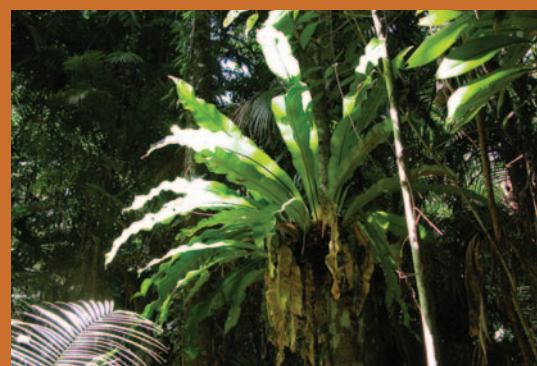
Climbing swamp fern Stenochlaena palustris and bird's nest fern Asplenium nidus are commonly found in feather palm swamps.