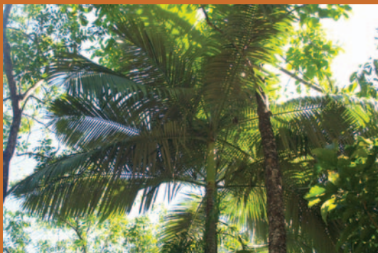
Featherlike leaves of the feather palm