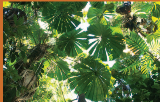
Fan palms are found with other scattered emergent trees in fan palm swamps.