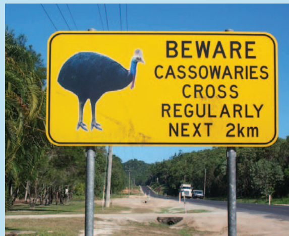
Traffic poses one of the greatest threats to the cassowary Casuarius casuarius johnsonii .