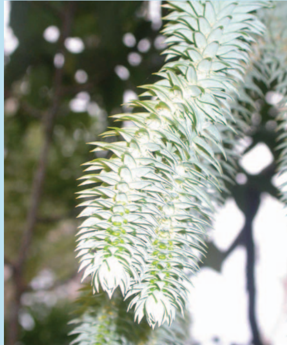
The endangered blue tassel fern Huperzia dalhousieana has recently been rediscovered in a palm swamp.

The blue tassel fern is much admired as a potential ornamental plant, being a distinct and large species of tassel fern. In China, tassel ferns are harvested from the wild for the production of huperzine, a chemical compound used in the treatment of Alzheimer's disease. It may be possible to produce the drug from Queensland's blue tassel fern, and further study is currently being undertaken at James Cook University. The ferns are currently very difficult to propagate and keep alive in cultivation.