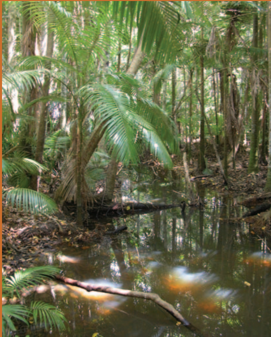
A feather palm swamp