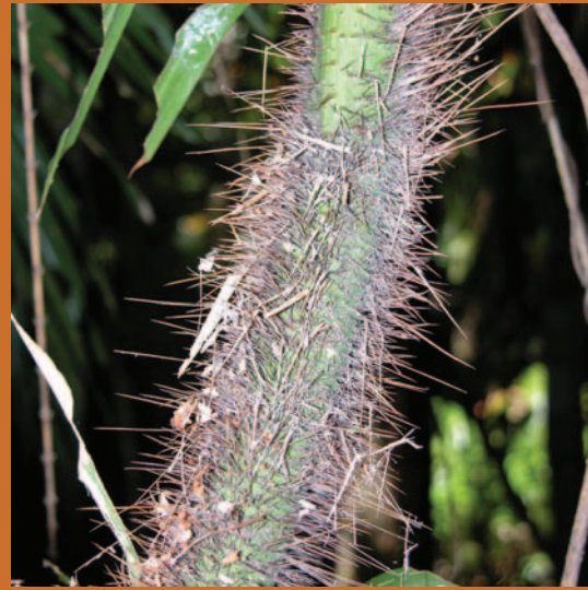
Calamus spp. are climbing palms with spiny stems, leaves and entangling appendages. They are commonly known as 'hairy Mary', 'wait-a-while' or 'lawyer cane.'

Floristically, there are two distinct fan palm swamp variants: a northern Daintree variant and a southern variant (for example in Mission Beach). Typical fan palm swamp species include Acacia celsa , brown salwood A. mangium , candlenut tree Aleurites moluccana , pink ash Alphitonia petriei , white cheesewood A. scholaris , Chrysophyllum sp., cinnamon laurel Cryptocarya grandis , rusty laurel Cryptocarya mackinnonian , spicy mahogany