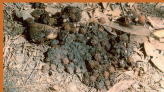
Cassowaries play an important role in dispersing rainforest seeds.

important because they eat fruit that are too large to be eaten by any other species, including the fruit of the fan palm. Cassowaries use a variety of habitat types, including rainforests, swamps, mangroves, melaleuca and various eucalypt woodlands.