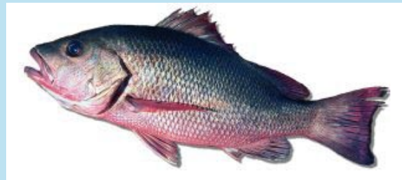
Mangrove jack Lutjanus argentimaculatus .

The mangrove jack Lutjanus argentimaculatus is a member of the snapper family that occurs mainly in tropical marine waters of the Indo-West and Central Pacific and in Australia it ranges around the northern half of our coastline. Mangrove wetlands are important for this fish because juveniles frequent mangrove estuaries and tidal rivers. Adults prefer reef and sheltered marine habitats to depths of over 100m. Young are typically red-brown or copper coloured and may show pale bars on their sides, but with age become pale and often have a pearly mark in the centre of each scale (hence the scientific name argentimaculatus , meaning "silver spotted"). Individuals reach maturity in about three years and eventually can grow to over 1.2m in length and weigh up to 16kg.