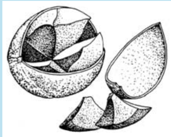
The distinctive fruit of the cannonball mangrove Xylocarpus granatum can be as large as 20cm in diameter, containing up to 18 tightly-packed seeds. The fruit explodes on ripening and the seeds disperse with the tide.

The cannonball mangrove Xylocarpus granatum has a combination of features that is unique among Queensland mangroves. Its mottled, flaky, pale pink-orange trunk is supported by buttress roots that often extend outwards dramatically as thin vertical planks and/or networks of above-ground ribbons. The title “cannonball mangrove” is derived from the large round fruit, golden-brown when ripe, that comprises 12 to 18 seeds tightly packed inside a hard case (hence the name “monkey-puzzle nuts”). North Queensland beaches may be littered with these seeds. This mangrove tree may stand up to 25m high, especially beside rivers through mangrove wetlands of the Wet Tropics. In some Pacific Island countries its pale timber is highly prized for carving of wooden artefacts. The related cedar mangrove X. mekongensis has quite different roots, bark and fruit.