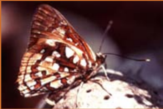
The vulnerable Apollo jewel butterfly Hypochrysops apollo apollo .

Illidge's ant-blue butterfly or mangrove butterfly Acrodipsas illidgei of south-east Queensland is another vulnerable (NC Act) insect that uses the mangrove wetlands as its primary habitat. It prefers wetlands dominated by the red (spotted) mangrove and the grey mangrove from which the females very occasionally feed on the flowers. They are also found in adjacent woodlands of Corymbia spp. and swamp she-oak Casuarina glauca where their associated ant Crematogaster sp. occurs in dead branches or under bark of the older trees.