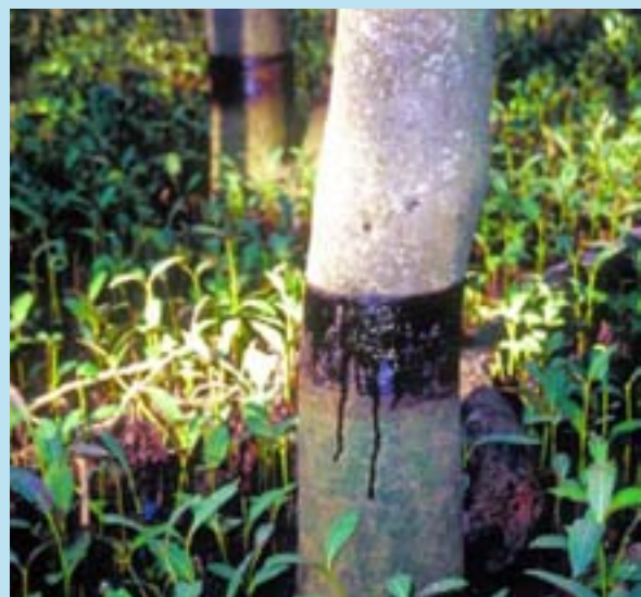
Oiled grey mangrove Avicennia marina in the Brisbane River at Bulwer Island after a fuel oil spill in the harbour in 2001.

Thirdly, once oil has entered the mangrove wetland, managers should map and quantify the oil, collect surface sediments for analysis and document oiled and dead mangrove fauna and flora. Finally, once oil has killed mangroves, the areas of tree death should be mapped and species identified, and natural recruitment of seedlings should be promoted (replanting is not necessarily advocated) until recovery becomes self-sustaining (see www.aims.gov.au/pages/research/mangroves/fae/fae01.html for full details.)