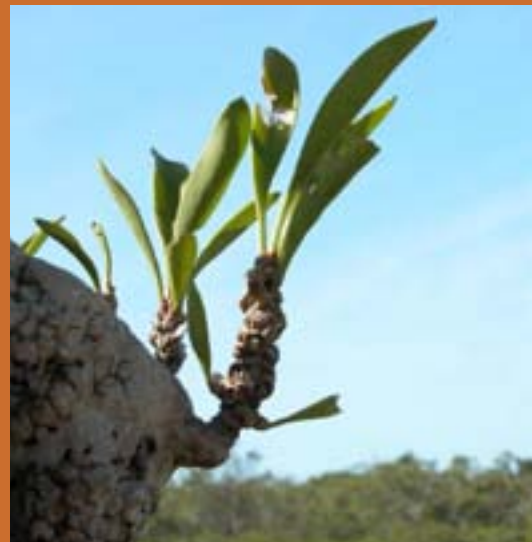
Ant plant Myrmecodia beccarii .

The vulnerable epiphytic ant plant Myrmecodia beccarii (NC and EPBC Acts) grows in the canopy of mangrove and melaleuca wetlands of northern Queensland. The ant plant has enlarged stems that form a tuberous structure and as the plant grows, hollow chambers form within the plant, allowing the golden ant Philidris cordatus to colonise it. Caterpillars (hatched larvae), of the vulnerable Apollo jewel butterfly Hypochrysops apollo apollo (NC Act) have glands that secrete a sugary substance that attracts the golden ant and after hatching, are carried inside the plant by the ants. In the process of feeding, the larvae further enlarge the ant galleries and over many generations can eat out the host plant and leave only its shell. No more than one larva is generally found in any one plant. The butterfly larvae feed primarily on the internal tissue of the ant plant and sometimes on the leaves at night.