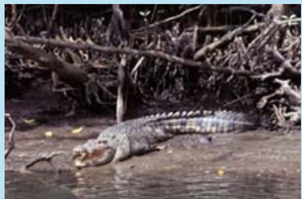
Estuarine crocodile Crocodylus porosus basking under mangroves.

Despite occurring from India to Australia, the vulnerable (NC Act) estuarine crocodile Crocodylus porosus has declined markedly in Asia, thereby increasing the conservation value of the sizeable protected population in Australia. In Queensland, this crocodile occurs in mangrove wetlands, estuaries and associated wetlands (fresh and saline) from the Gulf of Carpentaria to the Fitzroy River delta in Central Queensland. In tidal rivers, crocodiles up to two metres long feed mainly in the mangrove wetlands during the dry season, a time of scarce resources. Mainly a nocturnal feeder, the crocodile captures crabs, prawns, mudskippers and other small fish when it is young; when it is mature, mud crabs remain an important food and larger prey such as birds, pigs and wallabies form part of its diet. Mangroves provide shade for the cold-blooded crocodile in hotter months. Most adults are less than 4–5m long. Estuarine crocodiles present a management challenge to the Queensland Parks and Wildlife Service and other authorities: to protect people from crocodiles but also to protect crocodiles.