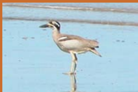
The vulnerable beach stone-curlew Esacus neglectus can sometimes be found in mangrove wetlands.

Occasionally, the vulnerable beach stone-curlew Esacus neglectus (NC Act) is recorded on mudflats within mangrove wetlands (see Appendix 2).