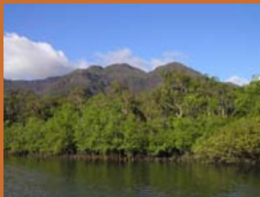
Mangrove apple Sonneratia spp., Hinchinbrook Island.

One hybrid, Lumnitzera x rosea , is considered endemic to Queensland and within Australia, the mangroves Dolichandrone spathacea and mangrove apple Sonneratia caseolaris are found only in Queensland mangrove wetlands. Endemics are few because mangroves are widespread in Australia and are dispersed by floating seed capsules.