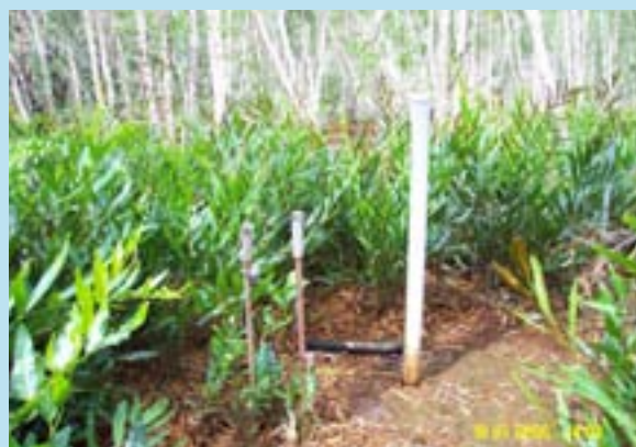
Mangroves (above) and mangrove ferns Acrostichum speciosum (below) are beginning to recolonise East Trinity.