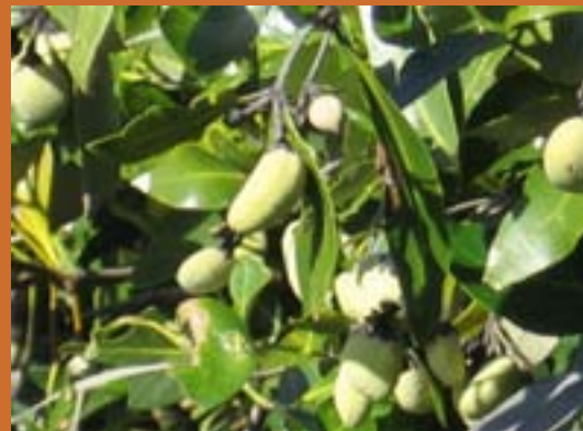
Fruit of the grey mangrove Avicennia marina .

To reproduce in the harsh seawater regime, many mangrove seeds germinate before leaving the parent tree. The seedling grows out through the fruit (for example Rhizophora and Ceriops spp.) or within the fruit ( Avicennia and Aegiceras spp.) as a propagule , ready to develop into an independent plant. On falling into the water the floating propagule becomes dormant and disperses with currents and wind, until lodging in substrate and starting to grow. However, some mangroves (for example Lumnitzera spp.) reproduce in the same way as most other trees.