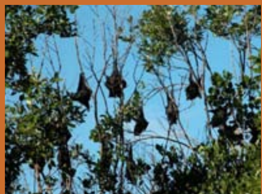
Black flying-fox Pteropus alecto roost in mangrove wetlands.