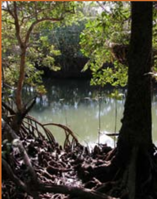
Mangrove wetlands along a tidal creek.

Where the sediments are gently sloped and/or the tidal range is low, the mangrove wetlands may not be as deeply or extensively dissected by tidal channels as on steeper coast, where tidal range is high and/or where there are numerous inflowing streams from the inland. The spatial pattern of mangrove wetlands therefore is diverse. They can be linear along simple coastlines, branching where there are many tidal creeks such as those penetrating broad salt flats behind the coastline or block-like around major deltas of rivers or in the shelter of near shore islands (for example the Hinchinbrook area).