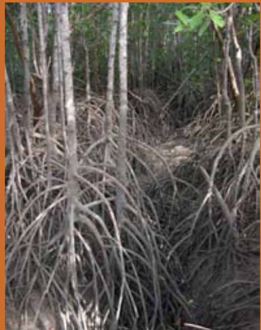
Prop roots of Rhizophora spp..

A feature of the floor of mangrove wetlands is the roots ( pneumatophores ) of mangroves, which appear above the mud substrate. These have (collectively) a large surface area, with spongy tissue and many pores, to allow oxygen to pass to roots in the mud. Oxygen is generally limited in mangrove wetlands due to tidal inundation and the oxygen-depleted (anaerobic) mud. Membranes in surface cells of the roots exclude up to 90 percent of the salt in seawater although some enters and is secreted via the leaves, or stored in the bark and older leaves — sometimes at high concentration — until they fall. (Mangrove leaves are well adapted to reduce loss of precious fresh water, some being succulent, having thick waxy skins or variable pore openings.) The roots provide habitat for fish, crabs, molluscs , other invertebrates and birds and their form varies among mangrove species or may occur in combination: peg or snorkel roots for Avicennia and Sonneratia spp., stilt or prop roots for Rhizophora spp., knobby/knee roots for Bruguiera spp., and buttress, plank or ribbon roots for cannonball mangrove Xylocarpus granatum (see box). Mangrove roots also provide support in soft, unstable mud.