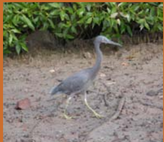
Eastern reef egrets Egretta sacra feed in mangrove wetlands.