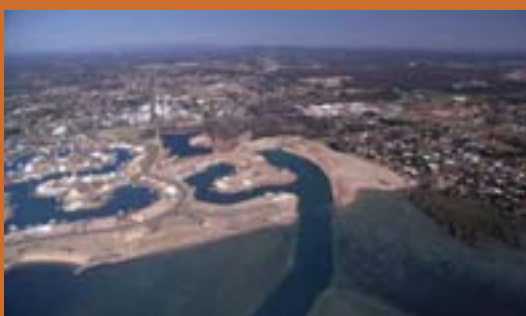
Mangrove wetlands have been replaced by canal estate developments in some areas.

With this complex tenure scenario and diversity of managers and stakeholders, it is vital that an integrated approach to management of mangrove wetlands is undertaken. In the past, development in the coastal zone often has been unplanned and unregulated resulting in the loss and degradation of mangroves in a number of areas, for example by the construction of canal housing estates in mangrove wetlands. Today, town and coastal plans provide the basis for a holistic and comprehensive solution, facilitating linkages between responsible government agencies, scientific institutions and the wider community.