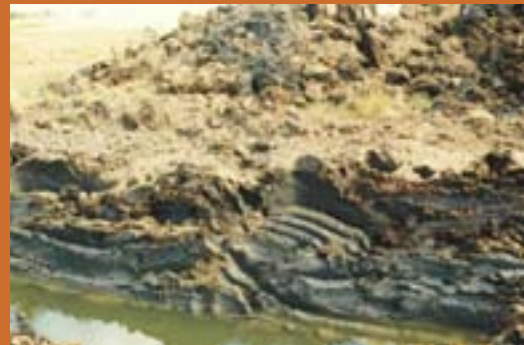
Potential acid sulfate soils (also called “marine mud” or “mangrove mud”) are typically dark grey, wet and sticky. They can range from sand to clays.

A State planning policy for ASS ( State Planning Policy 2/02: Planning and Managing Development Involving Acid Sulfate Soils and associated State Planning Policy 2/02 Guideline: Acid Sulfate Soils — www.nrm.qld.gov.au/land/ass/qassit/planning_policy.html ) came into effect in 2002. For any development on land, soil or sediment at or below five metres above sea level the policy requires that the release of acid and associated metal contaminants into the environment be avoided by either not disturbing the soils, or by treating and managing the soil and associated drainage water. Prior to disturbing the soil a management plan must be developed in consultation with a soil scientist or engineer with experience in ASS. After disturbance ongoing monitoring at the site is essential. Further information regarding ASS and its management is available from the Queensland Department of Natural Resources and Mines ( www.nrm.qld.gov.au/land/ass/what_are_ass/index.html ). Local development control plans, regional coastal zone plans and building codes may also provide additional information.