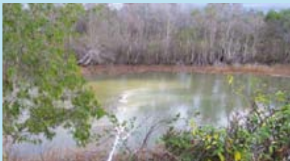
Treating an acidic water body at East Trinity with a hydrated lime slurry.

floodgates to progressively allow seawater into low-lying areas to neutralise the acid in combination with the application of a hydrated lime (calcium hydroxide) slurry. The installation of “smart gates” is intended to ensure the soils are exposed to consistent inundations of seawater on a daily basis. Results within this sub-catchment to date have been promising, with mangroves and mangrove ferns naturally regenerating, soldier crabs recolonising and some fish species being found in the surrounding waters. The Department of Natural Resources and Mines (NR&M) will use $4 million of State funding over the next four years to introduce similar techniques within the Firewood Creek sub-catchment as well as manage the broader site’s ASS issues. The aim is to ensure the water discharged from the site meets national water quality guidelines. Techniques trialled at the site may be useful for similarly damaged areas within Queensland and internationally.