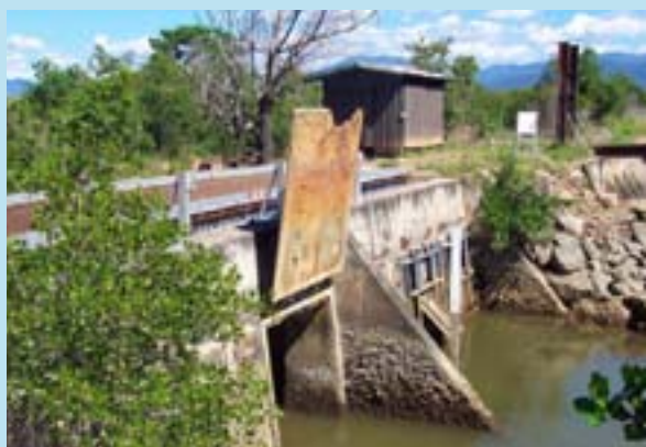
The floodgates on Hills Creek at the seawall, East Trinity, Cairns are being altered to allow seawater into low-lying areas to neutralise acid in combination with a hydrated lime slurry.