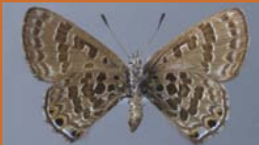
Mangrove wetlands provide habitat for the vulnerable Illidge's ant-blue butterfly Acrodipsas illidgei . These images show the different colours of a male's wings from above and below.

The water mouse or false water-rat Xeromys myoides , listed as vulnerable under the Commonwealth EPBC Act, the Queensland NC Act and on the IUCN Red List (see Saltmarsh wetlands management profile www.epa.qld.gov.au/nature_conservation/habitats/wetlands/wetland_management_profiles/ ), feeds among mangroves by night at low tide eating crabs and other small crustaceans, shellfish and flatworms. It nests in either large termite-like mud mounds, hollow bases of large decayed eucalypt stumps near the mangrove zone or in simple tunnels above the high water mark. It has been found in small numbers in the Proserpine-Mackay, Wide Bay, Great Sandy and Moreton Bay districts. Destruction of mangrove habitat for urban, industrial, mining, marine and agricultural development, or disassociation of mangroves from saltmarsh breeding sites, as well as predation by feral animals are potential threats to this species. It is also vital that water quality and natural hydrology (normal tidal and freshwater patterns and an undisturbed water table) be maintained when conducting activities on or adjacent to false water-rat habitat.