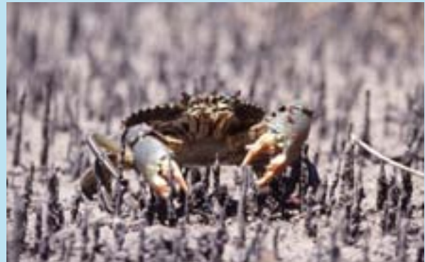
Mud crab Scylla serrata prefers sheltered habitat of estuaries and intertidal flats. It makes characteristic oval burrows in muddy banks of estuaries and mangrove flats.

The mud crab Scylla serrata is widespread in the Asia Pacific region and in Australia it occurs on the northern and eastern coastline in estuaries and intertidal flats including mangrove wetlands. Spawning occurs in open ocean waters but the crabs prefer sheltered, shallow waters with a soft, muddy floor, hence mangrove wetlands provide good habitat. Mud crabs are dark brown, green and/or blue in colour and have a smooth, broad carapace (body shell) and flattened hind legs for swimming. Using its rugged claws, the mud crab eats barnacles, bivalves, other crabs and dead fish and is an omnivorous scavenger. Males of this crab can grow to more than 25cm in shell breadth and 2kg in weight, which is why it is popular as food for humans. It is a regulated crab in Queensland to prevent over-harvesting (see www.dpi.qld.gov.au/cps/rde/xchg/dpi/hs.xsl/28_1203_ENA_HTML.htm for further information including size and take/possession limits). In year 2000, the gross value of mud crabs harvested between Cape Tribulation and Bowling Green Bay was $1.7 million. Attempts have been made to establish commercial aquaculture of mud crabs to fulfil this demand.