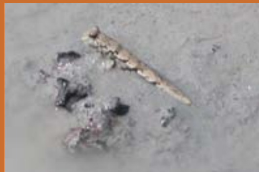
Mudskippers are a conspicuous inhabitant of mangrove wetlands and have specially adapted fins for moving across mud and climbing mangrove roots.

Stocks of fishes such as mangrove jack Lutjanus argentimaculatus (see box), barramundi Lates calcarifer , snapper Pagrus auratus , blue threadfin Eleutheronema tetradactylum , sea mullet Mugil cephalus and bream Acanthopagrus australis , also banana prawns Penaeus merguensis and king prawns Penaeus plebejus , which are captured in commercial or recreational fisheries — though not necessarily in the mangrove wetlands — are to some extent dependent on the availability of mangrove nurseries. Banana prawns are typically caught by trawling in coastal waters adjacent to major estuarine nursery areas. Juvenile stages of some non-commercial fishes also live in mangroves and on migrating to the open ocean they become the food source of sport-fished marlin Scorpaenidae spp. and other billfish.