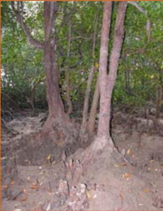
Knobby roots of Bruguiera spp..