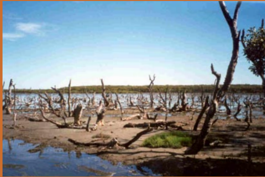
Waterlogging has killed mangroves at Luggage Point.

Following the proliferation of such structures over past decades, often for development of ponded pastures , the State Government introduced controls. The Queensland Policy for Development and Use of Pounded Pastures (DNRM, 2001) and the Queensland Fisheries Act 1994 prevent and control the construction of barriers to tidal flows in wetlands subject to tidal inundation such as mangroves and saltmarshes. A Development Approval for Waterway Barrier Works is required under the Integrated Planning Act 1997 for the building of a new barrier or raising an existing structure across any waterway and in the event of an approval, applicants may be required to construct a “fishway” to enable fish migration into and out of the mangrove or saltmarsh nursery areas.