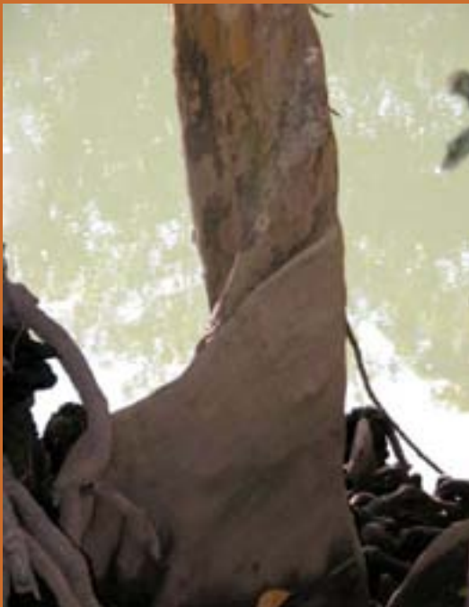
Buttress roots of the cannonball mangrove Xylocarpus granatum . Photo: Roger Jaensch, Wetlands International

Photo: Roger Jaensch, Wetlands International