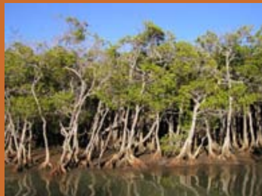
Mangroves Ceriops sp. in Bowling Green Bay National Park.

A number of protected areas in Queensland contain substantial areas of mangrove wetlands (see Appendix 1), for example Cape Melville, Jardine River, Endeavour River, Daintree, Edmund Kennedy, Hinchinbrook Island, Halifax Bay Wetlands and Lakefield National Parks and a number of island national parks in the north; Byfield, West Hill, Conway, Cape Upstart and Bowling Green Bay National Parks in central Queensland; and Bribie Island, Burrum Coast, Eurimbula and Southern Moreton Bay Islands National Parks in south-east Queensland. Many areas of mangroves along the east coast of Queensland are protected under Management Areas within the State Great Barrier Reef Coast Marine Park, Woongarra Marine Park, Hervey Bay Marine Park and Moreton Bay Marine Park. Each park is subject to different management zones with specific zoning plans. The Commonwealth Great Barrier Reef Marine Park covers subtidal areas (that is seaward of low water mark) along the length of Queensland's coastline and therefore does not generally encompass mangrove communities.