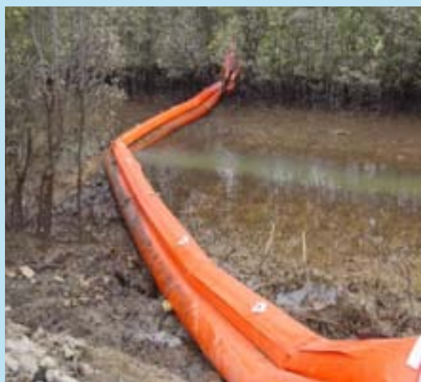
A boom to reduce the effects of a large oil spill across an Avicennia marina mangrove-bordered drain at Lytton on the Brisbane River.