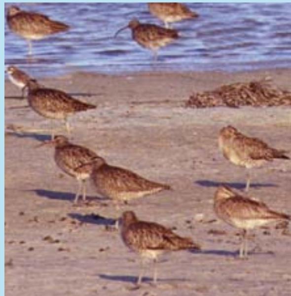
The whimbrel Numenius phaeopus migrates for the austral summer from its breeding grounds in the Arctic Circle and feeds and roosts in mangrove wetlands.

From breeding grounds in north-east Asia, the whimbrel Numenius phaeopus travels over 10,000km to Queensland in August-October, and back again in March-May, each year. It is one of the larger shorebirds that visit Australia and its remarkable migration requires a substantial energy reserve to be accumulated. Securing shrimps, crabs, worms and other benthic food items by probing its curved beak deep into soft mud, the whimbrel ranges across intertidal mudflats and along creeks and river banks through mangrove wetlands. At high tide, it commonly roosts on mangrove trees beside channels until it can resume feeding. Excessive disturbance of feeding or roosting whimbrels caused by passage of boats may increase the effort that this bird needs to invest in preparing for migration. This might be avoided by reducing boat speeds and appropriate timing of boat travel and exclusion of boats around key roost sites. Pollution of water entering mangroves and subsequent loss of benthic feed should also be avoided. Whimbrels occur around the entire Australian coastline and their population size in the East Asian — Australasian Flyway is estimated to be 55,000 birds ( www.wetlands.org/pubs&/pub_online/WPE/165-171.pdf ). Five sites in Queensland,