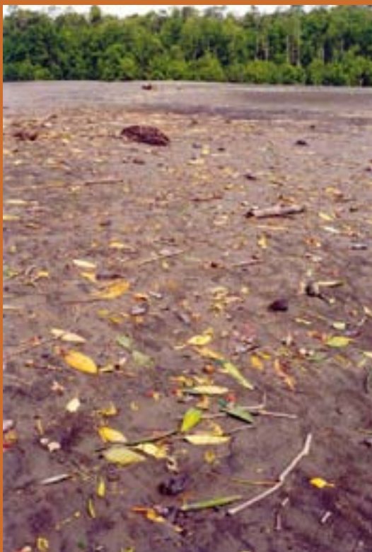
Mangrove leaf litter forms an important part of the food chain of a mangrove wetland.

Crustaceans and molluscs are the most conspicuous abundant animals in mangrove wetlands. Around 60 species of crabs live in mangrove wetlands. Some cling to trunks and roots at high tide; others such as fiddler crabs emerge from mud burrows at low tide and display their enlarged orange claws; others occupy abandoned shells. Certain species play an important role in consuming mangrove leaf litter or algae and detritus on the substrate, thereby assimilating nutrients into the food chain. The mangrove or mud crab Scylla serrata (see box) is commercially harvested. The mud lobster Thalassina anomala constructs a mud tower at its burrow entrance on the floor of the forest. Mud whelks Pyrazus ebininus , mangrove oysters Saccostrea commercialis and barnacles can be seen around tree bases or attached to tree trunks and roots. Loud click sounds are made by pistol shrimps. Other invertebrates may be less conspicuous but no less important: polychaete worms are part of the benthic fauna and shipworms associate with rotting wood. Human visitors are well aware of the abundance of mosquitoes and sandflies in mangrove wetlands.