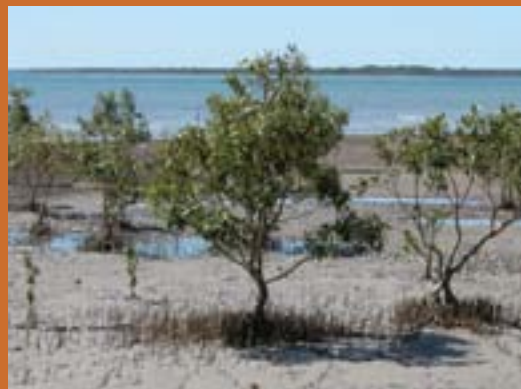
The grey mangrove Avicennia marina is the most common mangrove species in Queensland.

Many of these plants occur only in mangrove wetlands though some, such as the fern Acrostichum speciosum , may also occur as minor elements of wetland or dryland forest, or riverine forest, in the coastal zone.