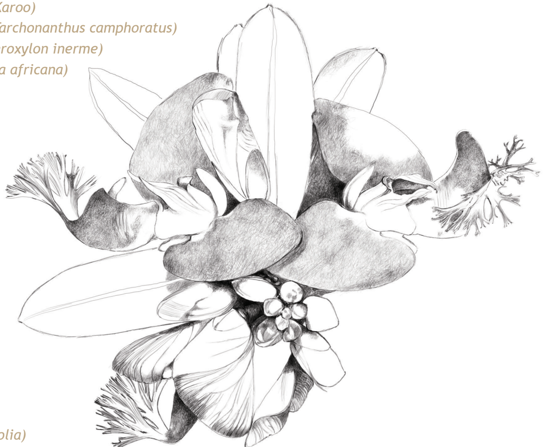
September bush ( Polygala myrtifolia )