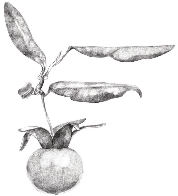
Star-apple ( Diospyros simii )