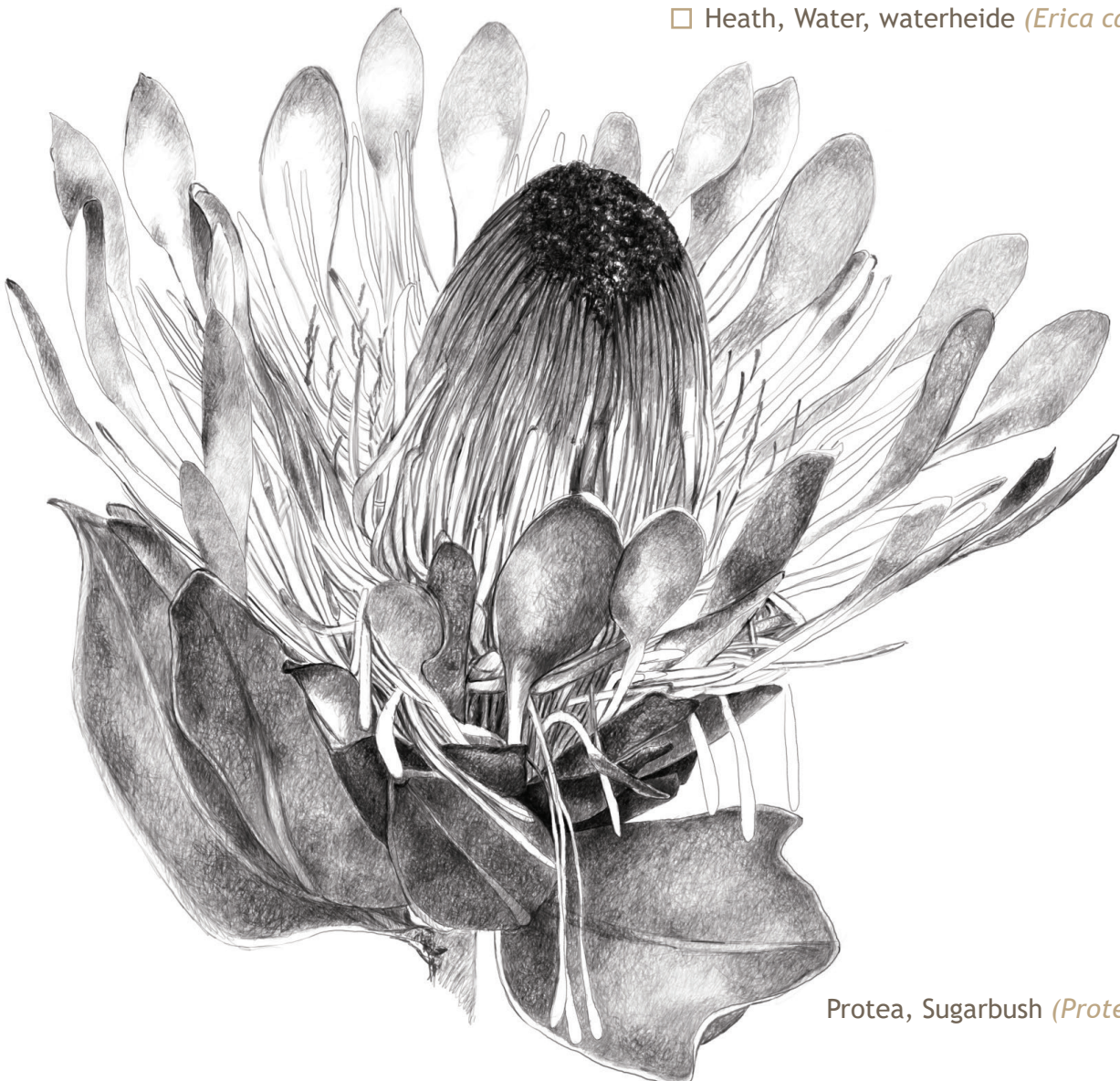
Protea, Sugarbush ( Protea eximia )